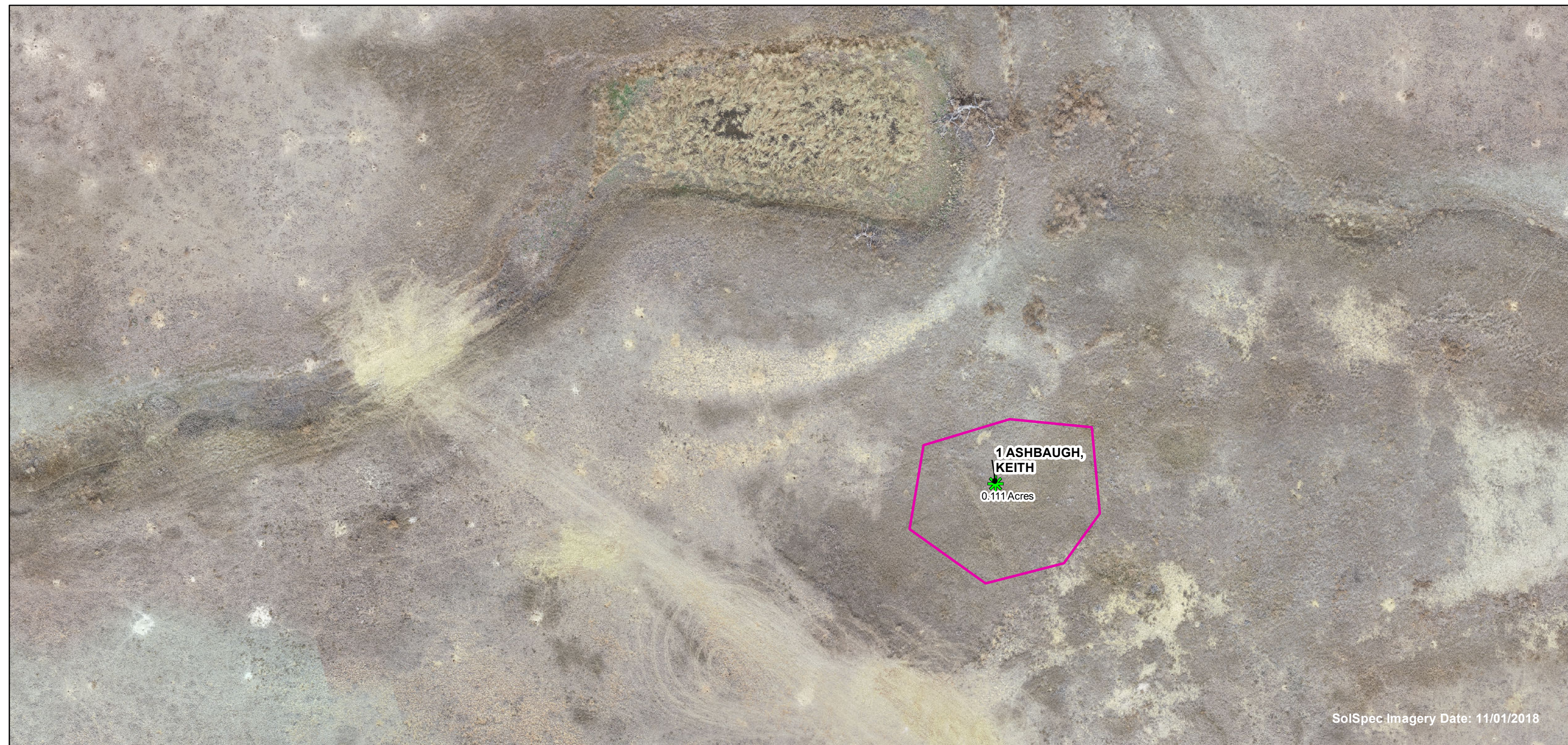
Exhibit 1 - Keith Ashbaugh 1