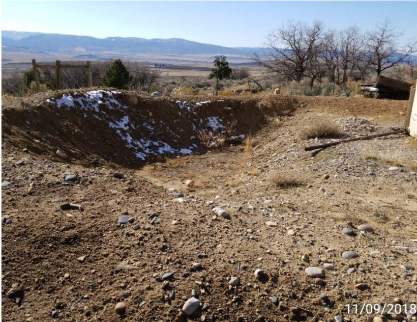
Photo 5. Pit in inside tank berm.