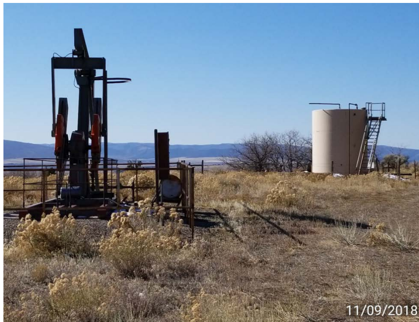
Photo 1. Location looking southwest.