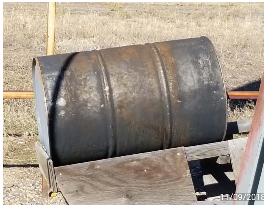
Photo 4. Barrel without label or containment next to wellhead.