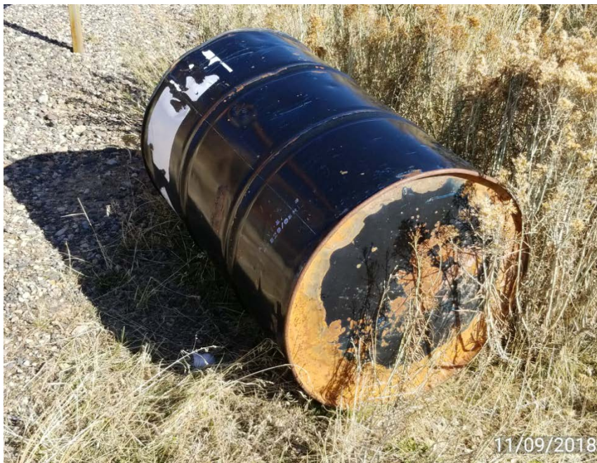
Photo 3. Debris on location next to wellhead.