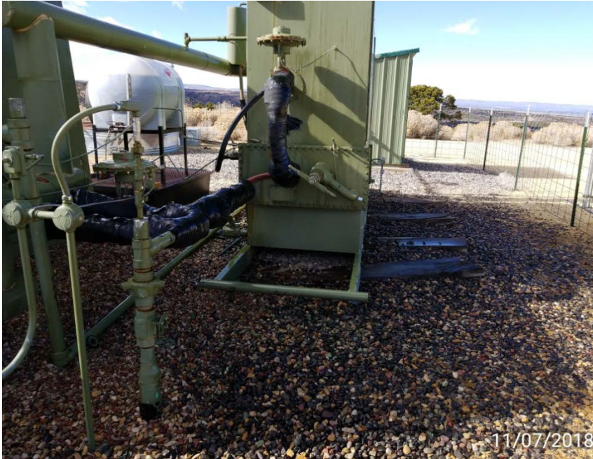
Fluid on ground next to separator