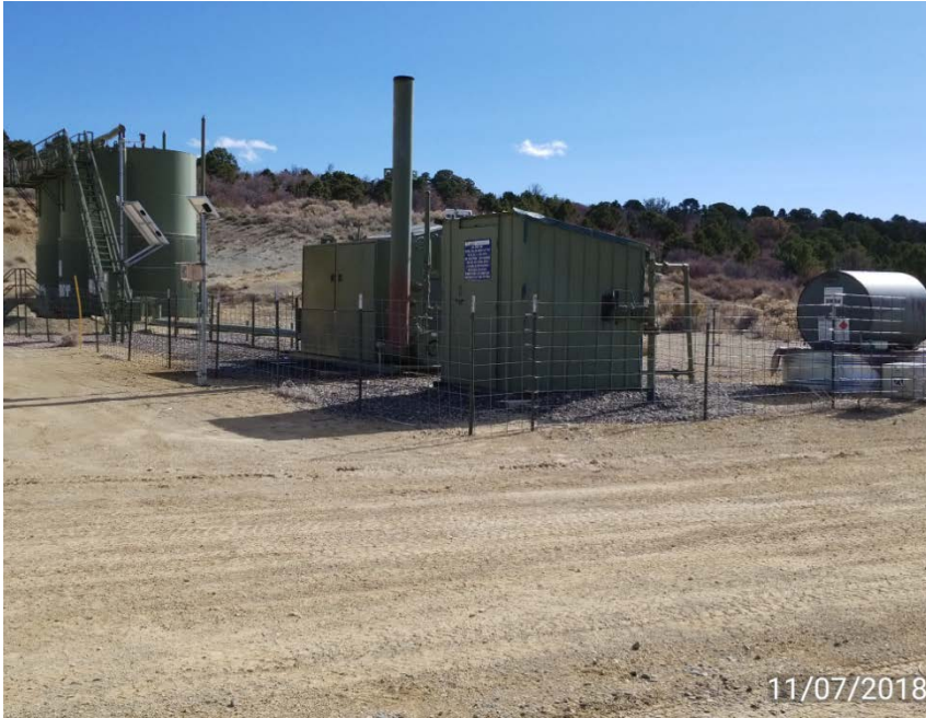
Location looking south

Inspection: 679701673 Fluid spraying out