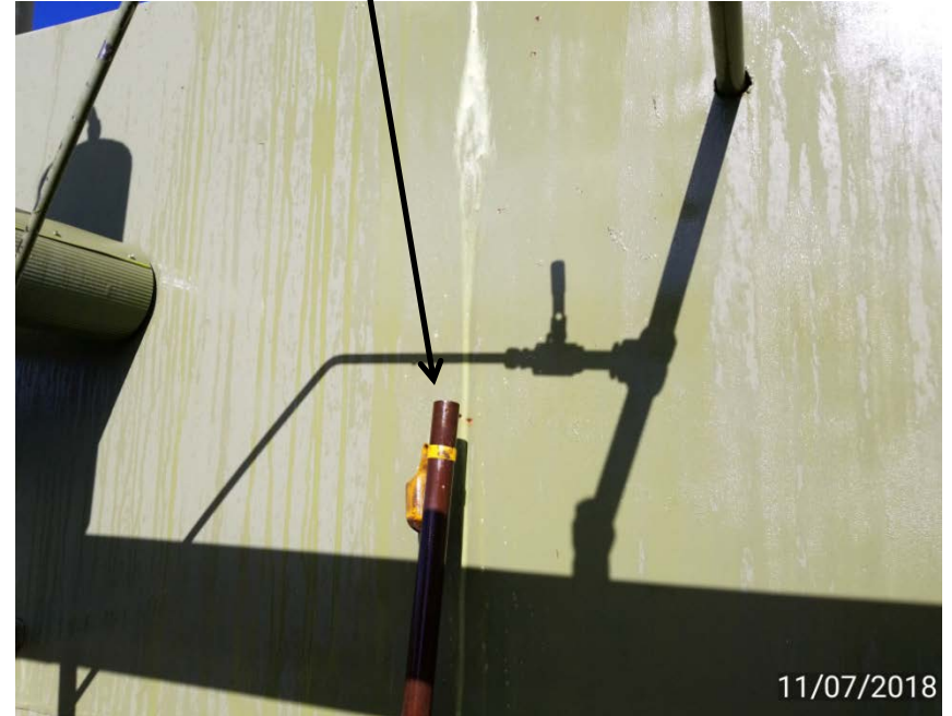
Fluid is sprayed out every 3 seconds from pump next to separator into air 2' to 4'.