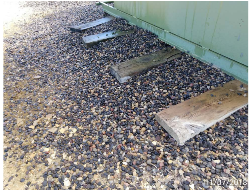
Fluid on ground next to separator