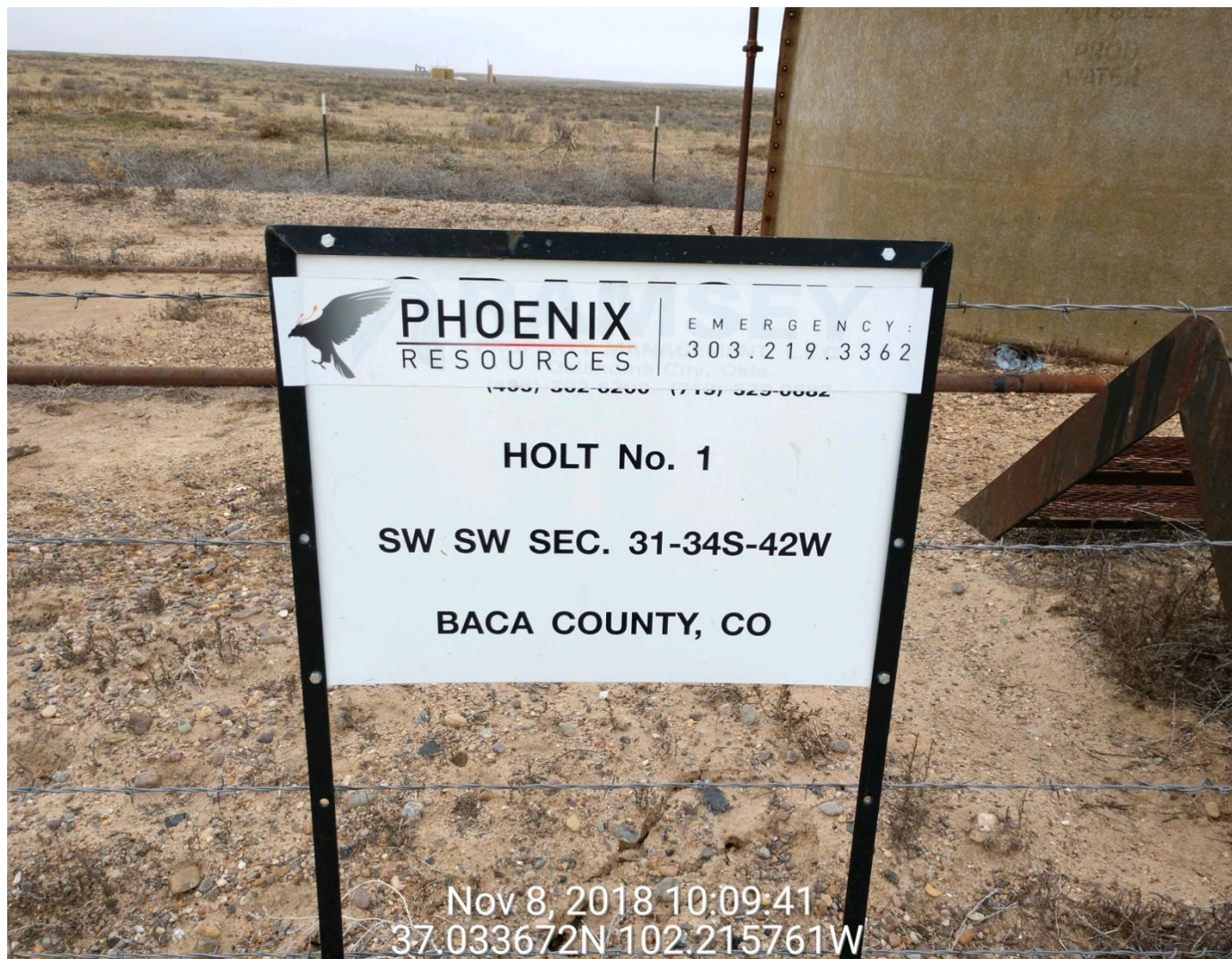
Tank battery lease sign

Location Name: Holt 1 433758 Inspection Date: 11/9/2018