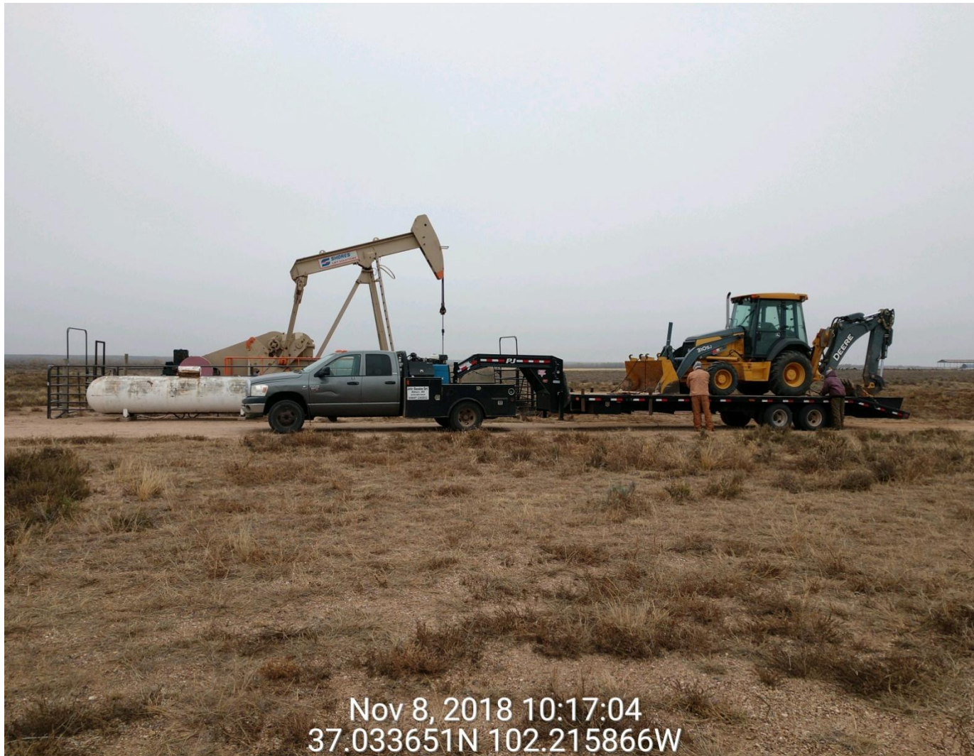
Roustabout crew on location

Location Name: Holt 1 433758 Inspection Date: 11/9/2018