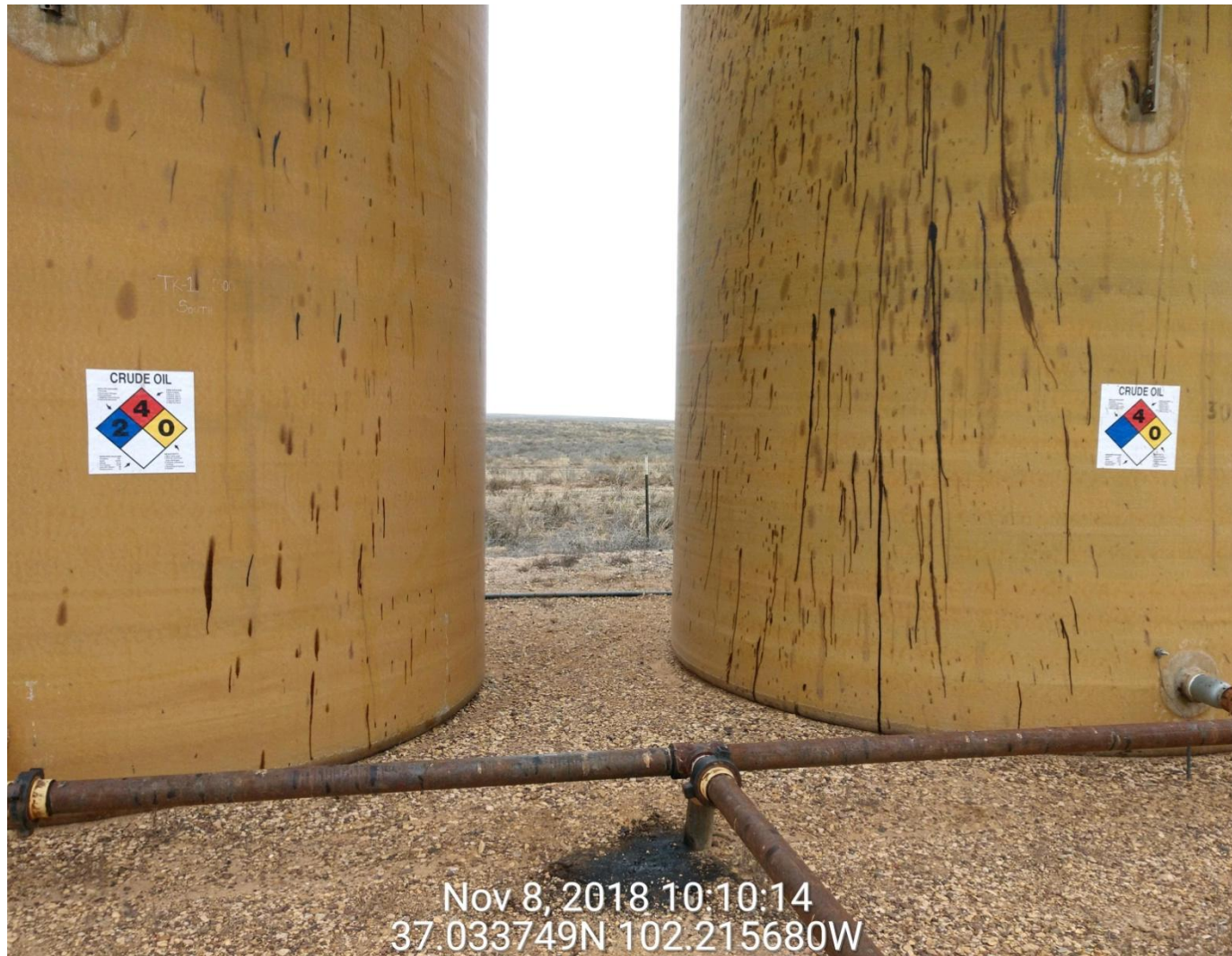
Evidence of tank overflowing and stained soil in containment.

Location Name: Holt 1 433758 Inspection Date: 11/9/2018