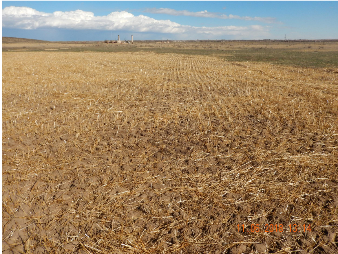
Photo 1. Photo taken from the southern location, facing East. Well has been plugged and abandoned. Photo illustrates final reclamation activities (i.e., straw crimped mulch and seeded). Operator shall continue to control weeds and erosion until the Location meets Rule 1004 standards.