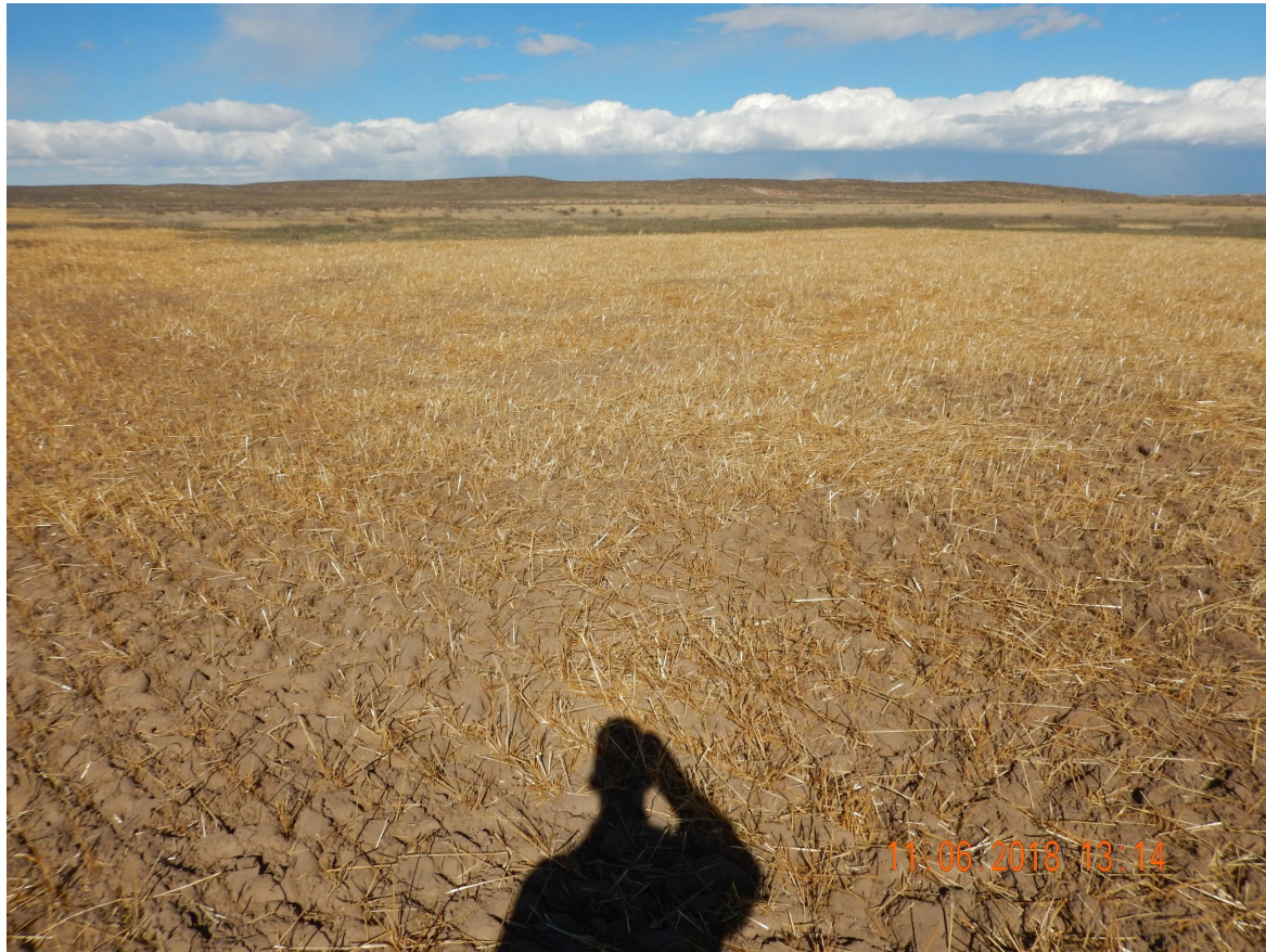
Photo 2. Photo taken from the southern location, facing North. See comments under Photo 1.