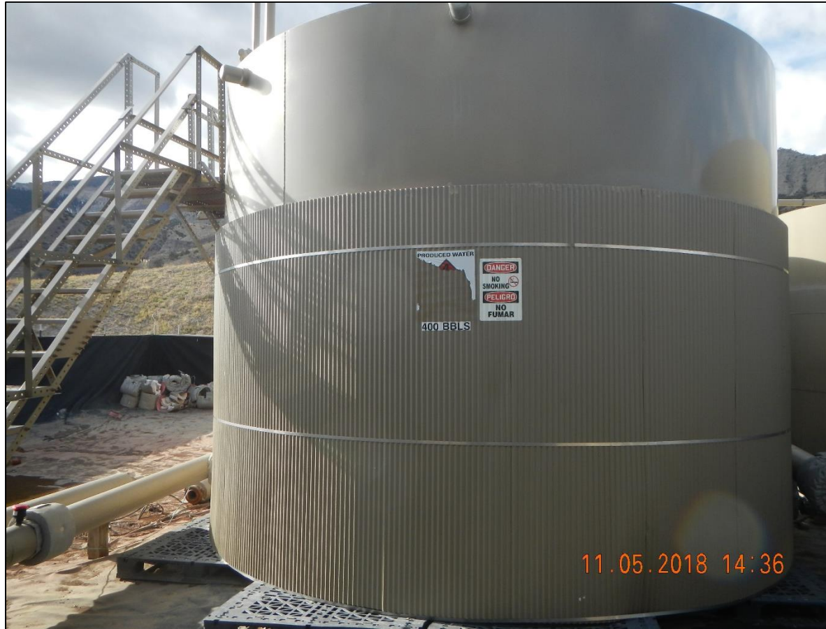
Label in disrepair.