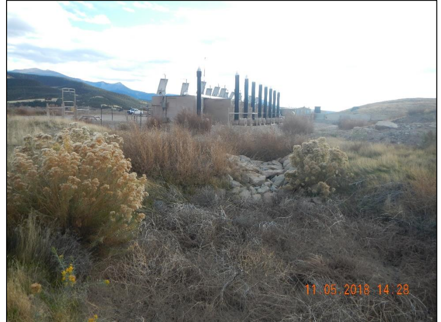
Weeds in check dam