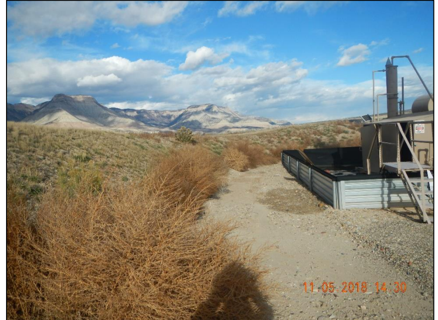
Weeds along perimeter of location.