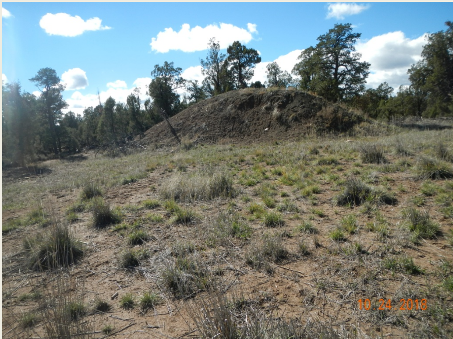
Photo 3. View of the southern project area from the edge of the working area facing southward. Soil is stockpiled here.