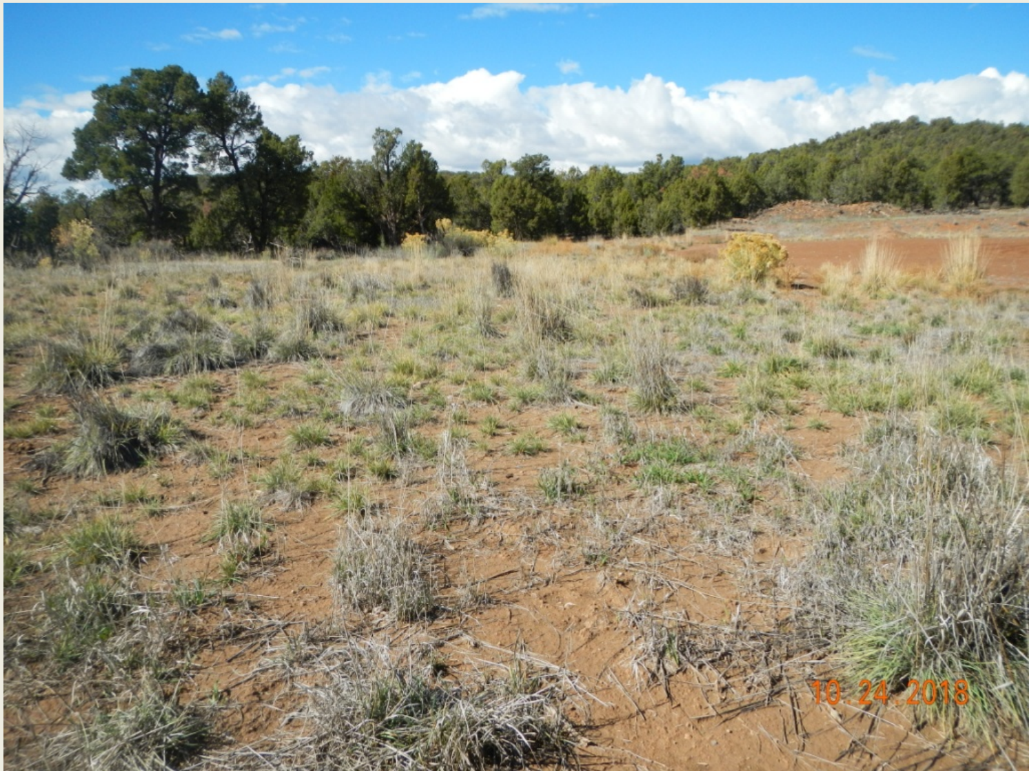
Photo 4. View of the western project area from the southern corner facing northward.