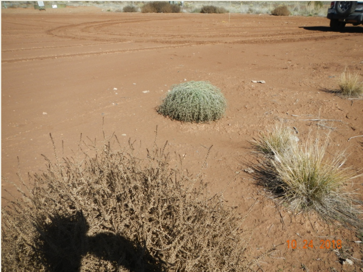
Photo 5. View of Russian thistle ( Salsola tragus ) debris within the project area that is broken off and will blow.