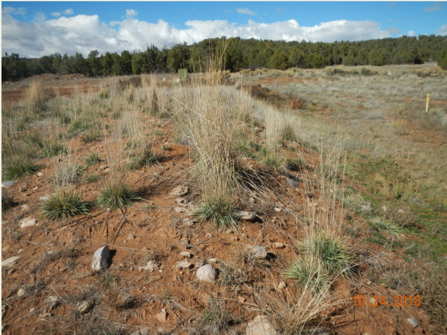
Photo 2. View of the northeastern project area from the eastern corner facing northward. Revegetation is progressing with grasses such as crested wheatgrass ( Agropyron cristatum ), and intermediate wheatgrass ( Thinopyron intermedium ).