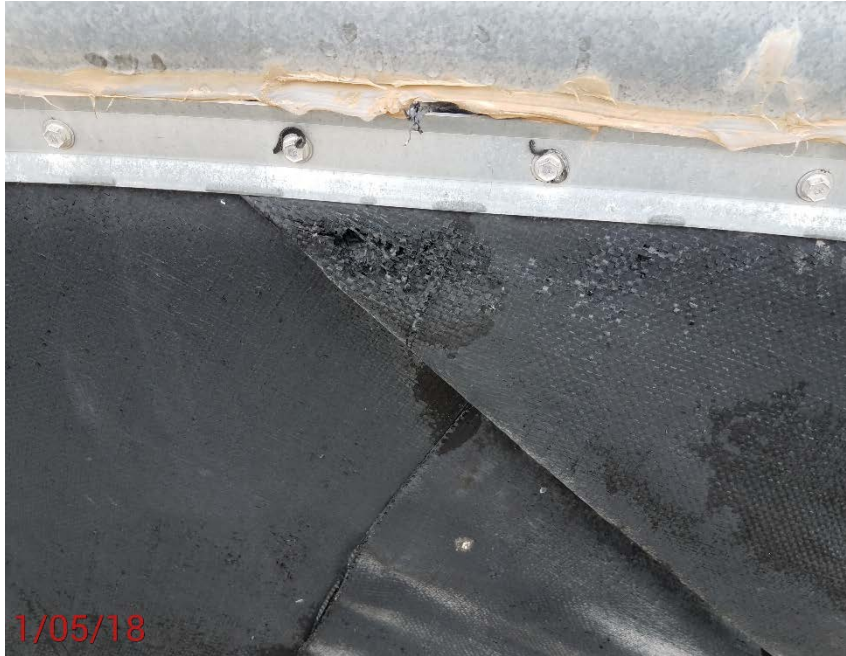
Location Photo #11, holes in secondary containment liner