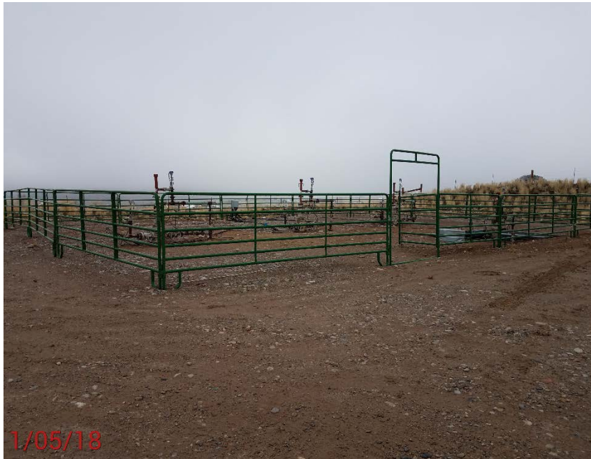
Location Photo #1