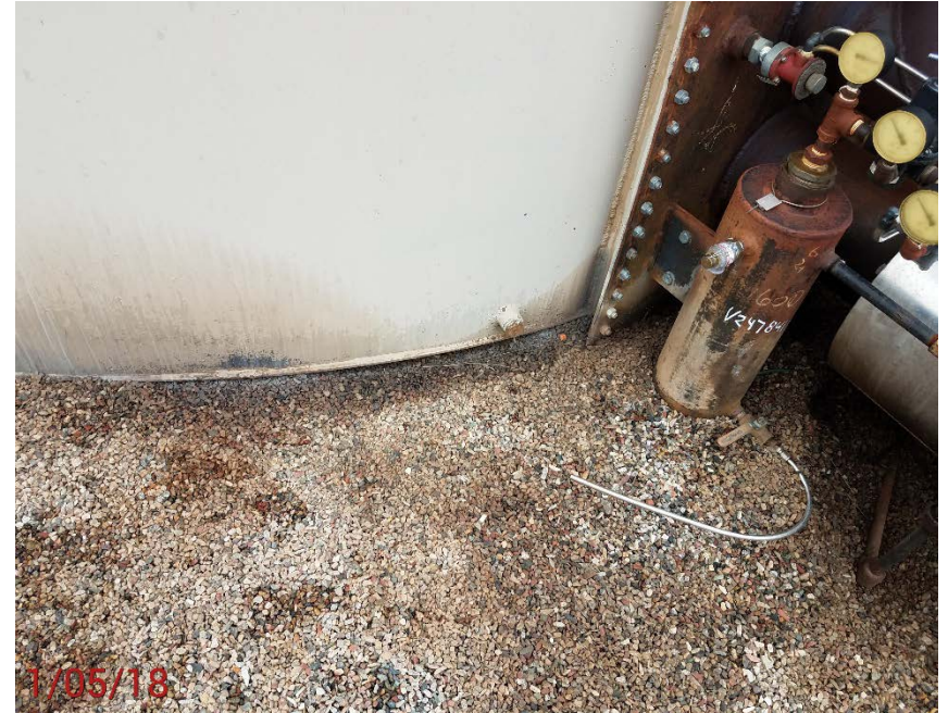
Location Photo #6, oily stained ground