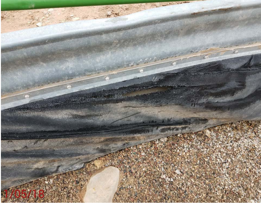
Location Photo #7, holes in secondary containment liner