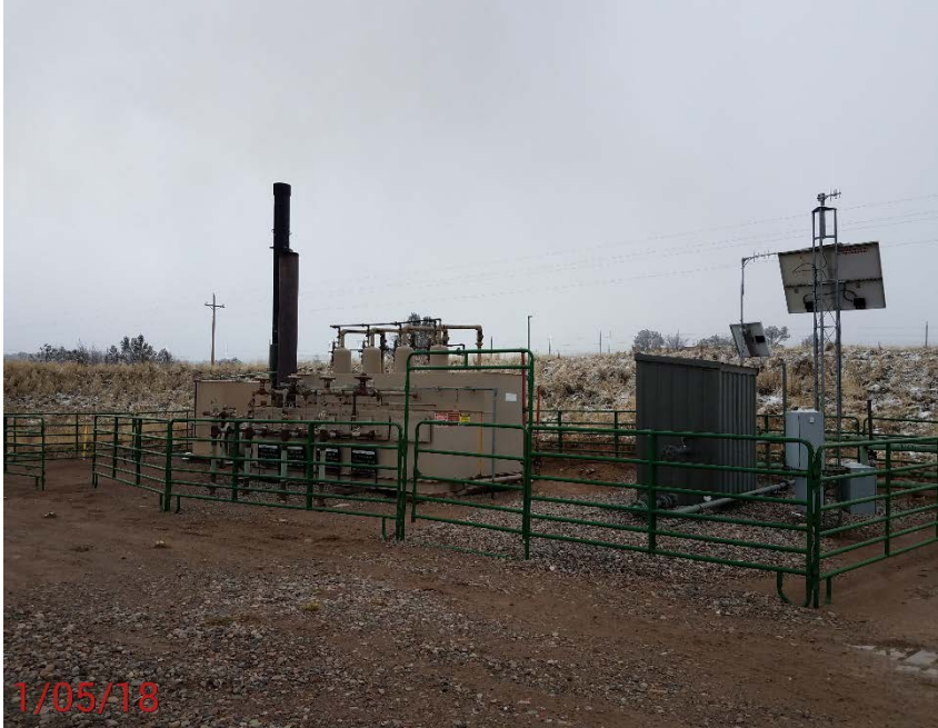
Location Photo #3