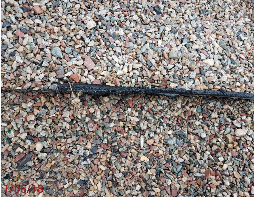
Location Photo #9, holes in secondary containment liner