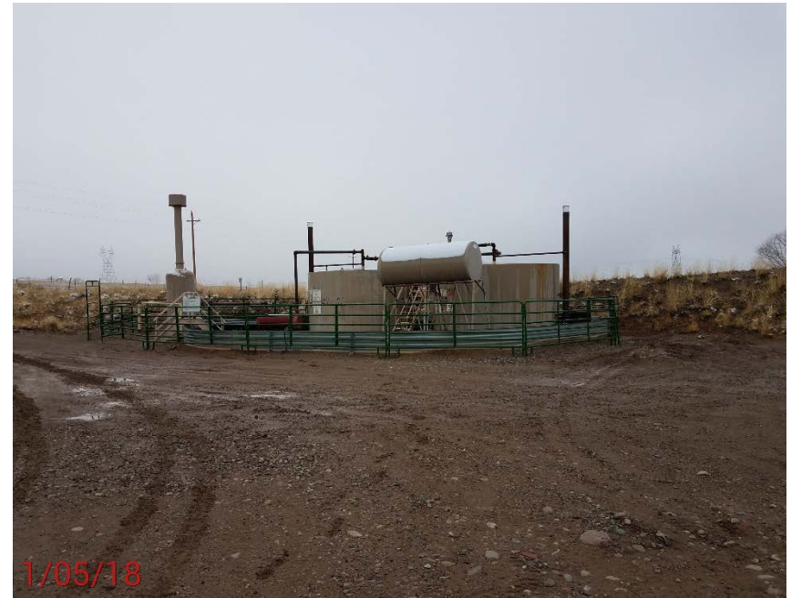
Location Photo #2