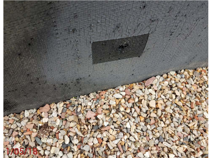
Location Photo #12, holes in secondary containment liner