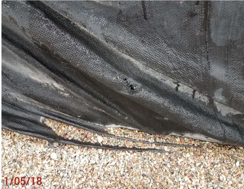
Location Photo #13, holes in secondary containment liner