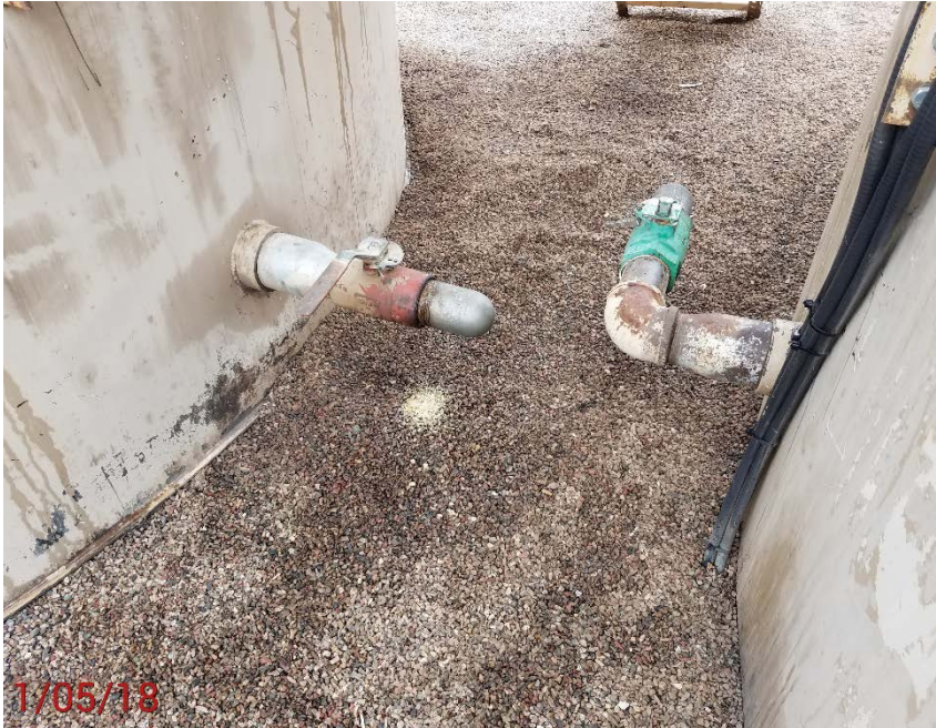
Location Photo #5, mechanical condition on 3" valve, oily stained ground