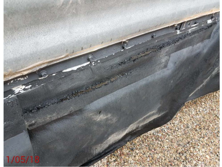
Location Photo #8, holes in secondary containment liner