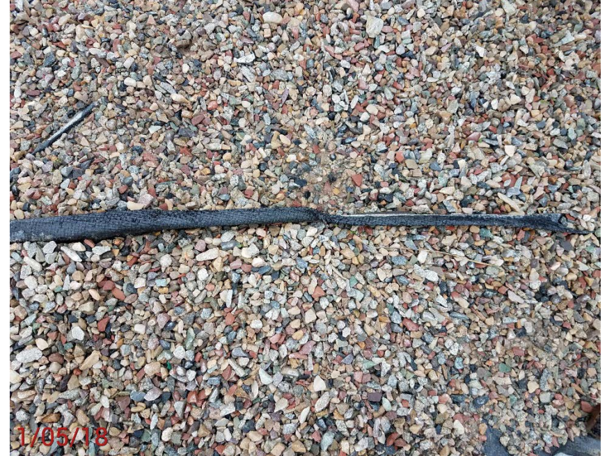
Location Photo #10, holes in secondary containment liner