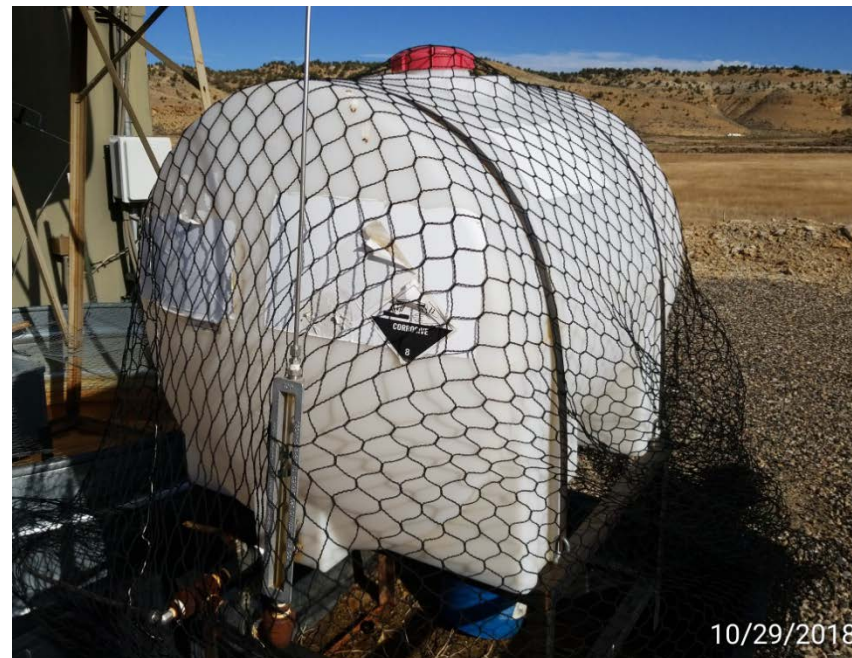
Labels on container next to separators are too faded to read