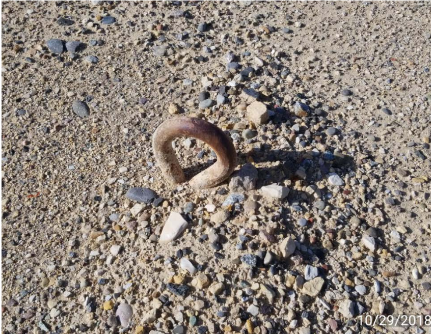
Deadman without marker