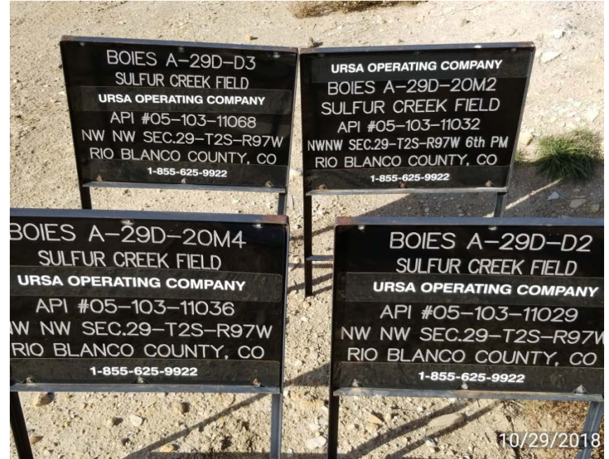
No signs on location have "Public access road CR 29"