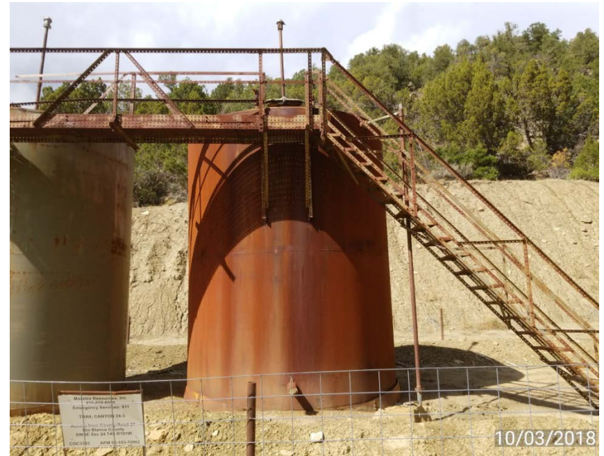
Tank without label