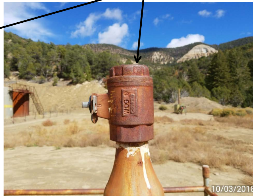
Venting of casing gas