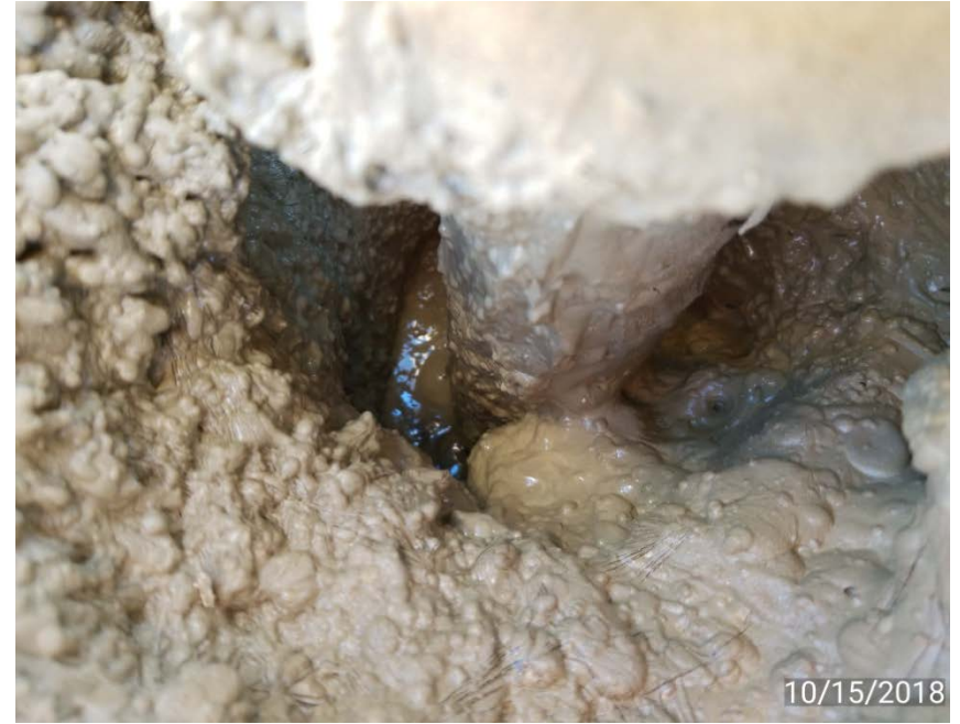
Small leak at well head on line to separator ~10" below ground level.