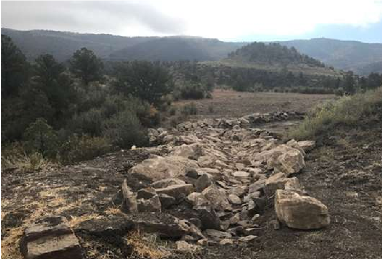
Stormwater controls on the southeast side of the well pad. The armor was reset to direct stormwater run-off to the armored outfall.

APACHE CANYON 03-11 API# 05-071-09629 – TIMBER CREEK OGCC OPERATOR NUMBER 10672 - DATE: OCTOBER 5, 2018 # 5 CORRECTIVE ACTIONS COMPLETED REGARDING COGCC FIR DOCUMENT # 682600545