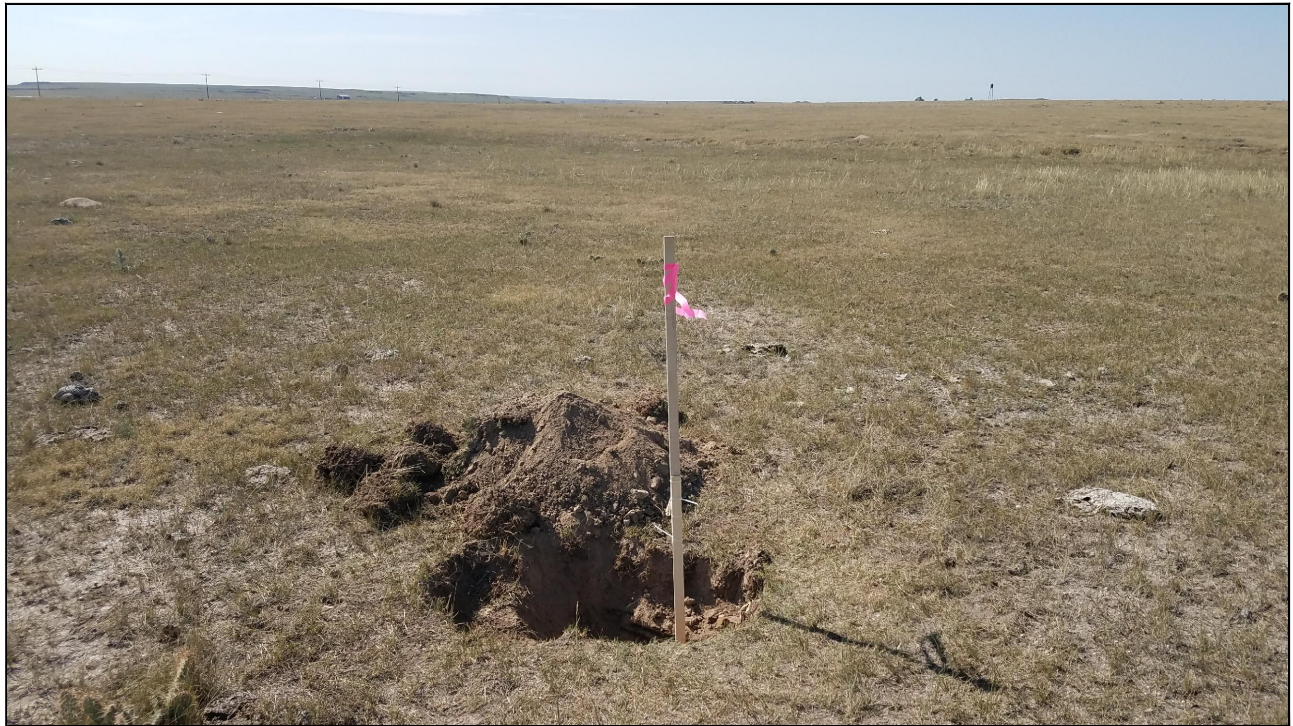
PHOTO: VIEW OF AS-DRILLED LOCATION