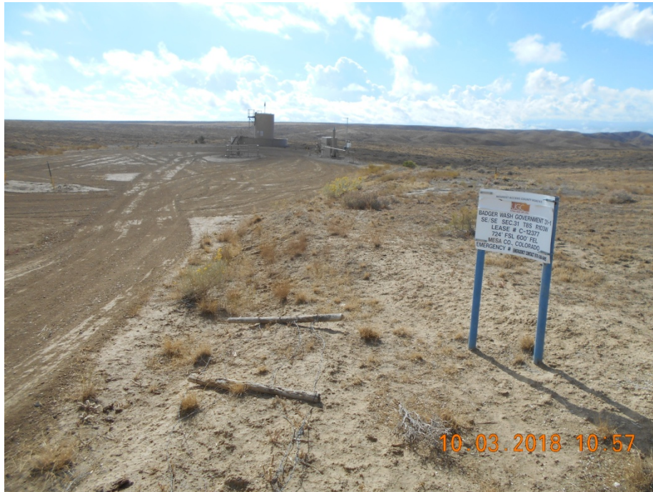
Location overview looking SE