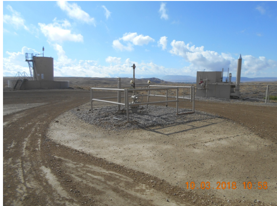
Wellhead, Separator and Tank battery