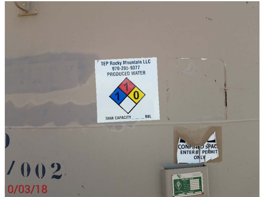
Location Photo #12, missing tank volume.