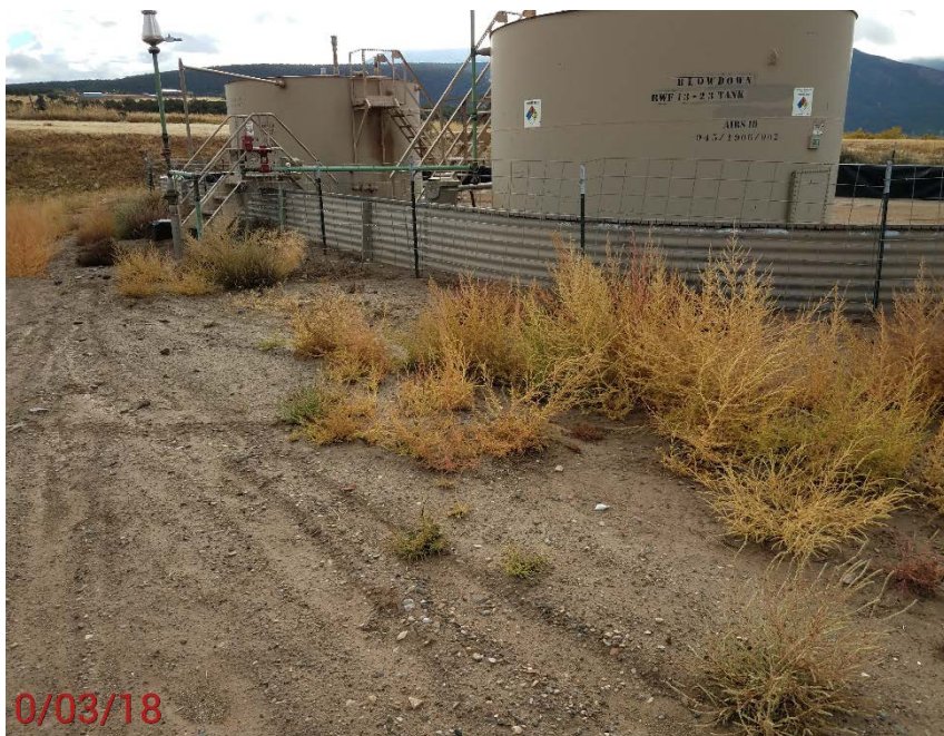
Location Photo #3,