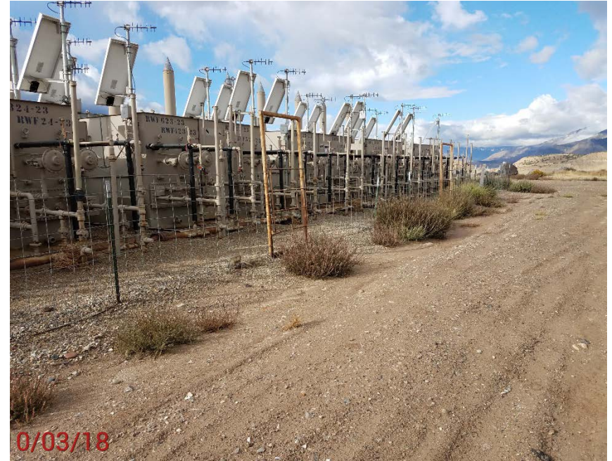
Location Photo #2,