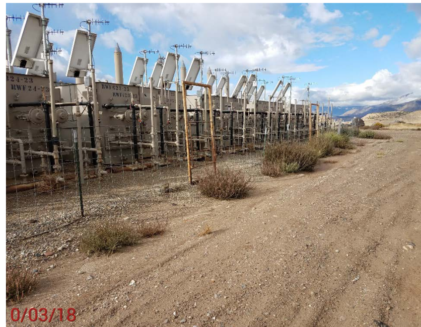
Location Photo #10, uncontrolled weeds.