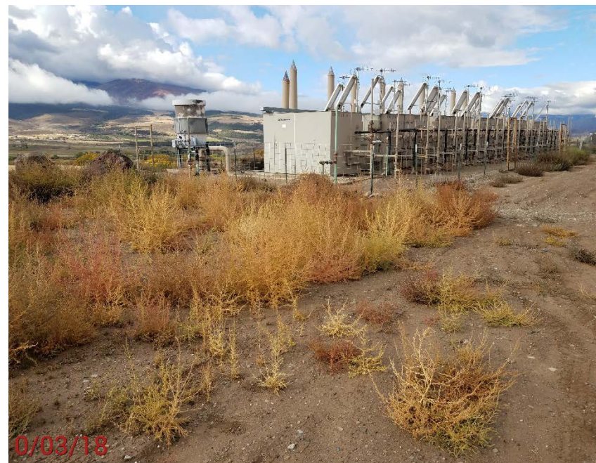
Location Photo #6, uncontrolled weeds near separators.