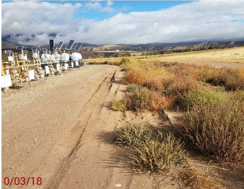
Location Photo #1,