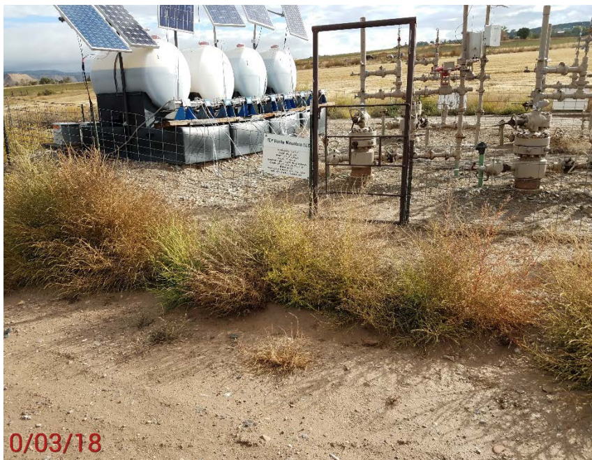
Location Photo #5, uncontrolled weeds on location.