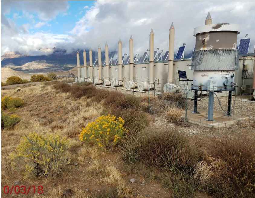
Location Photo #7, uncontrolled weeds near separators.