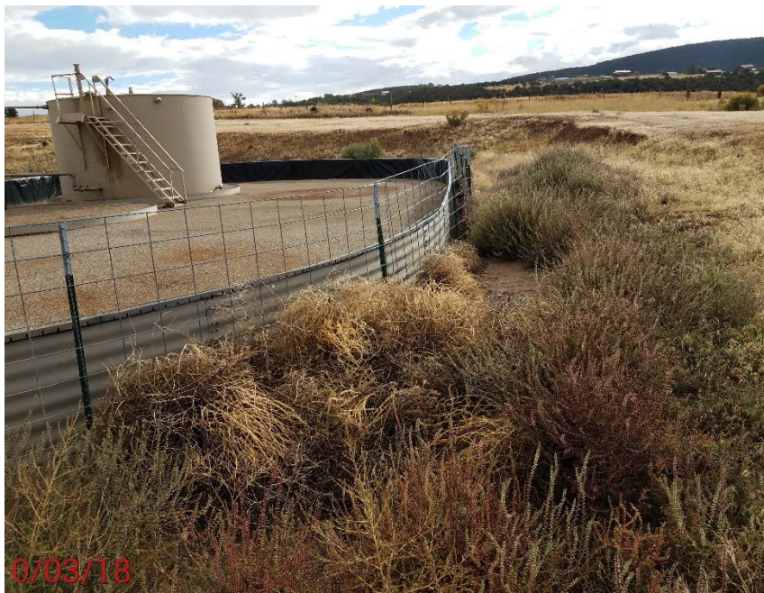
Location Photo #9, uncontrolled weeds near tank battery.