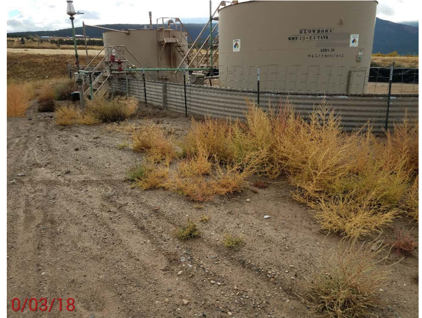
Location Photo #8, uncontrolled weeds near tank battery.