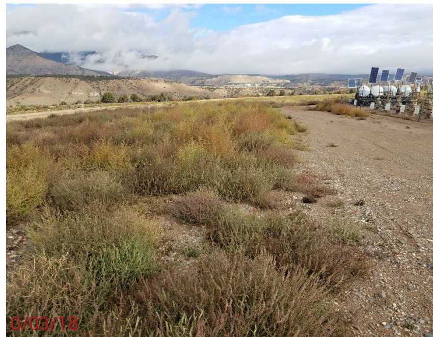
Location Photo #4 uncontrolled weeds on location.