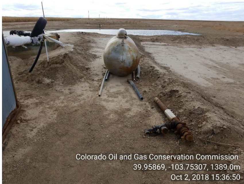
Photo 7 Unused equipment outside of sep