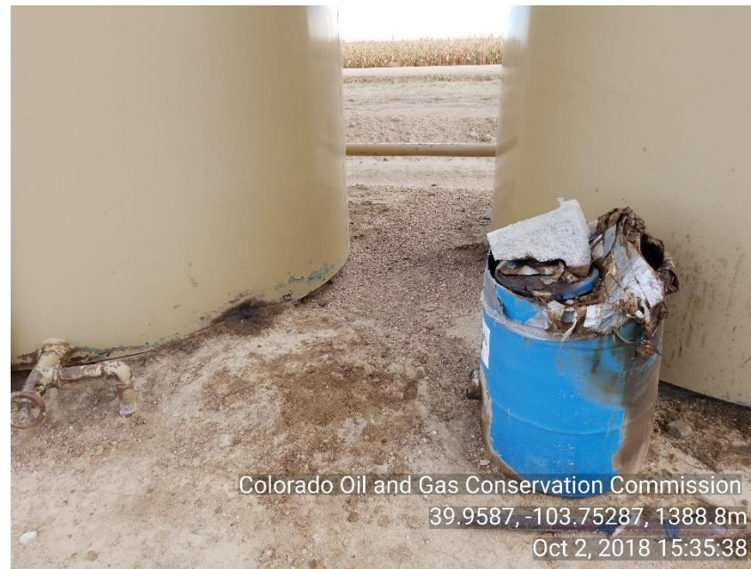
Photo 6 Stained soil and trash around crude oil tank