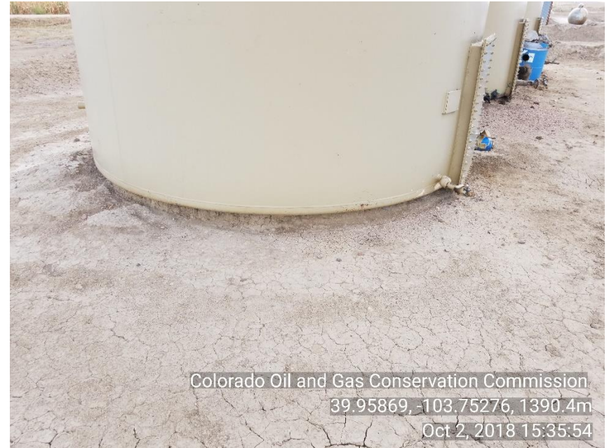
Photo 4 Erosion under 300BBL oil tank