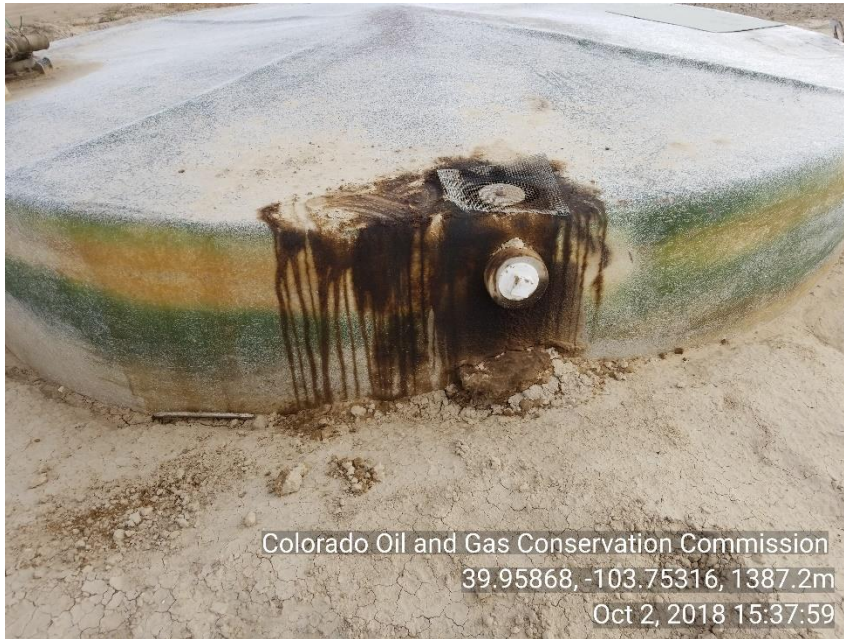
Photo 9 stained soil improper tank lid