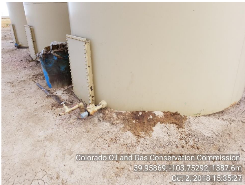
Photo 5 Stained soil and trash around crude oil tank