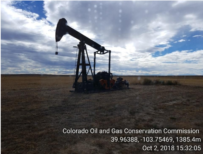
Photo 3 Unused PU