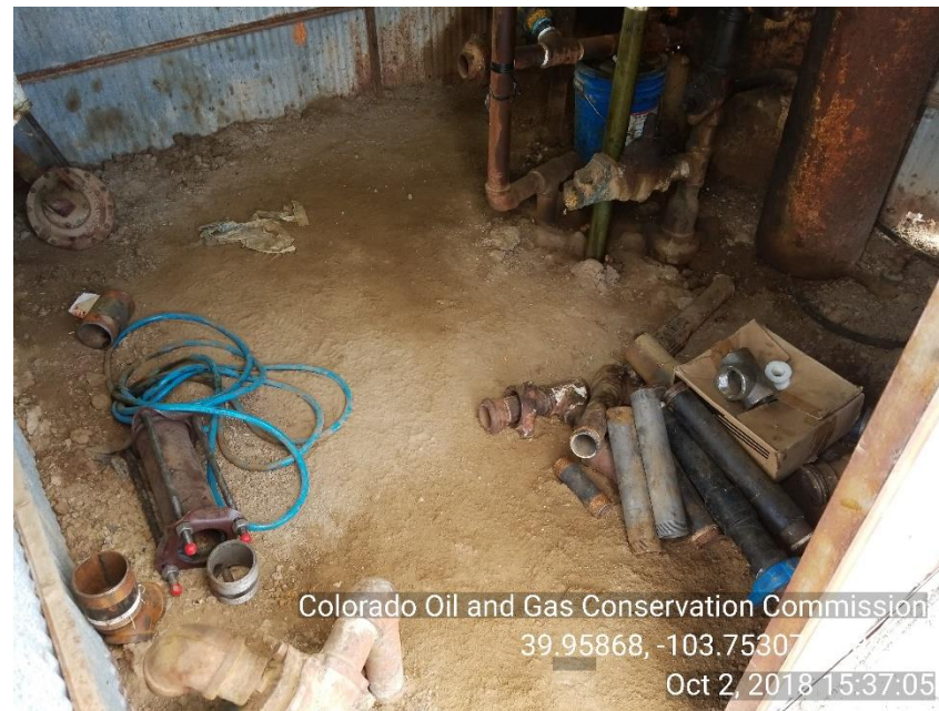
Photo 8 unused equipment and trash inside sep