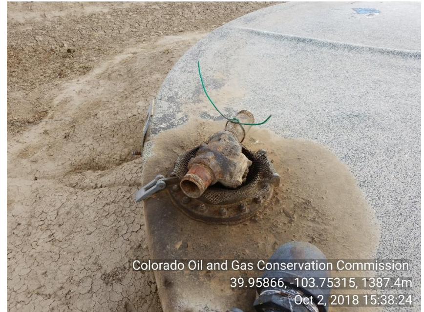
Photo 10 improper lid