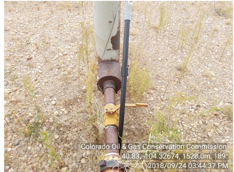
Photo #16 Smuggler 16-10-62 Candlestick Flare Flare inlet - Closed