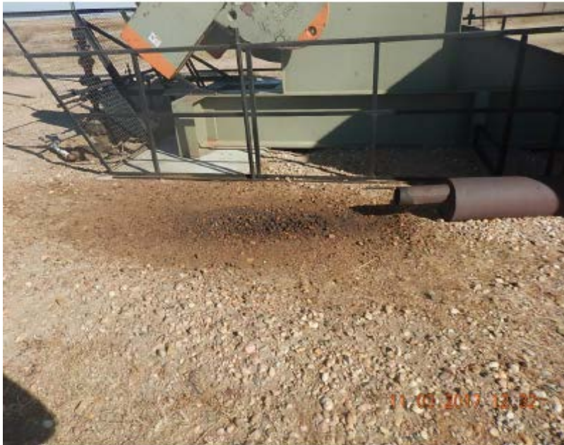
Photo #5 Smuggler 16-10-62 engine exhaust Stained soil From previous FIR