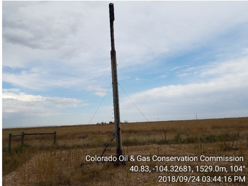
Photo #15 Smuggler 16-10-62 Candlestick Flare Not in operation Not flaring or venting