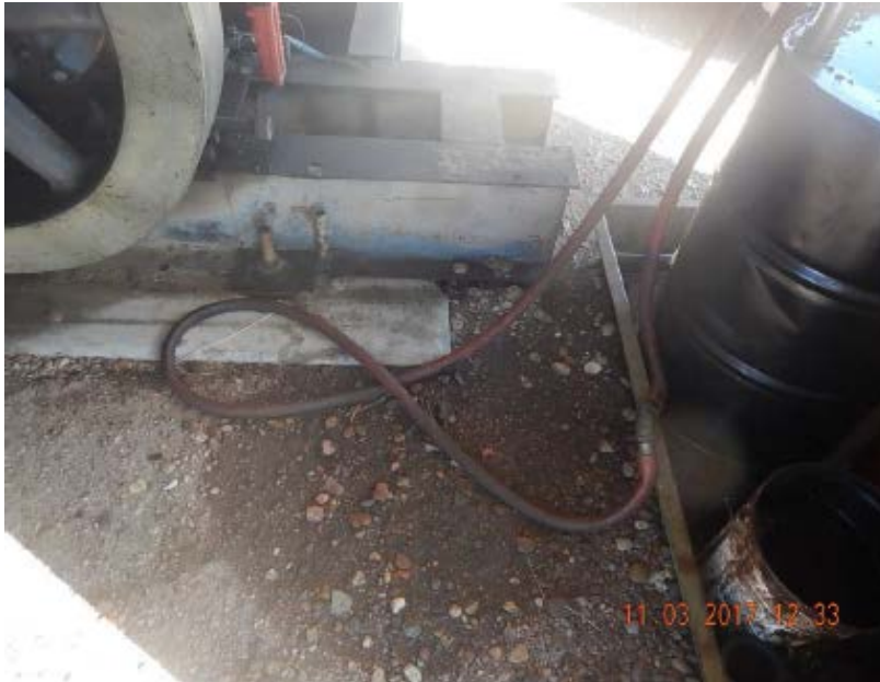
Photo #3 Smuggler 16-10-62 gas engine Stained soil From previous FIR