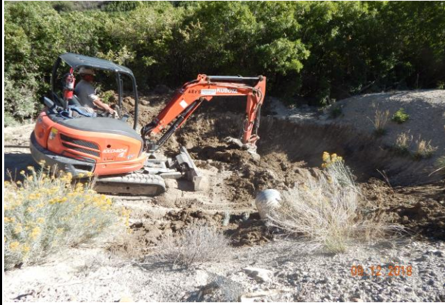
BMP Maintenance on the Shell 797-03B Access Rd