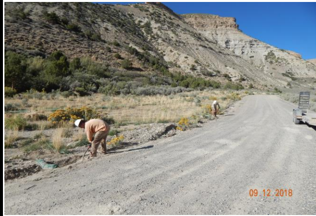
BMP Maintenance on the Shell 797-03B Access Rd