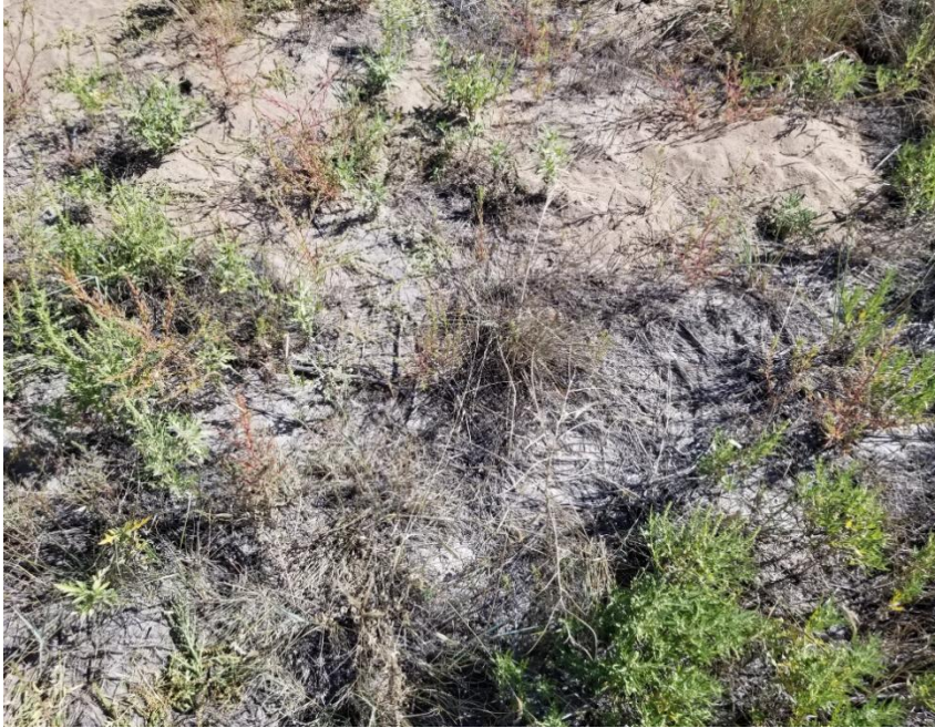
Photo 7. Stressed vegetation due to impacted soils to south of location