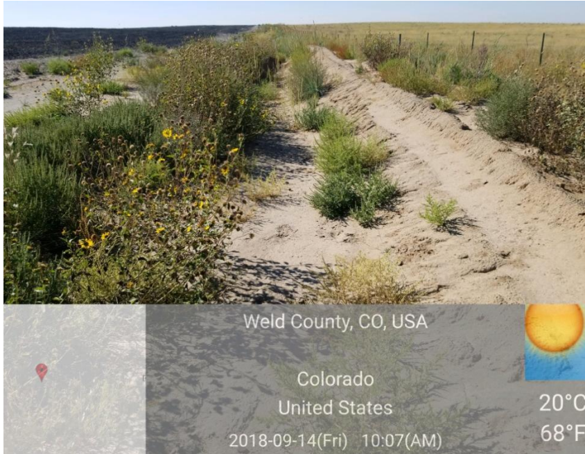
Photo 3. Perimeter ditch full of sediment and weeds on west side of location