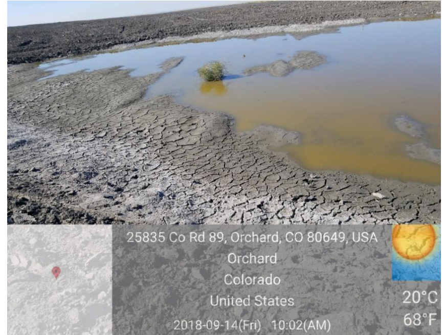
Photo 2. Stormwater ponding on location