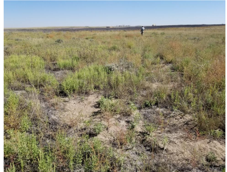
Photo 6. Impacted sediment from 6/28/2018 spill approximately 200' south of location