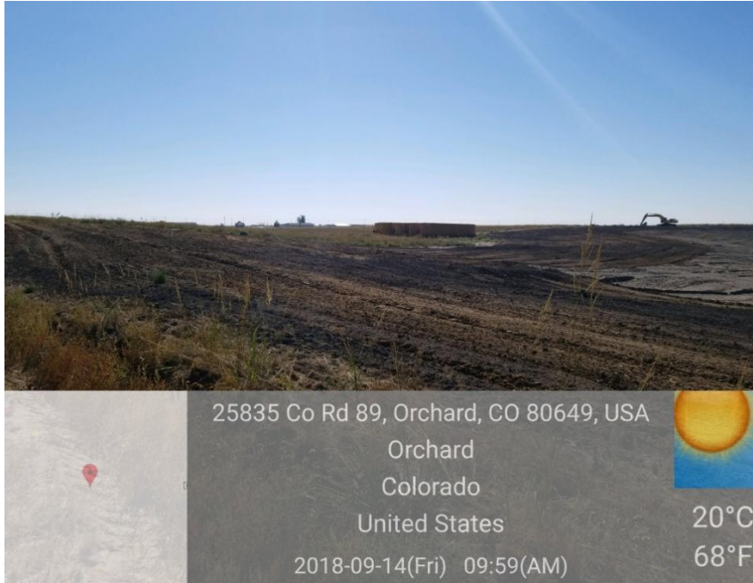
Photo 1. Active spreadfield