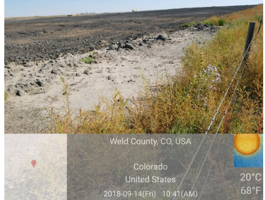
Photo 8. Sediment filled perimeter berm on west side of location