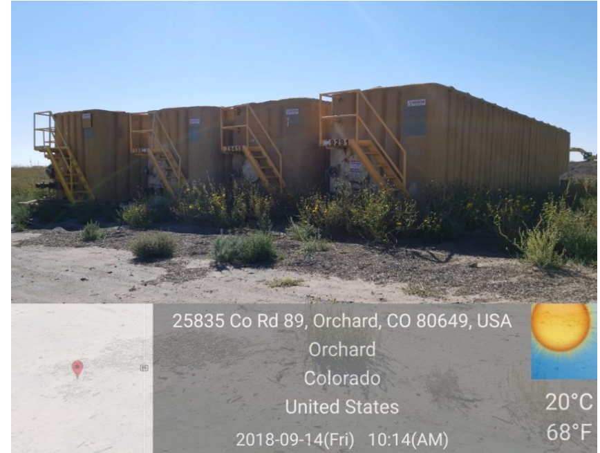
Photo 4. Unused frac tanks stored on location