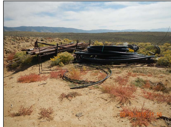
Photo 4. Equipment stored on location.