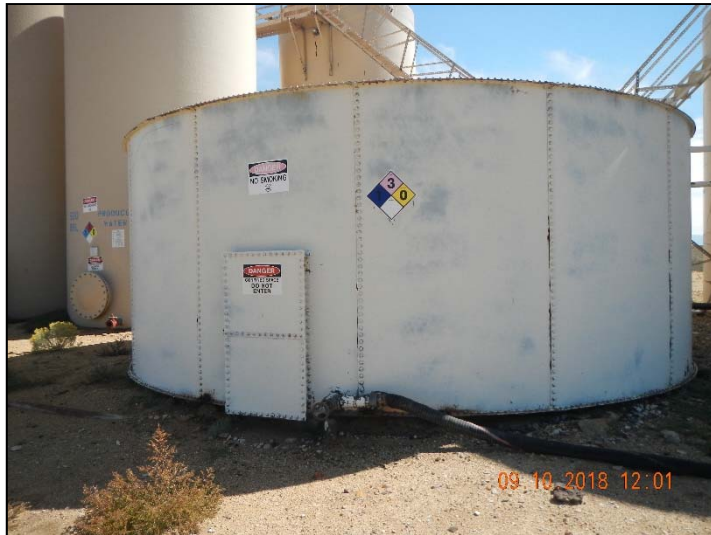
Photo 13. Incomplete tank label.