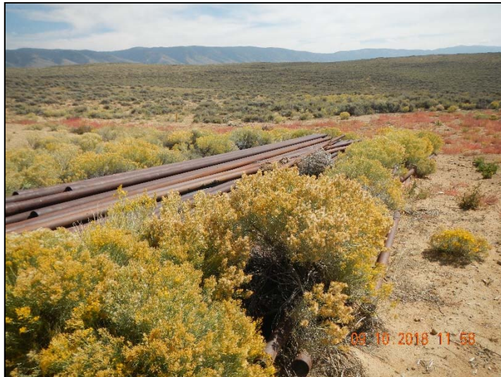
Photo 5. Equipment stored on location.