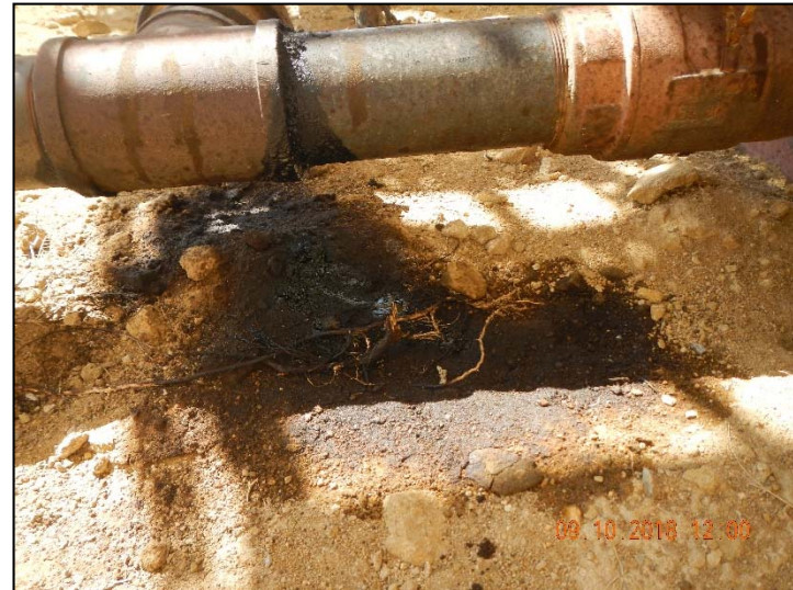
Photo 10. Close-up of stained soil.