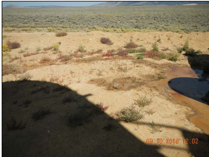
Photo 15. Path of methanol spill.