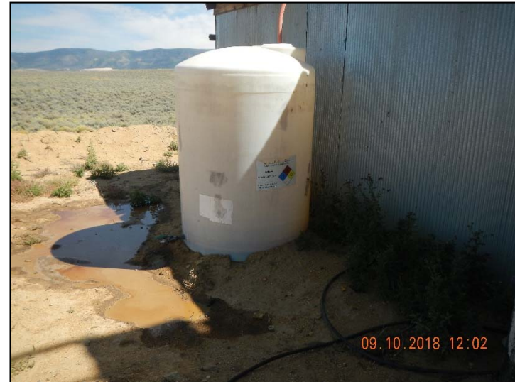
Photo 14. Apparent Methanol spill.