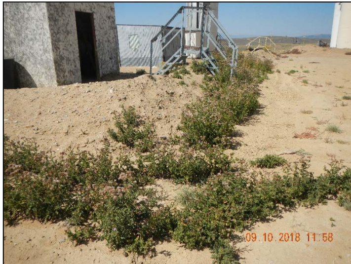
Photo 7. Noxious weeds on location.