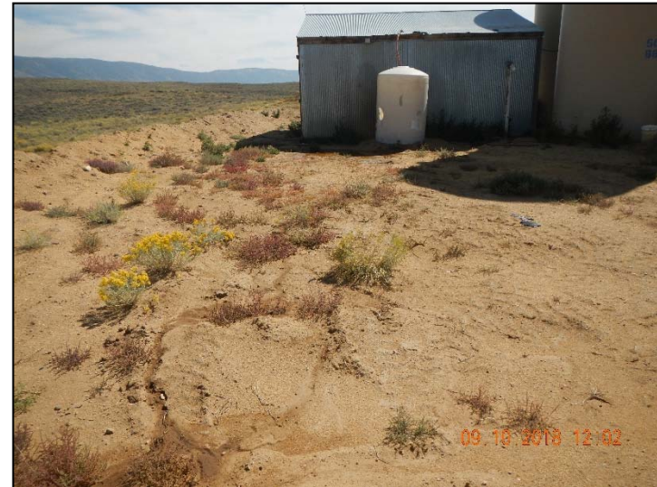
Photo 16. Terminus of methanol spill pathway looking towards container.