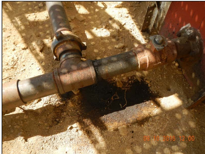
Photo 9. Stained soil at tank connection.