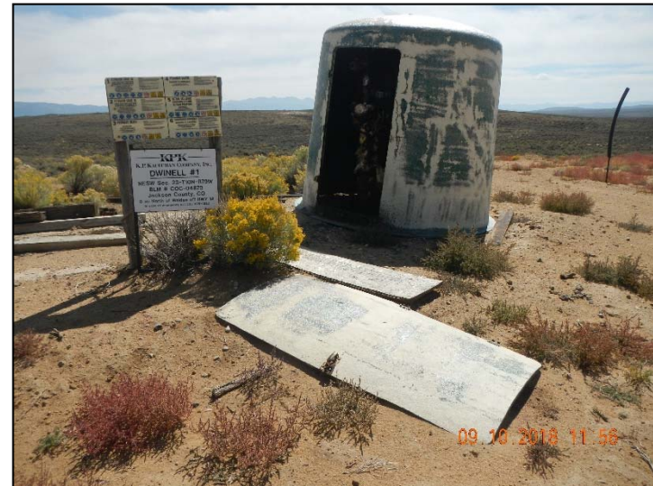
Photo 8. Annual weeds on location, wellhead housing door.