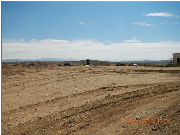
Photo 1. Overview of location taken at entrance facing southeast.