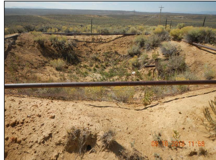
Photo 2. Pit.