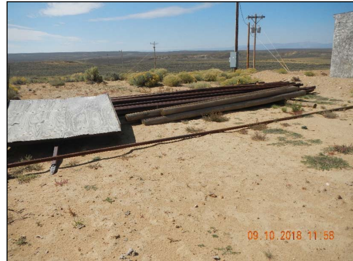
Photo 6. Equipment stored on location.