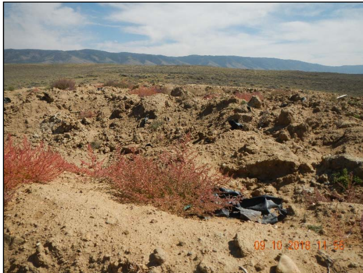
Photo 3. Land farm area.