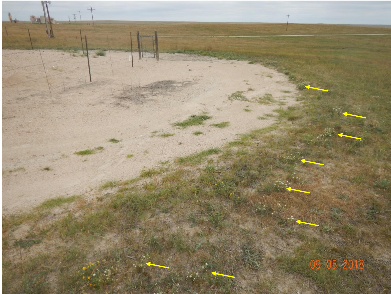
Photo 12: Photo taken from the south end of the location, facing northeast. Photo shows Diffuse Knapweed has not been sufficiently managed or removed from location.