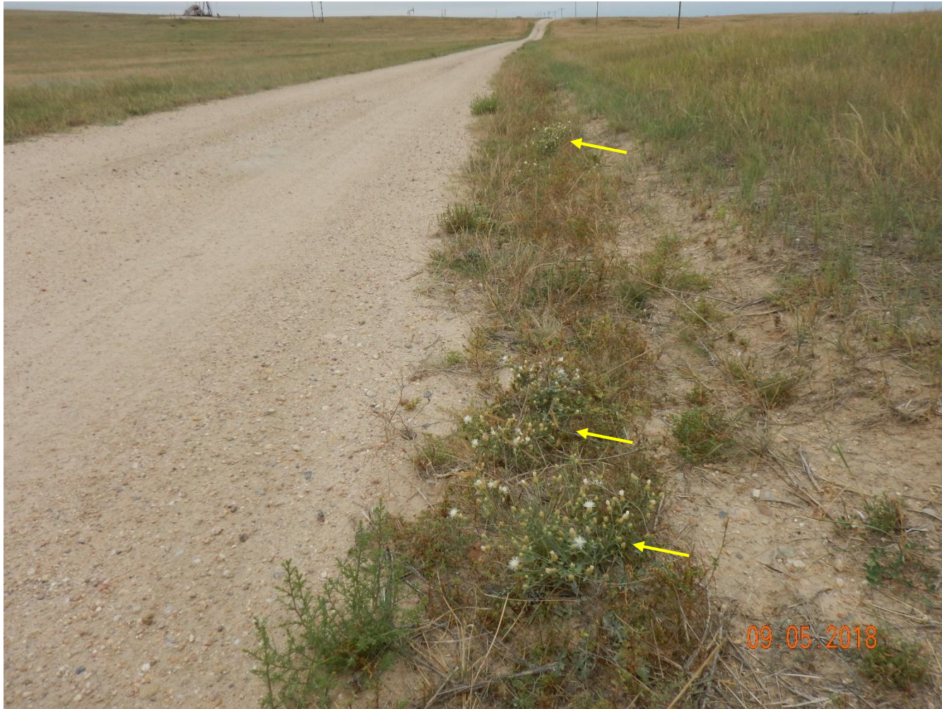
Photo 5: Photo taken from the access road, facing west. Photo shows Diffuse Knapweed has not been sufficiently managed or removed from access road.