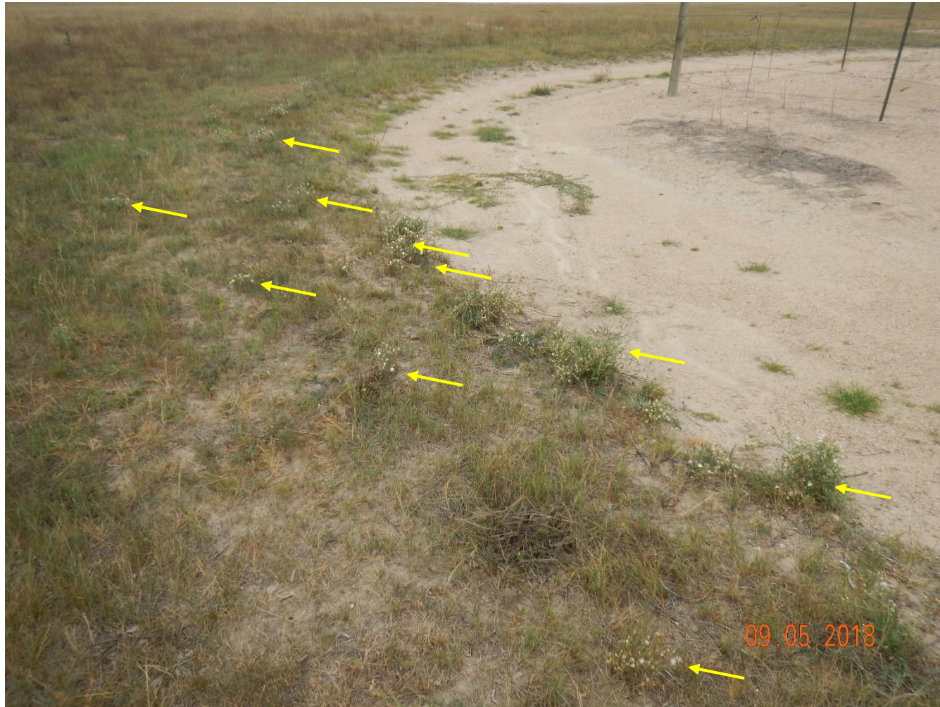
Photo 11: Photo taken from the southeast end of the location, facing southwest. Photo shows Diffuse Knapweed has not been sufficiently managed or removed from location.