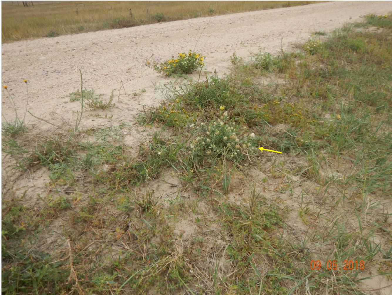
Photo 3: Photo taken from the access road. Photo shows Diffuse Knapweed has not been sufficiently managed or removed from access road.