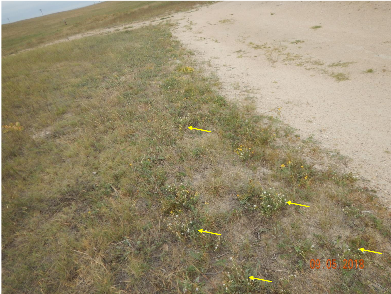
Photo 13: Photo taken from the west end of the location, facing northeast. Photo shows Diffuse Knapweed has not been sufficiently managed or removed from location.