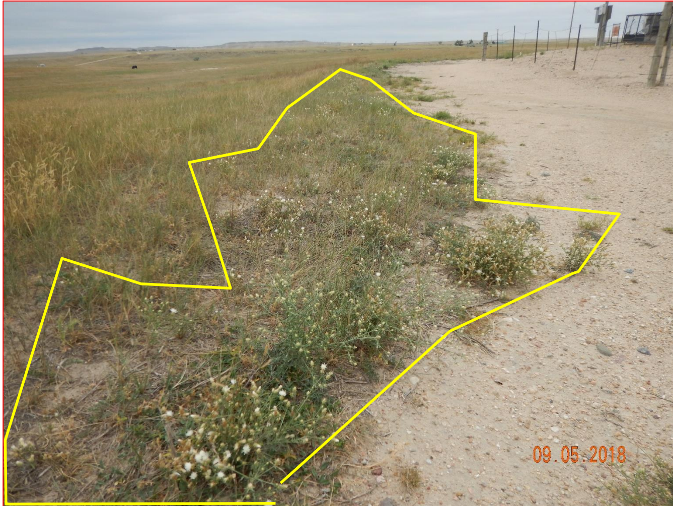
Photo 9: Photo taken from the north end of the location, facing southeast. Photo shows Diffuse Knapweed has not been sufficiently managed or removed from location.