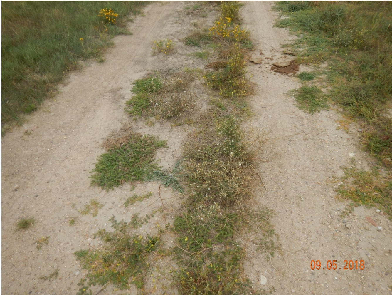
Photo 14: Photo taken from the north end of the location. Photo shows Diffuse Knapweed has not been sufficiently managed or removed from access road.