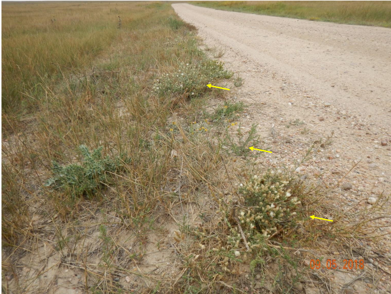
Photo 4: Photo taken from the access road. Photo shows Diffuse Knapweed has not been sufficiently managed or removed from access road.