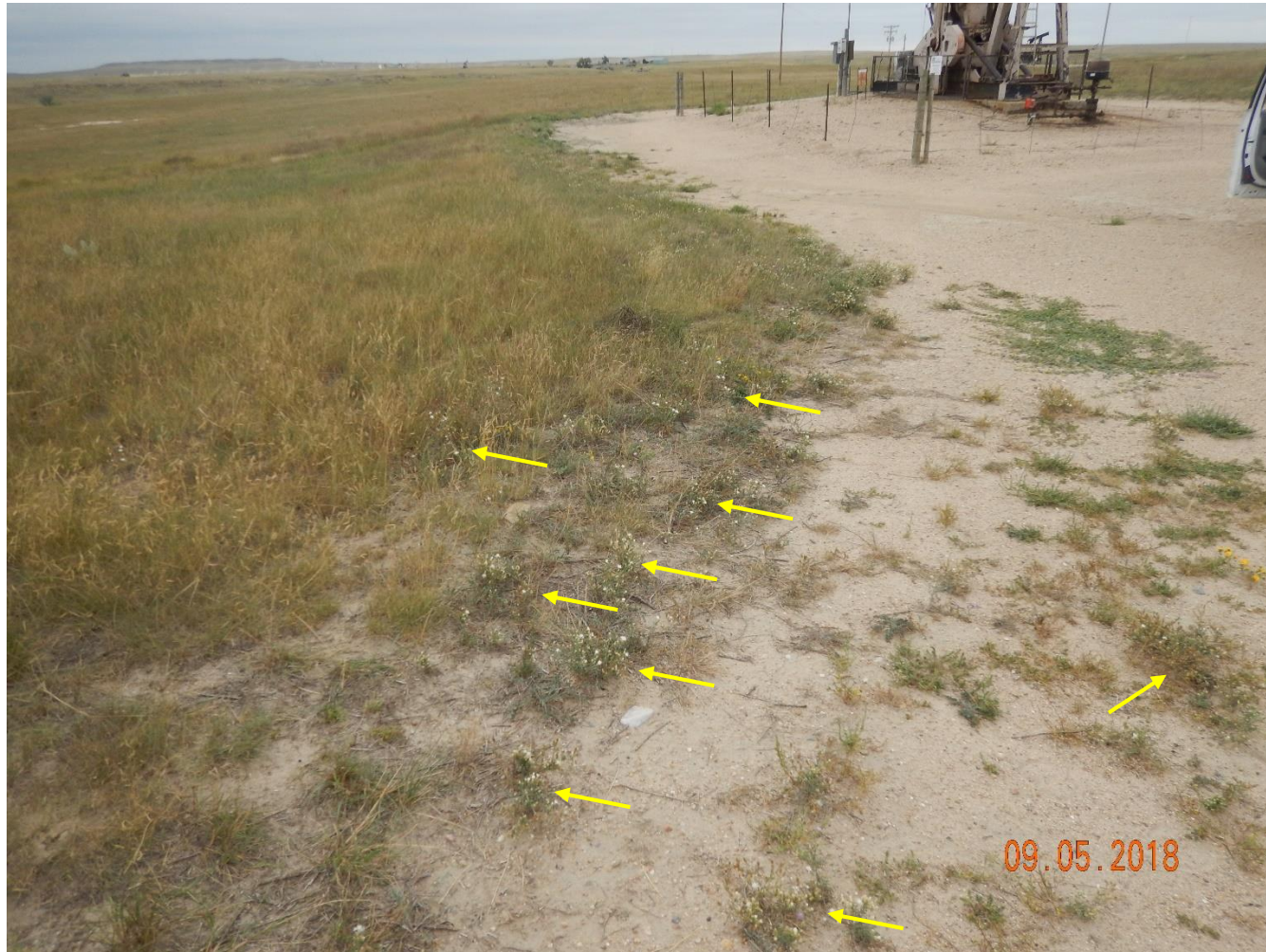
Photo 8: Photo taken from the north end of the location, facing southeast. Photo shows Diffuse Knapweed has not been sufficiently managed or removed from location.