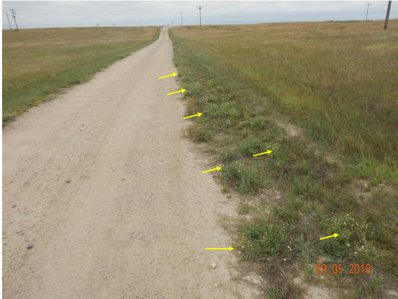
Photo 7: Photo taken from the access road facing west. Photo shows Diffuse Knapweed has not been sufficiently managed or removed from access road.