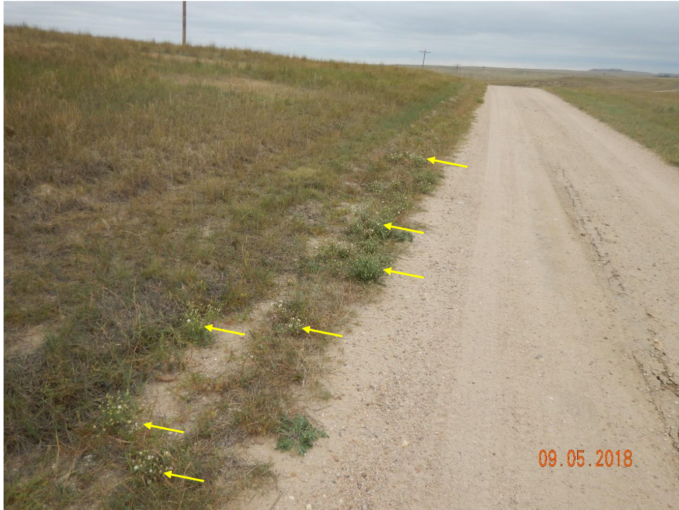
Photo 6: Photo taken from the access road facing east. Photo shows Diffuse Knapweed has not been sufficiently managed or removed from access road.