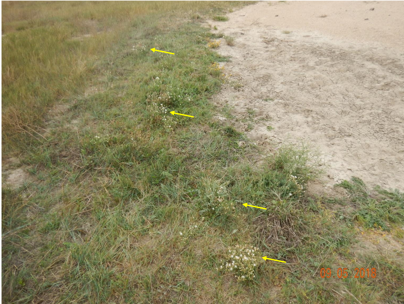
Photo 10: Photo taken from the south end of the location, facing southwest. Photo shows Diffuse Knapweed has not been sufficiently managed or removed from location.