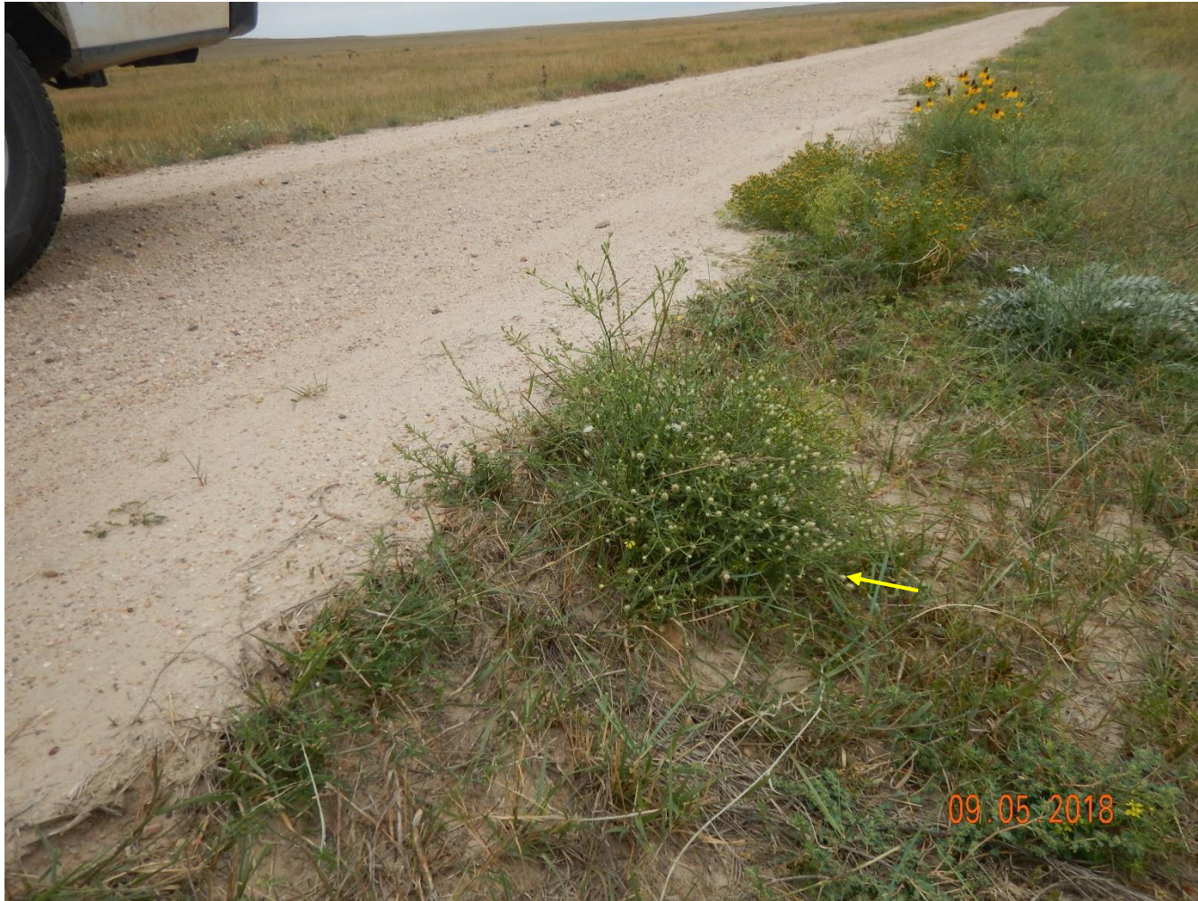
Photo 2: Photo taken from the access road. Photo shows Diffuse Knapweed has not been sufficiently managed or removed from access road.