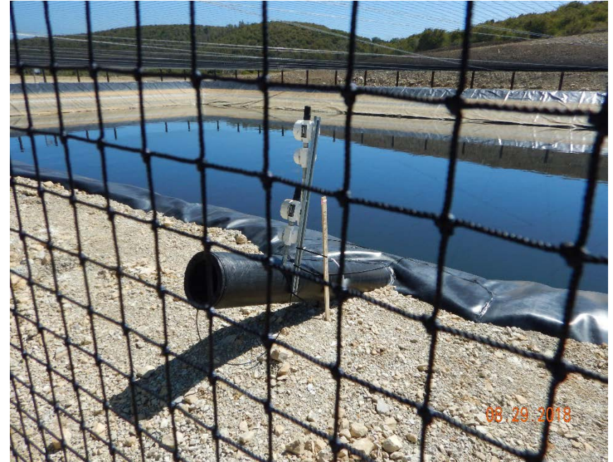
Photo #2 – Electronic leak detection system visible on west side of pit.