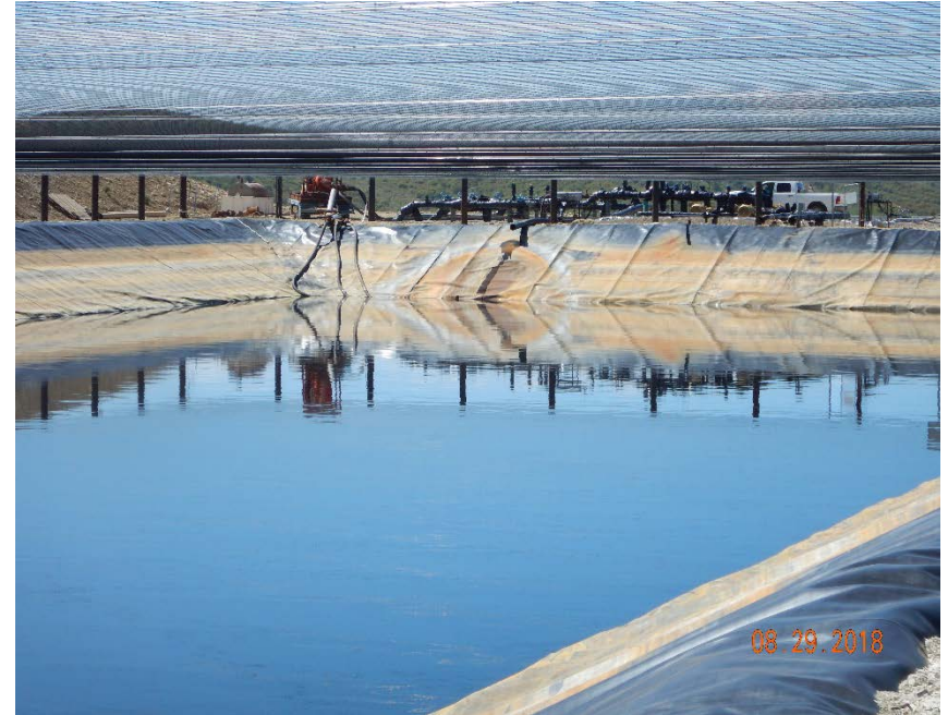
Photo #4 – Hoses in SE corner of pit were in direct contact with liner on inspection date.