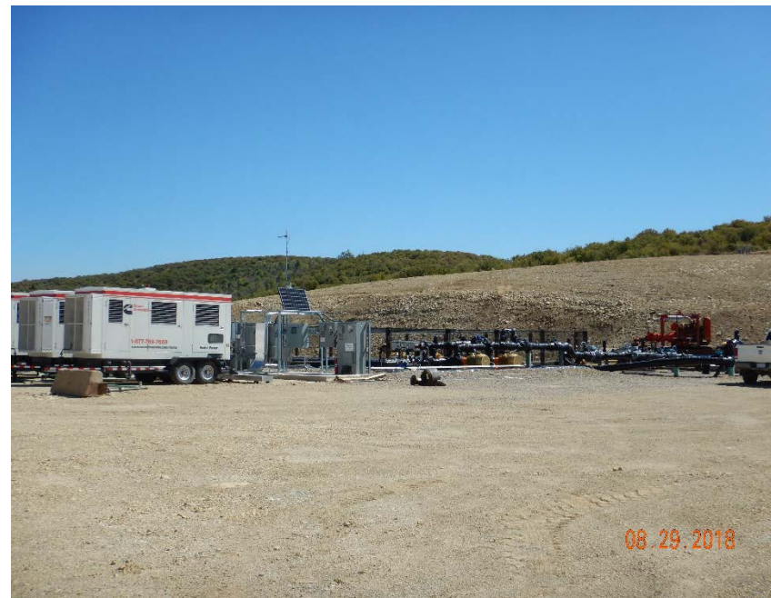
Photo #10 – View of flowline manifold with generators located south of pit.