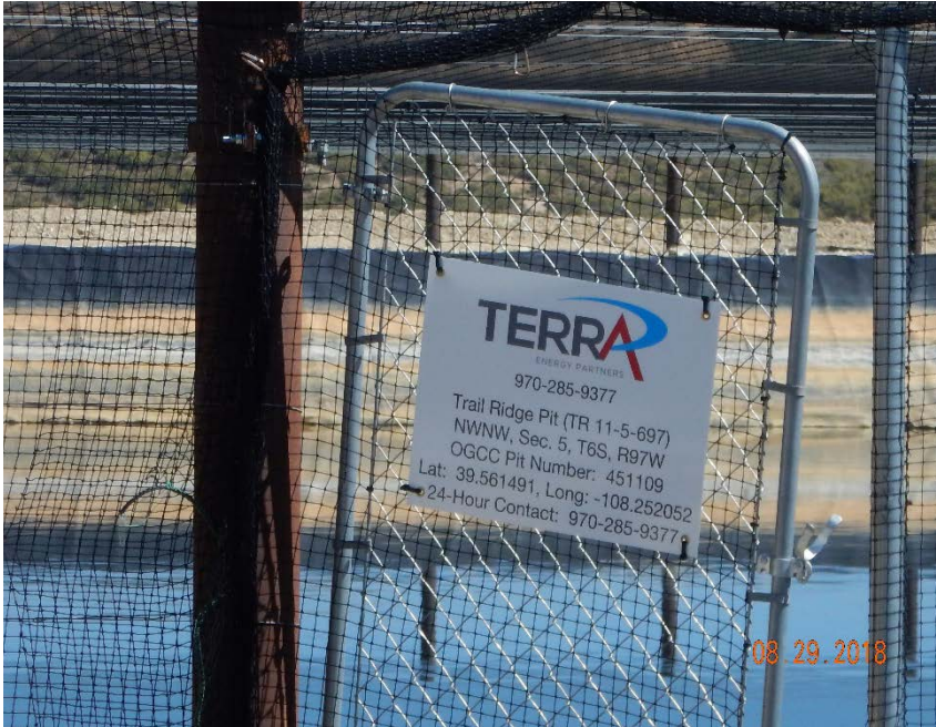
Photo #1 - Sign affixed to gate on south side of pit. Gate was open on inspection date to allow access for pressure testing.