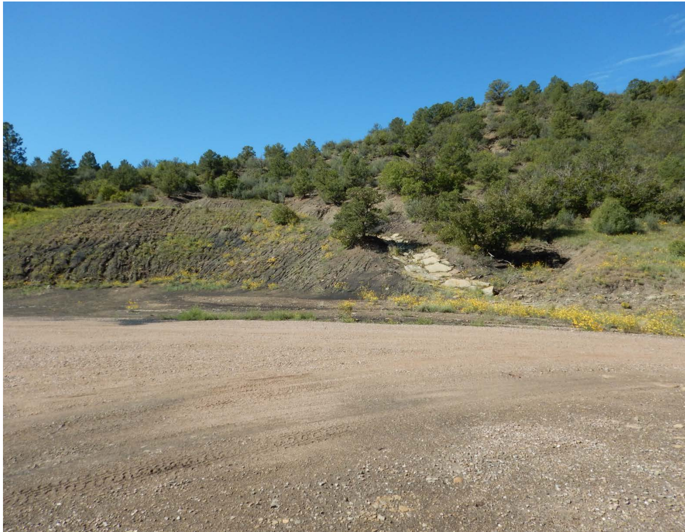
Stormwater controls on west side of well pad.

Location Name: Apache Canyon 03-11 API: 071-09629 Inspection Date: 9/7/2018