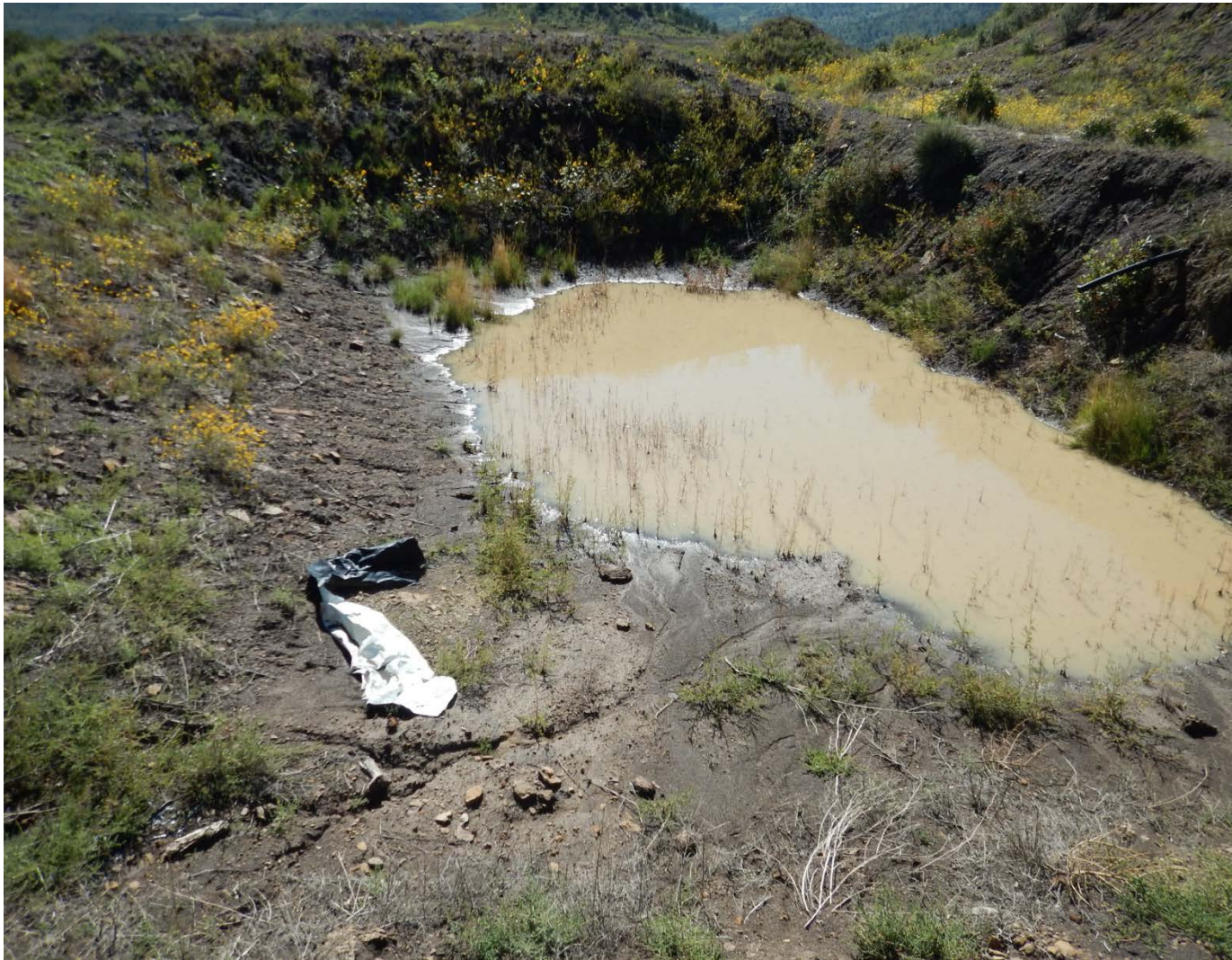
Trash in pit.

Location Name: Apache Canyon 03-11 API: 071-09629 Inspection Date: 9/7/2018