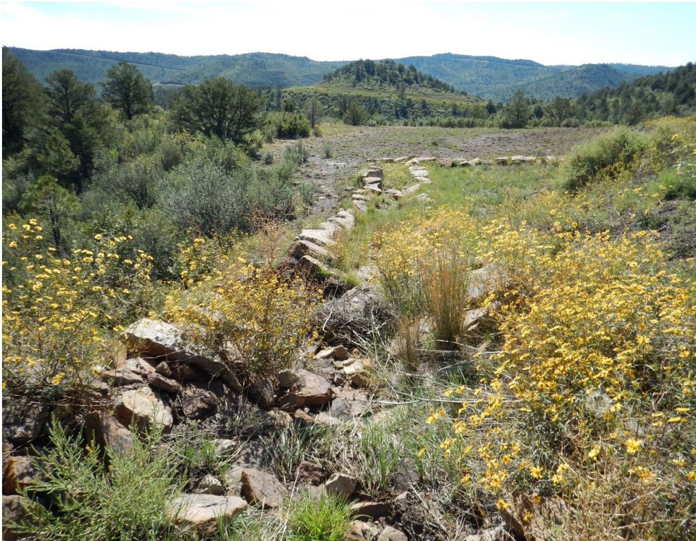
Stormwater controls on northeast side of well pad

Location Name: Apache Canyon 03-11 API: 071-09629 Inspection Date: 9/7/2018