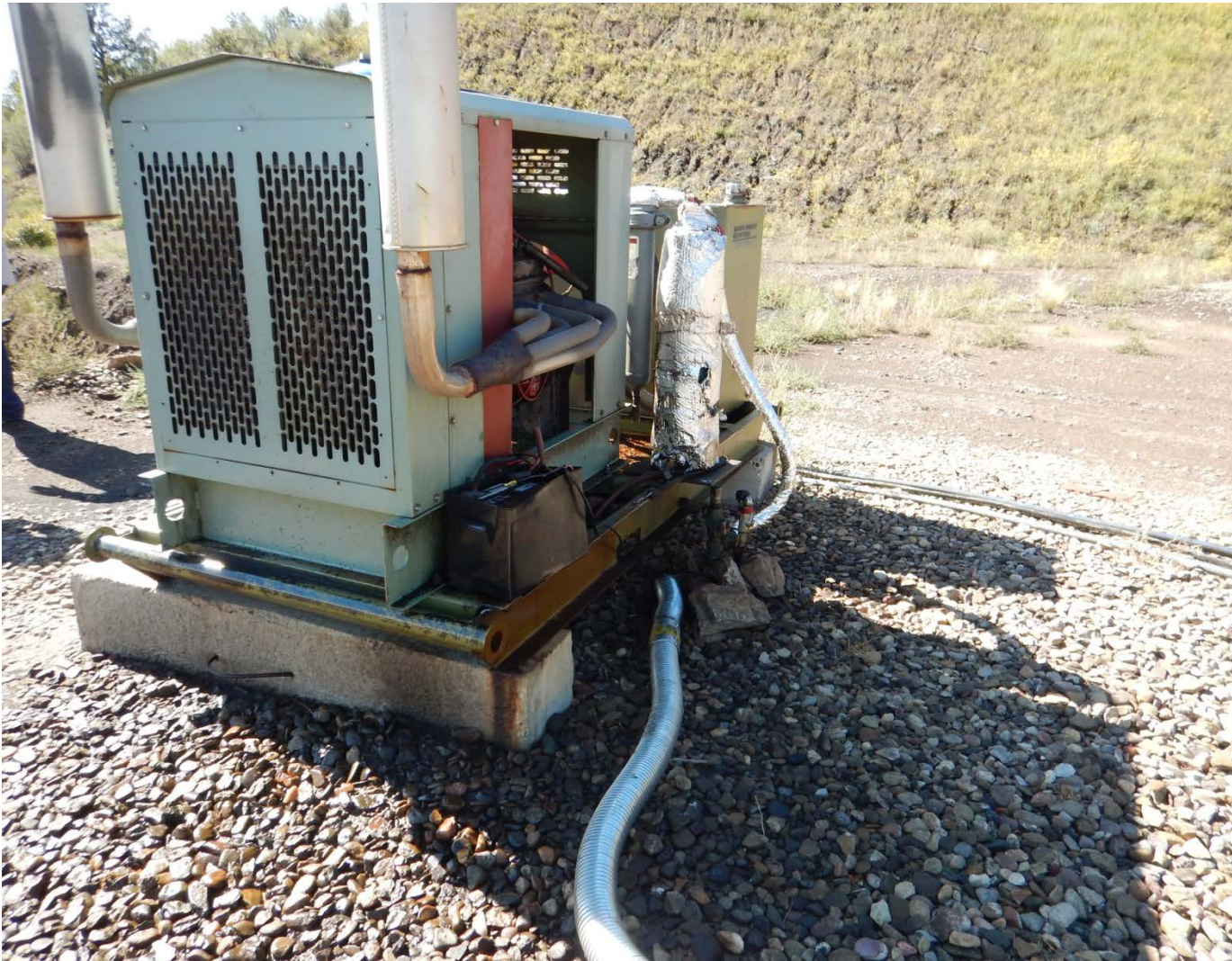
Motor leaking oil into containment pan below motor.

Location Name: Apache Canyon 03-11 API: 071-09629 Inspection Date: 9/7/2018