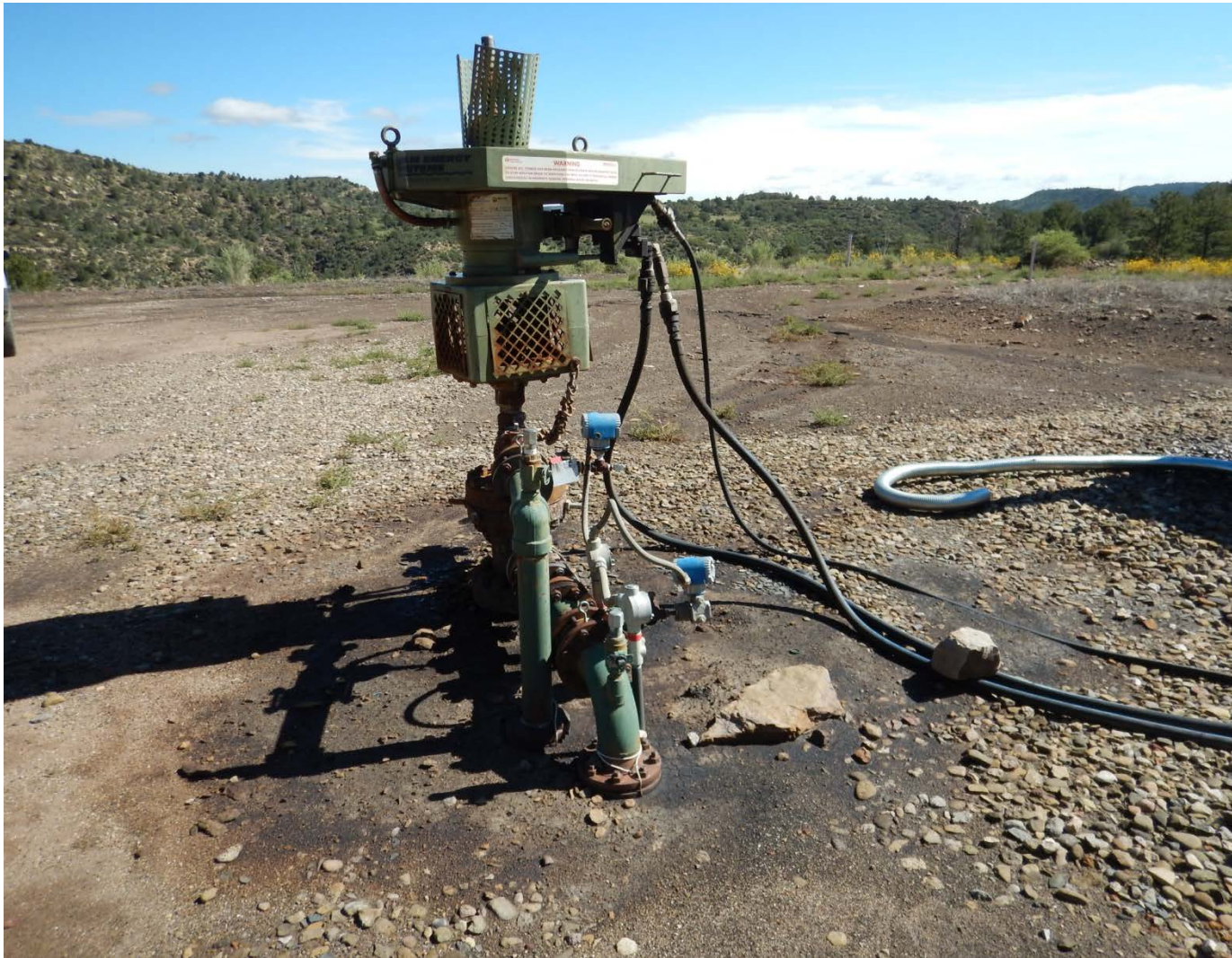
Stained soil around wellhead

Location Name: Apache Canyon 03-11 API: 071-09629 Inspection Date: 9/7/2018