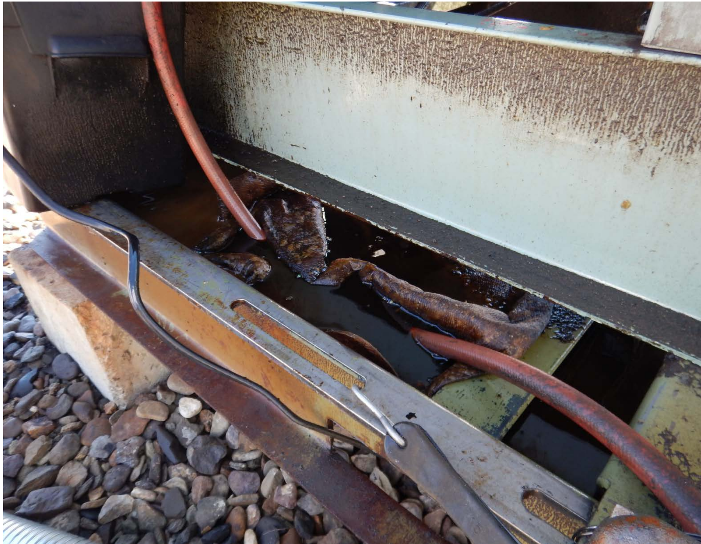
Oil leak from motor. Operator has placed pads to absorb oil in containment below motor.

Location Name: Apache Canyon 03-11 API: 071-09629 Inspection Date: 9/7/2018