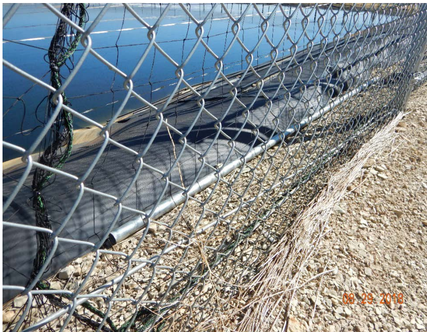
Photo #7 – Metal pipe observed inside of netting on south side of pit.