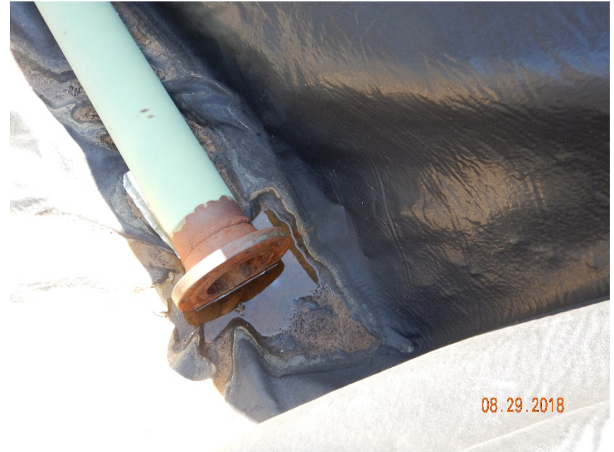
Photo #18 – Steel pipe stored on top of liner on south side of tank berm.