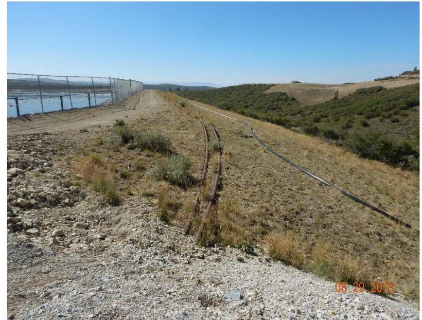
Photo #14 – Steel off-location surface pipelines lead from NW corner of pit toward production facility SE of location (next photo). HDPE surface line was disconnected on date of inspection.