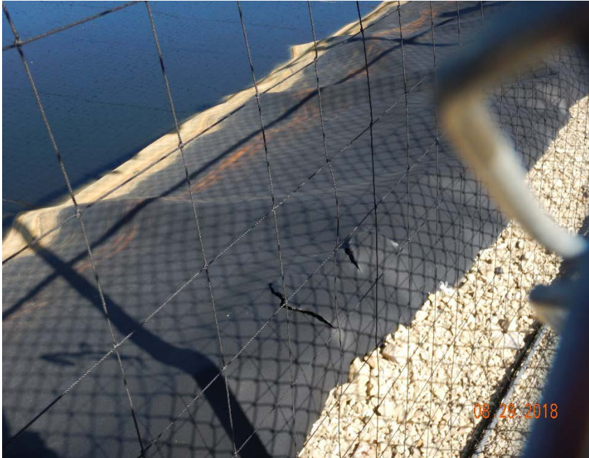
Photo #5 – Holes observed in east pit berm liner (near anchor trench).