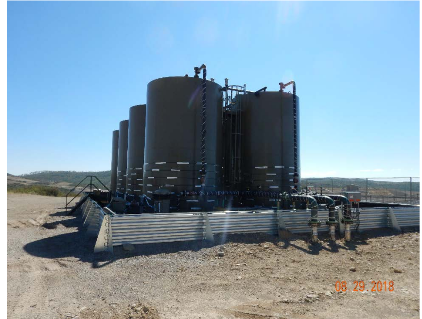
Photo #16 – Array of steel ASTs used as gun barrel separators, located at NE corner of pit.