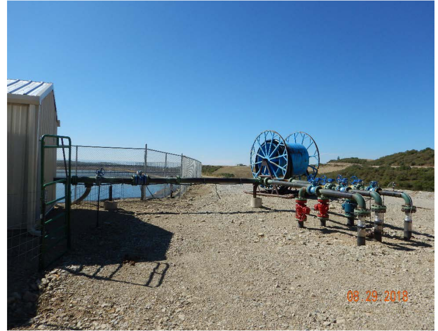
Photo #12 – Pipeline manifold and unused HDPE surface pipe spool observed at NW corner of pit.