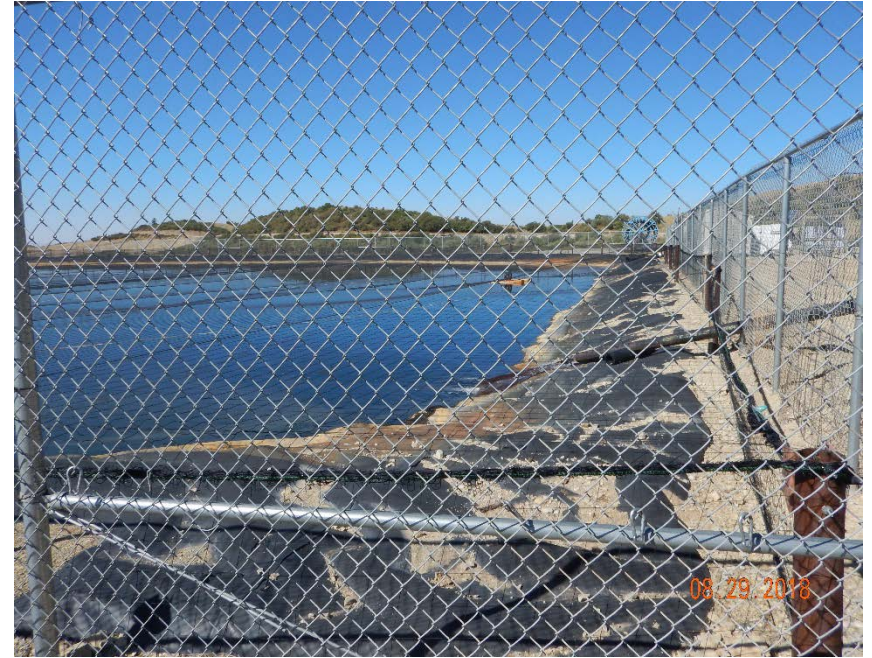
Photo #2 – View of pit from NE corner. Note foreign debris (angular rocks) on top of pit liner.