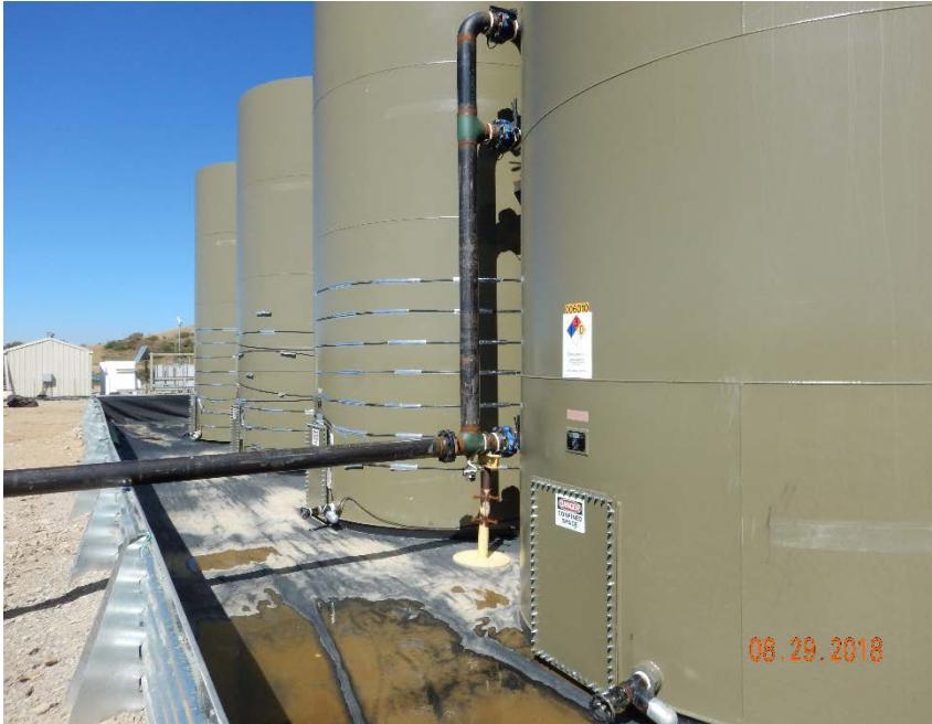
Photo #19 – View of gun barrel tank battery from SE corner. Note only two condensate tanks on east end of battery have labels and placards.