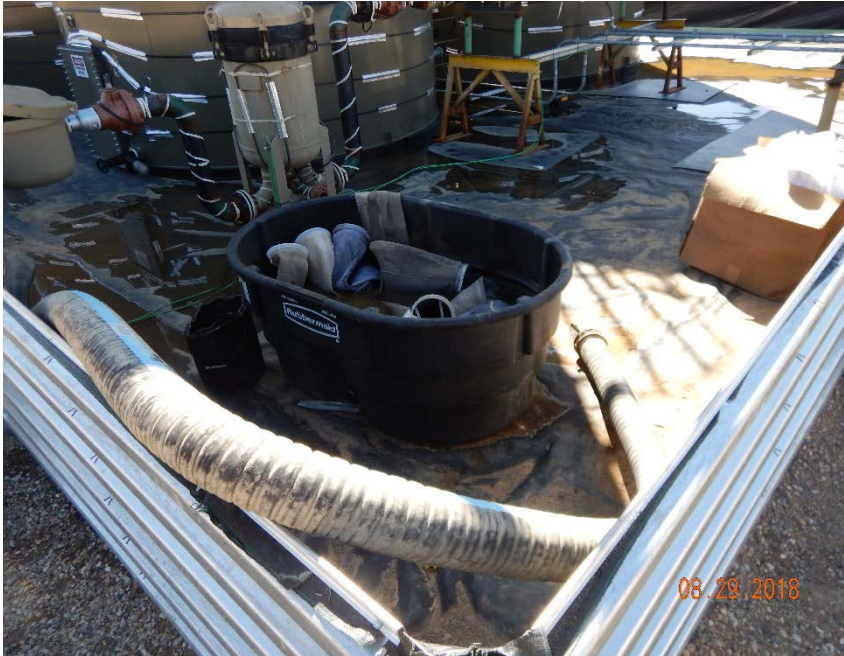
Photo #17 – Unused equipment (hose with camlock, metal bucket, and cardboard box) inside of NW corner of tank battery. Per operator, Rubbermaid tub contains filter socks to be used inside of battery.