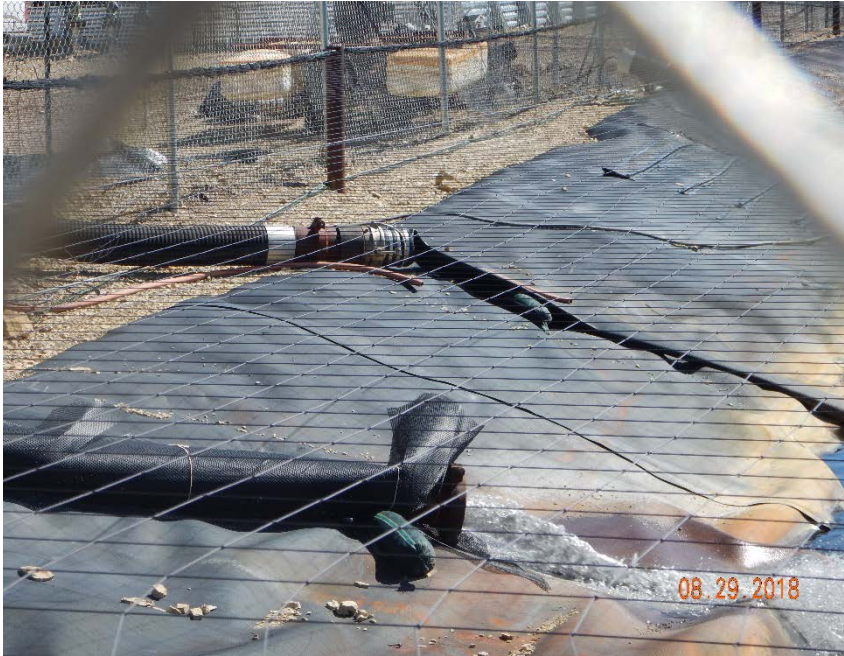
Photo #9 – Hoses with camlocks in direct contact with pit liner at NW corner of pit.