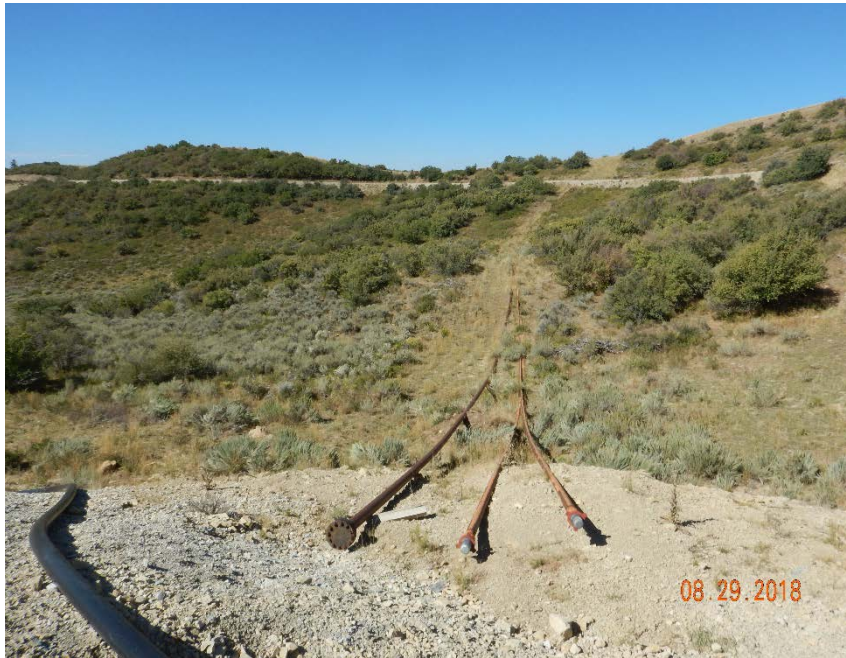
Photo #13 – Capped and plugged off-location surface pipelines leading into location from NW corner, looking west. Note black HDPE surface pipeline in bottom left corner of photo is disconnected.