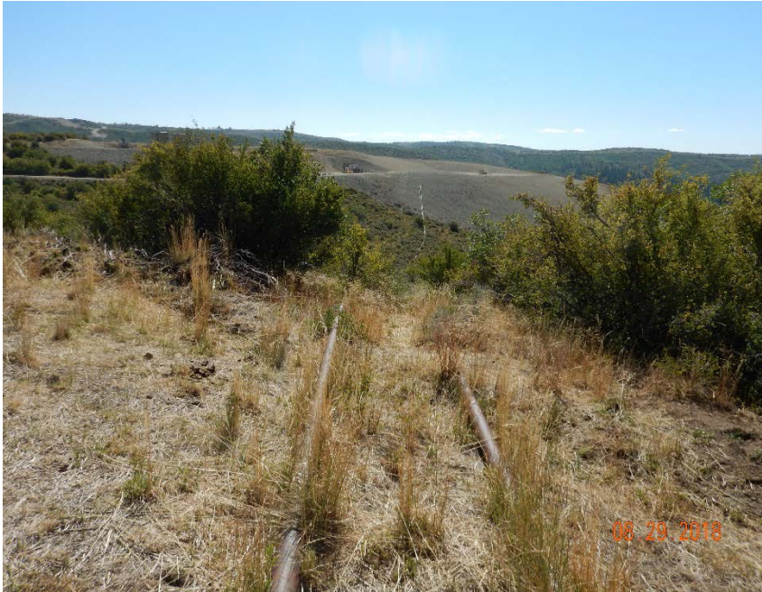
Photo #15 – Looking SE along steel off-location surface pipelines from previous photo.