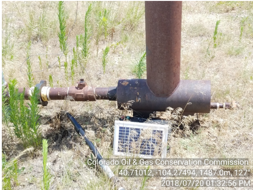
Photo #13 Joker 36-9-62 Candlestick Flare Flare inlet open From previous FIR