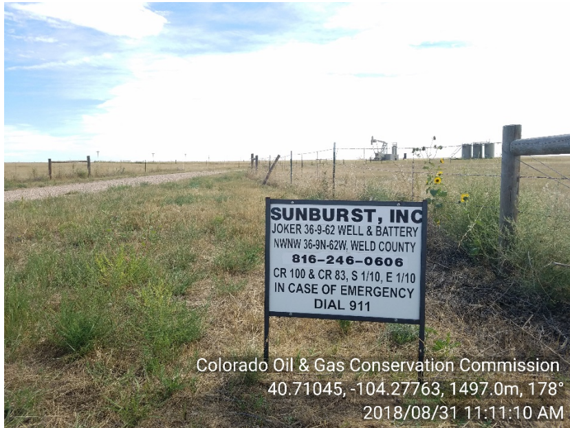
Photo #1 Joker 36-9-62 (API # 05-123-31719) Sign at access road