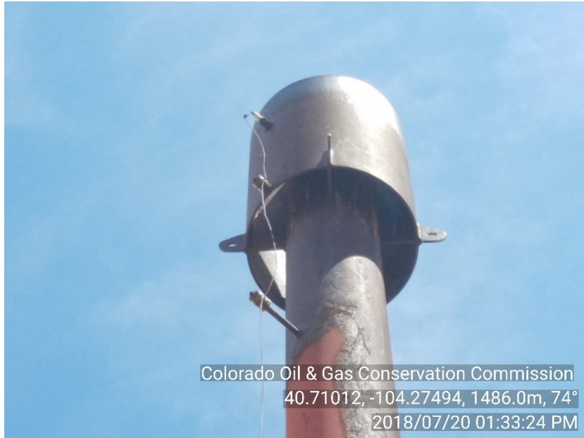
Photo #15 Joker 36-9-62 Candlestick Flare Disconnected ignition wire From previous FIR