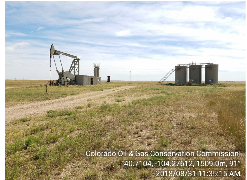
Photo #2 Joker 36-9-62 (API # 05-123-31719) Battery