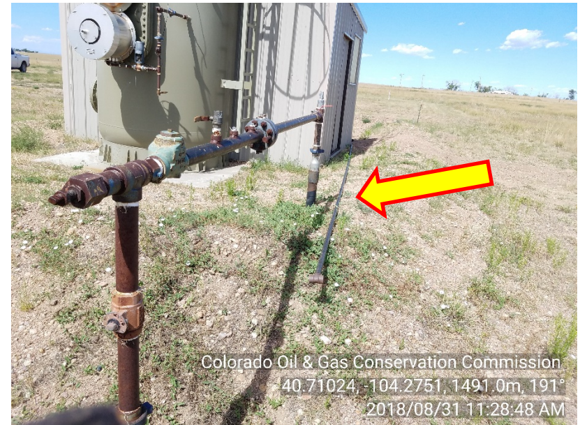
Photo #22 Joker 36-9-62 Gas meter run Valves appear Closed Unused Equip (Line pipe)