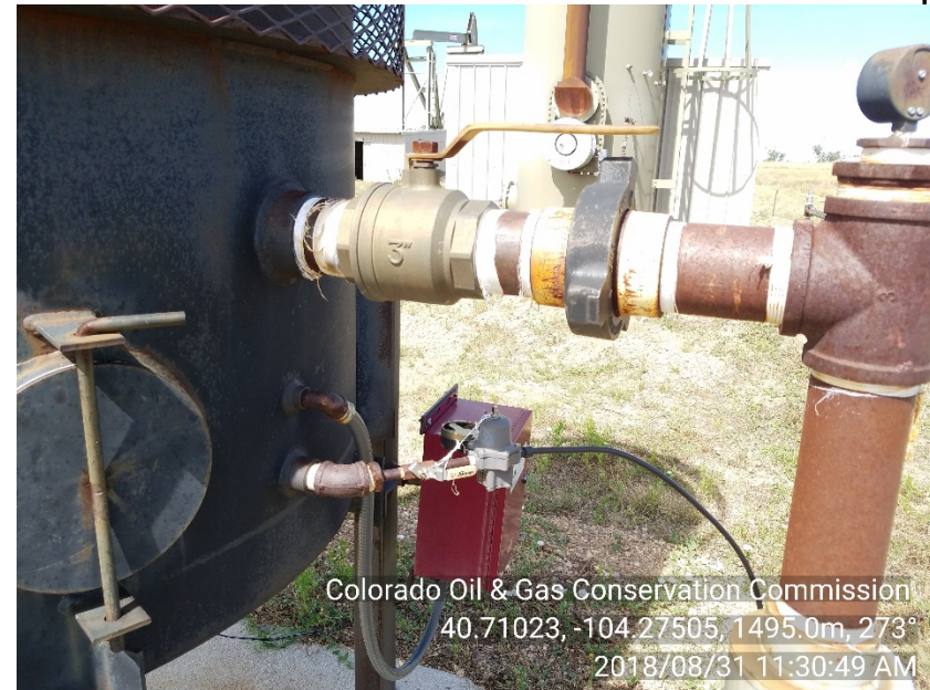
Photo #18 Joker 36-9-62 ECD Inlet & pilot valves open. Pilot is unlit. ECD not in operation