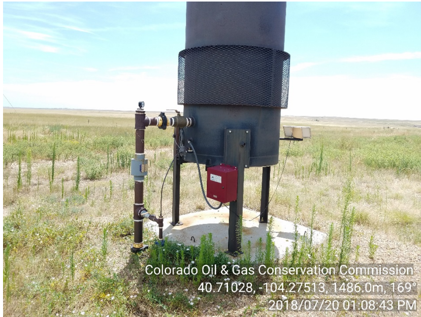
Photo #17 Joker 36-9-62 ECD Inlet valve is shut. Not in operation. From previous FIR