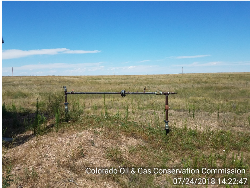
Photo #21 Joker 36-9-62 Gas meter run Valves appear partially open From previous FIR