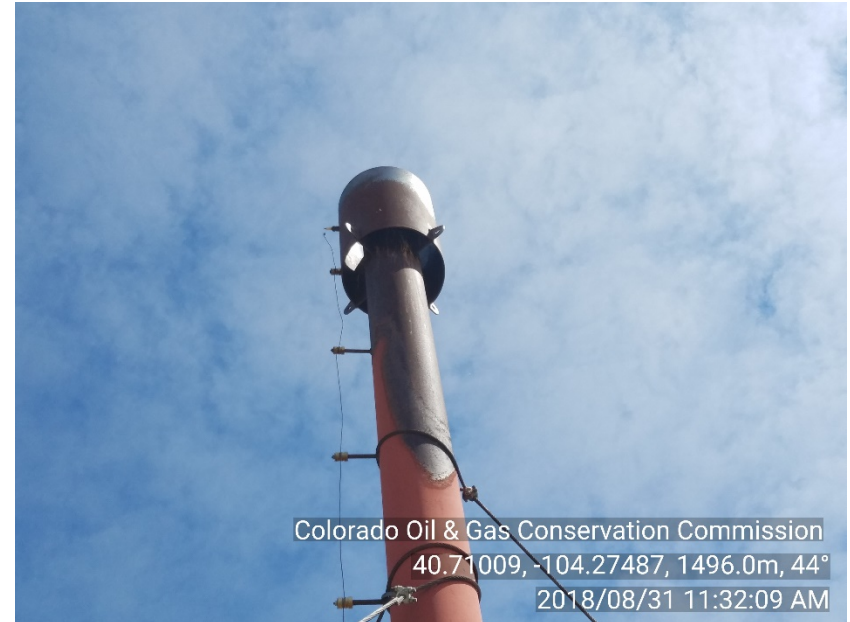
Photo #16 Joker 36-9-62 Candlestick Flare Ignition wire remains disconnected