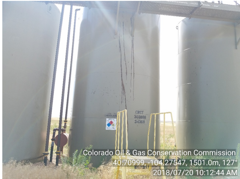
Photo #5 Joker 36-9-62 Oil & H2O tanks Stain on middle tank From previous FIR