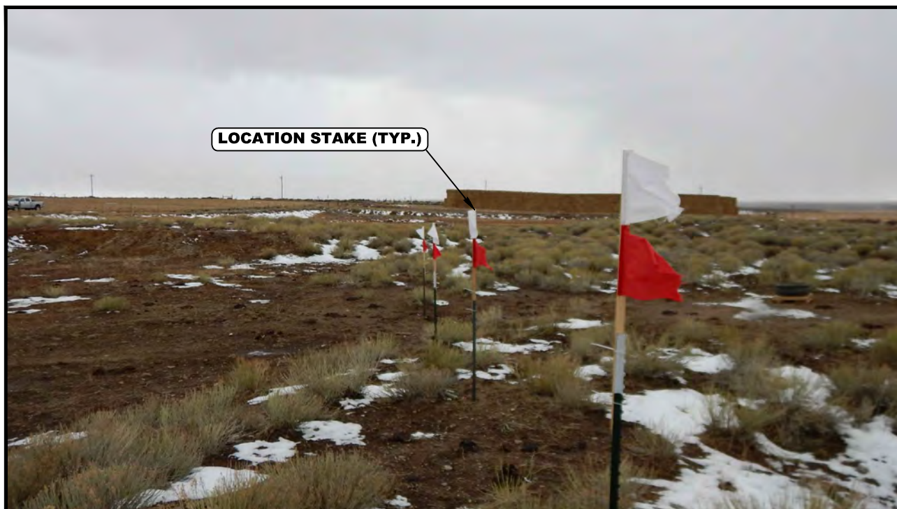
PHOTO: VIEW OF LOCATION STAKES LOCATED IN THE SW 1/4 SE 1/4 OF SECTION 29