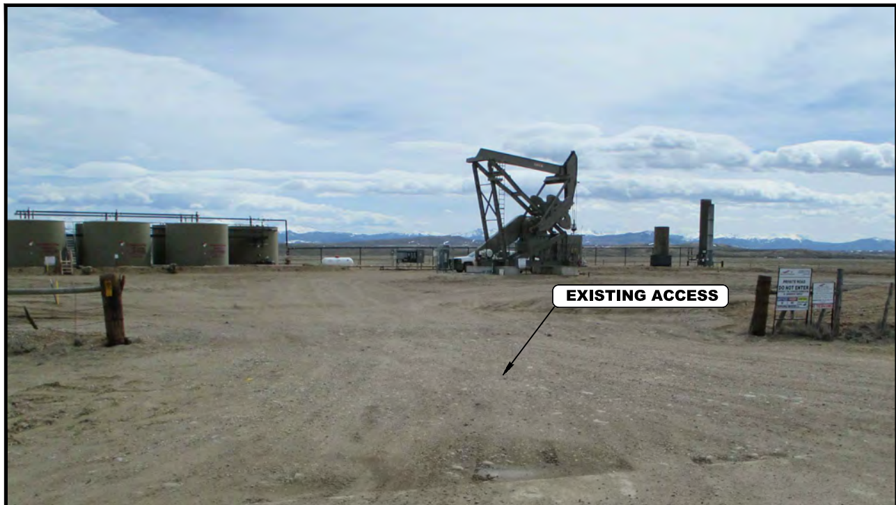
PHOTO: VIEW FROM BEGINNING OF ACCESS LOCATED IN THE NE 1/4 NW 1/4 OF SECTION 32