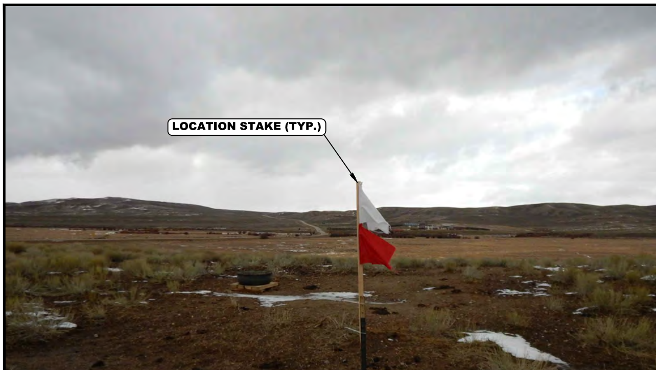
PHOTO: VIEW OF LOCATION STAKES LOCATED IN THE SW 1/4 SE 1/4 OF SECTION 29