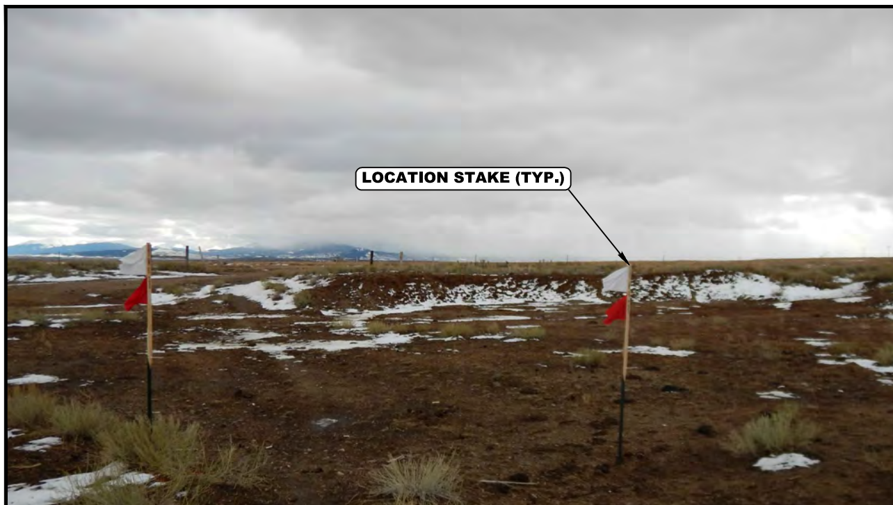
PHOTO: VIEW OF LOCATION STAKES LOCATED IN THE SW 1/4 SE 1/4 OF SECTION 29