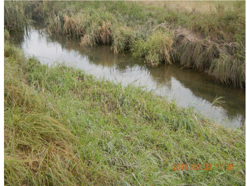
Photo 10. Spring Gulch.