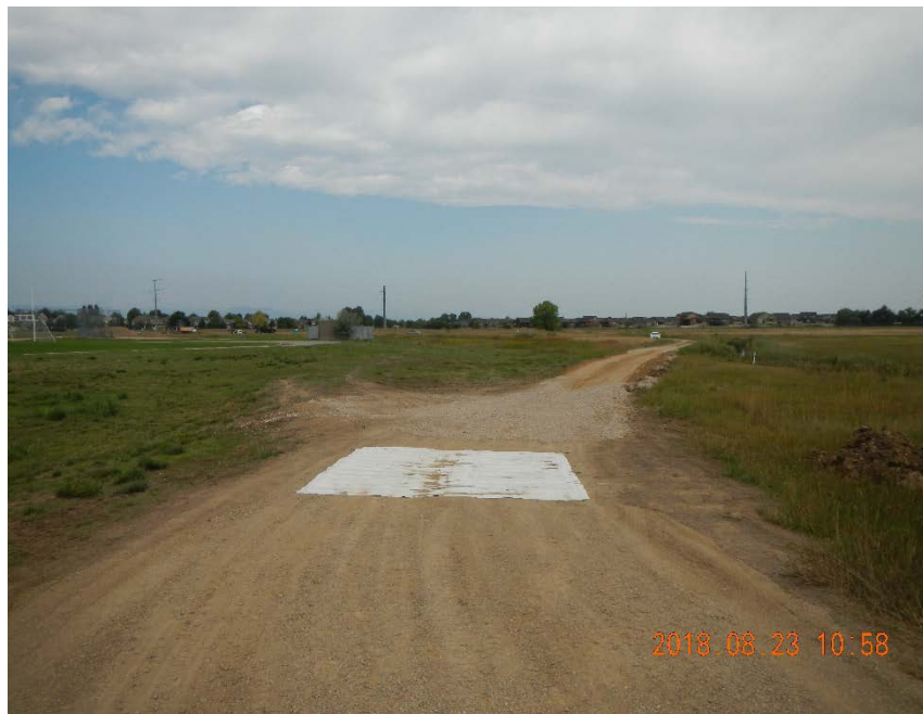
Photo 7. Vehicle tracking control pad.