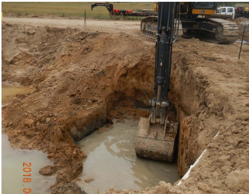
Photo 3. Excavating smear zone.