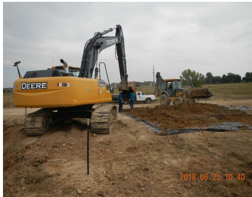
Photo 4. Spoil pile on liner.