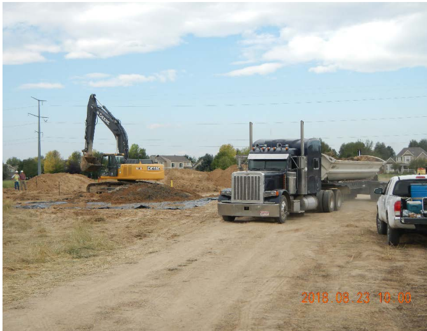
Photo 1. Excavation activities.