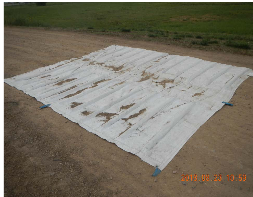
Photo 8. Vehicle tracking control pad.