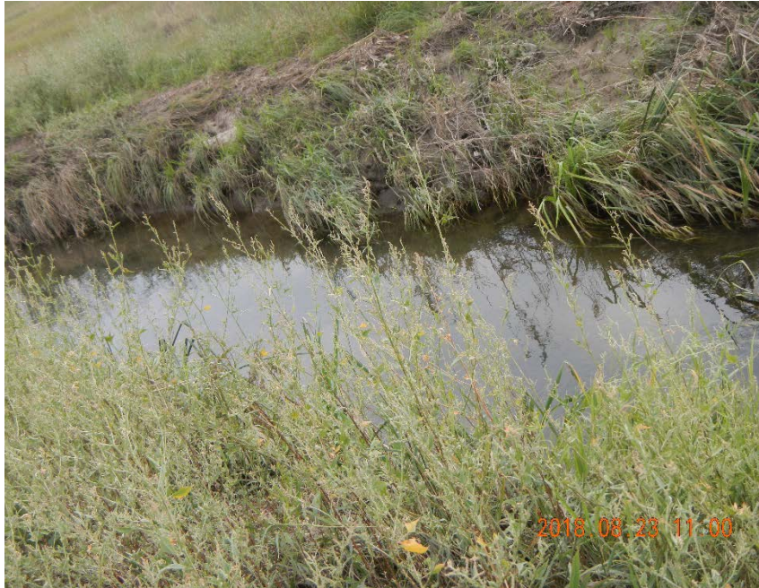
Photo 9. Spring Gulch.