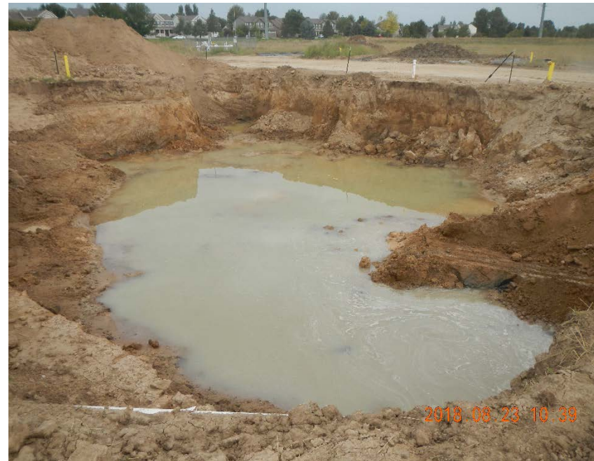
Photo 2. Ground water infiltrating open excavation.