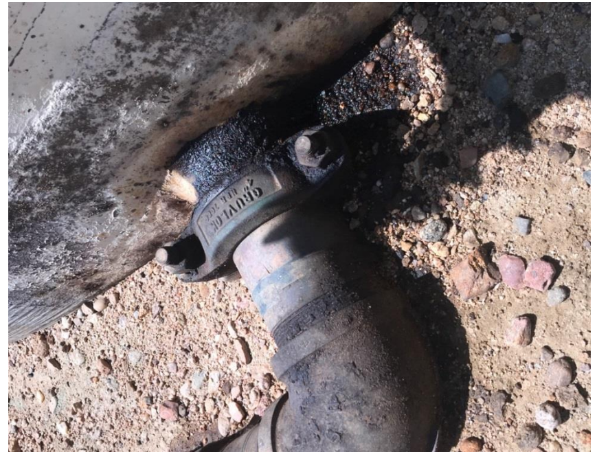
Photo#10 Corrective Action bottom of tank is leaking from connection