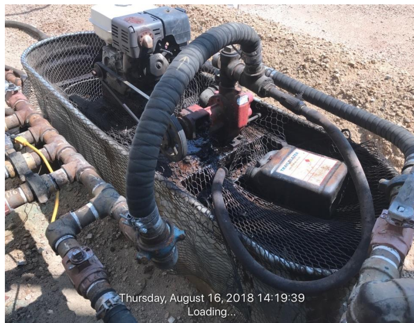
Photo#6 Corrective Action. Containment tank needs to be bottomed out.