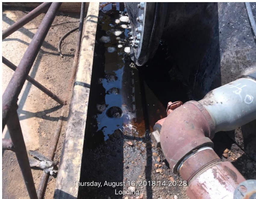
Photo#3 Corrective Action Fluid leaking on the ground inside containment. Called Operator right away