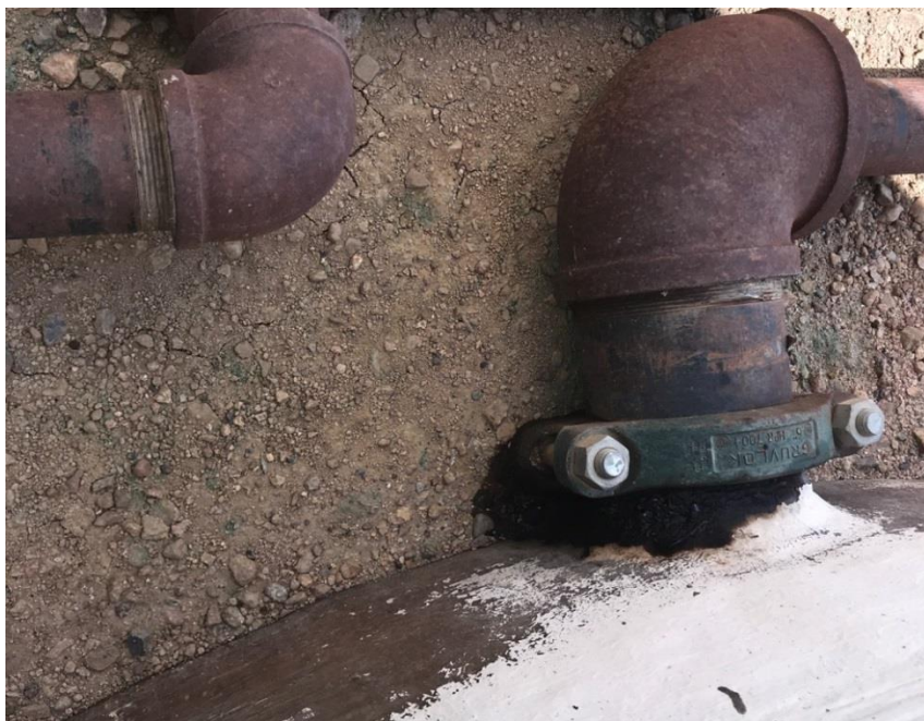
Photo#7 Corrective Action/Bottom of tank is leaking from connection