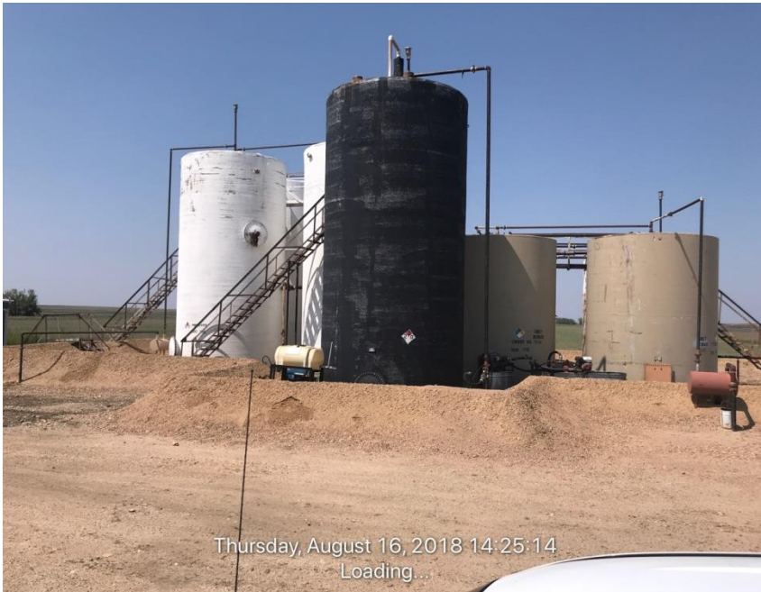
Photo#1 Location/(4) 400bbl water tanks/(1)450bbl crude oil and water/(4)300bbls production tanks