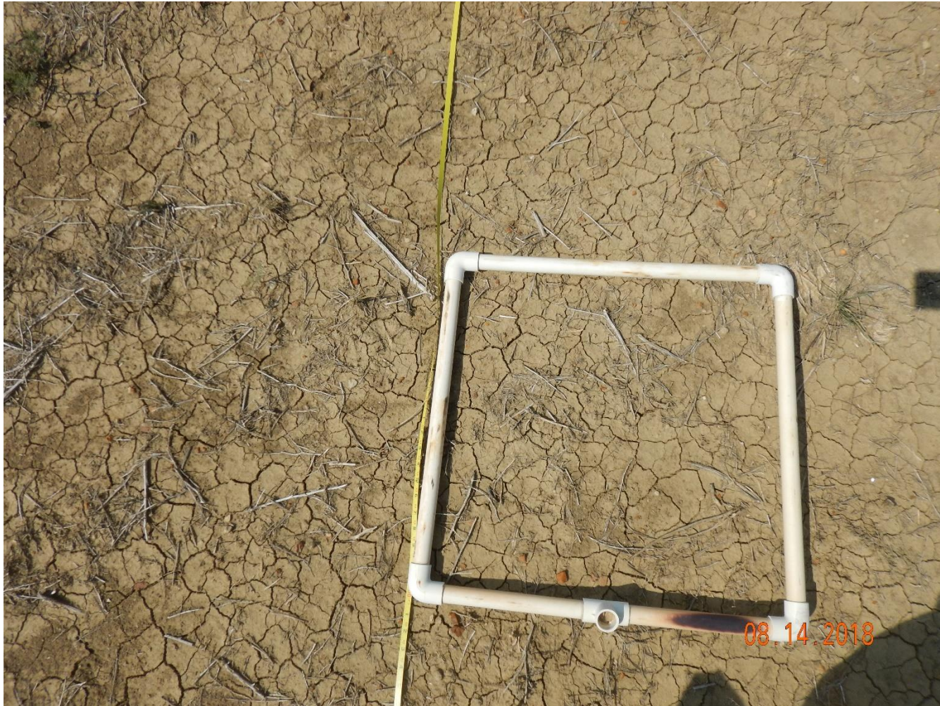
Photo 10: Photo taken from the midpoint of the germination survey. Survey shows location has an average germination of 0.8 seedlings per \frac{1}{2} m 2 , or 0.148 seedlings per square foot.