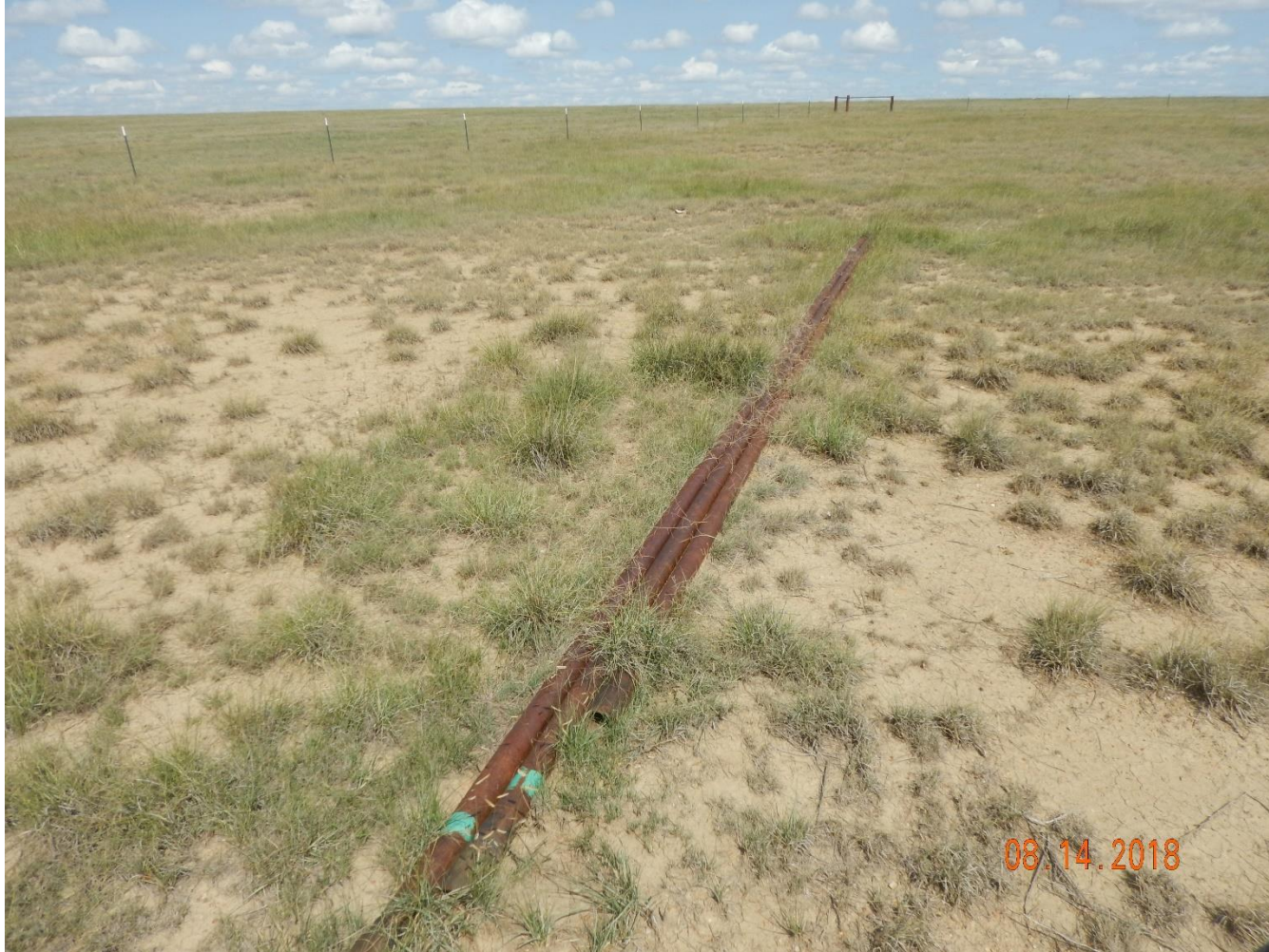
Photo 5: Photo taken from the north end of the location, facing northeast. Previous inspection documented pipe equipment remaining on location and required it to be removed. Photo shows pipe remains on location.