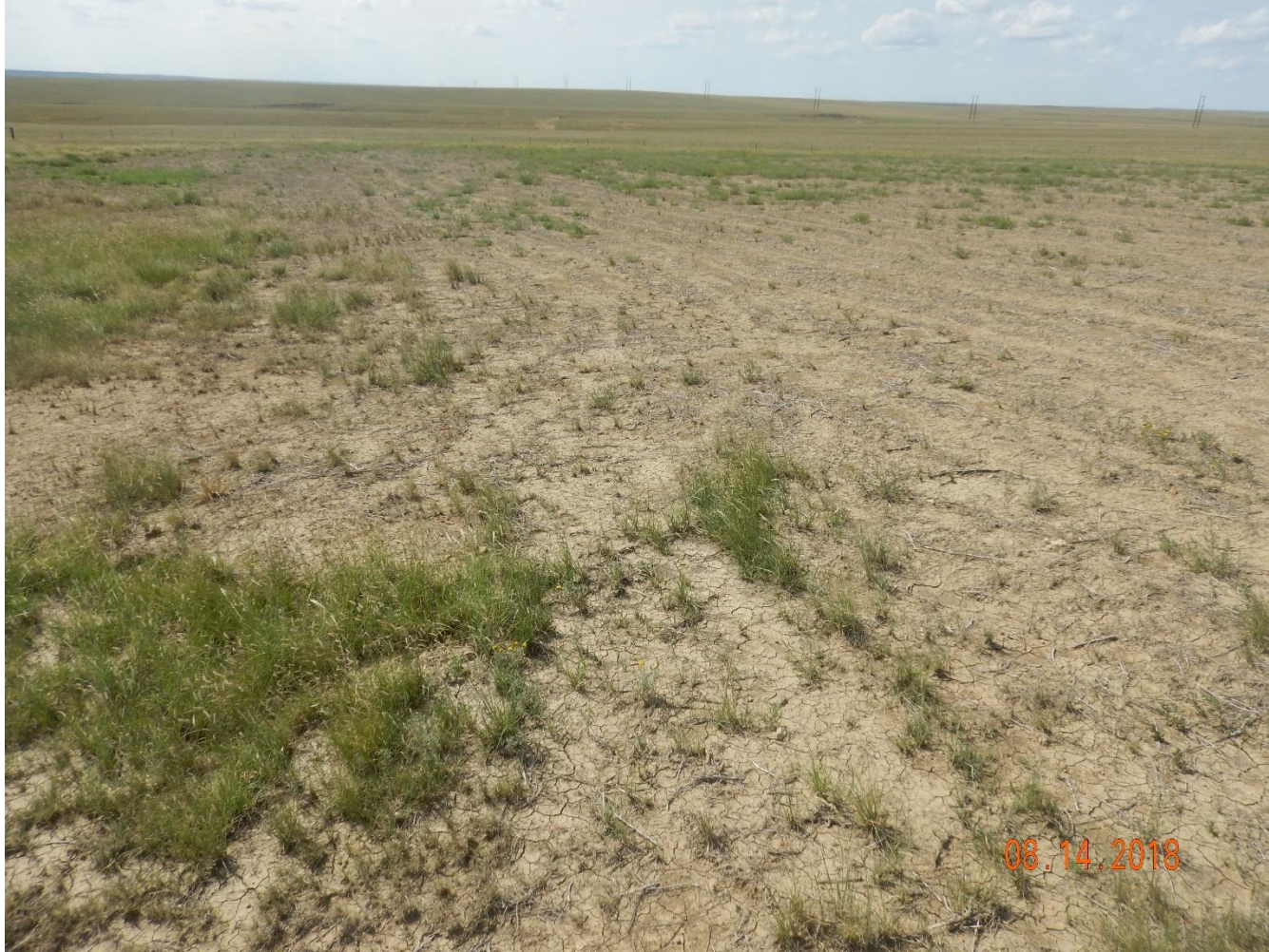
Photo 1: Photo taken from the south end of the location, facing west. Photos 1-4 provide an overview of the location, facing west, northwest, northeast, to east. Photo shows the reclamation area. Location remains predominantly bare and exposed soil. Vegetation observed predominantly undesirable weedy plant species. Unable to find evidence of work conducted per corrective actions.