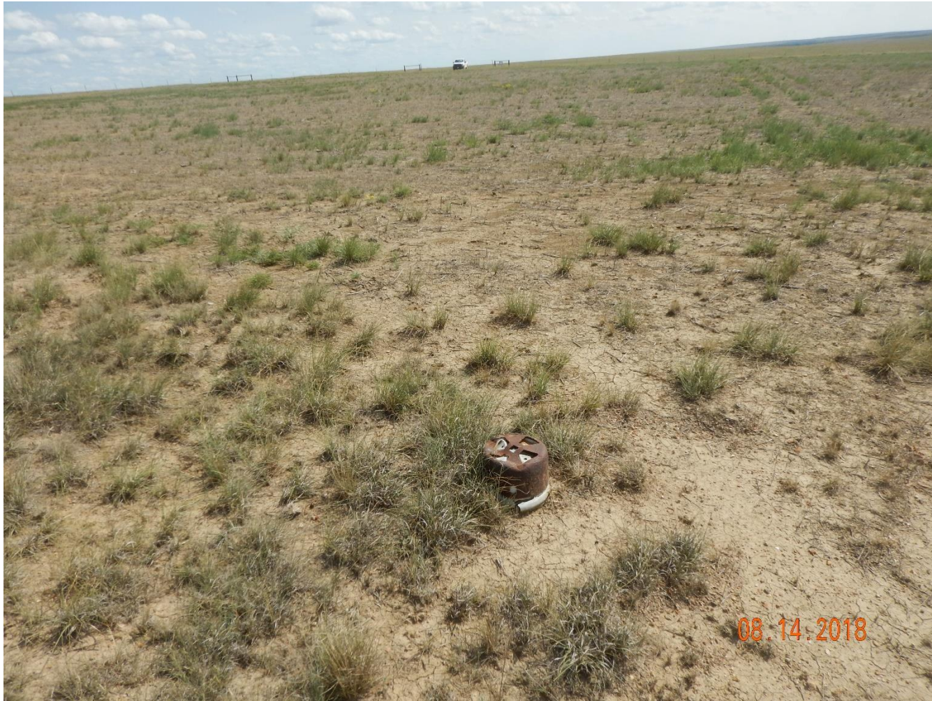
Photo 6: Photo taken from the north end of the location, facing south. Previous inspection documented equipment/trash debris remaining on location and required it to be removed. Photo shows equipment/trash debris remains on location.