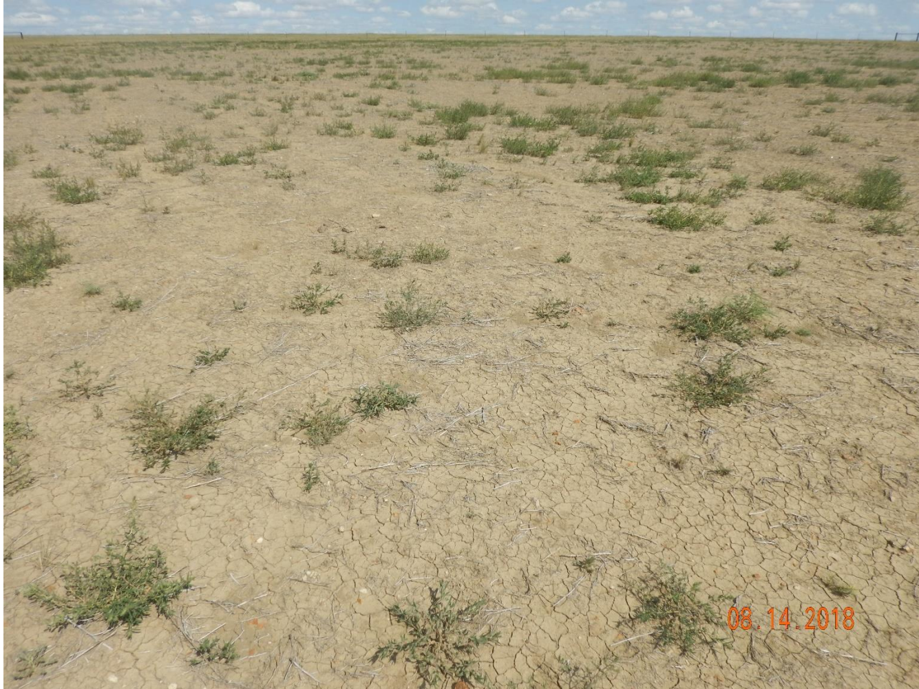
Photo 7: Photo taken from the west end of the location, facing east. Photo shows the reclamation area. Location remains predominantly bare and exposed soil. Vegetation observed predominantly undesirable weedy plant species. Unable to find evidence of work conducted per corrective actions.