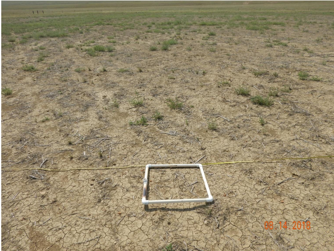
Photo 9: Photo taken from the midpoint of the germination survey. Photo shows location is mostly bare and exposed soil, and vegetation over the reclamation area is predominantly undesirable weedy plant species.