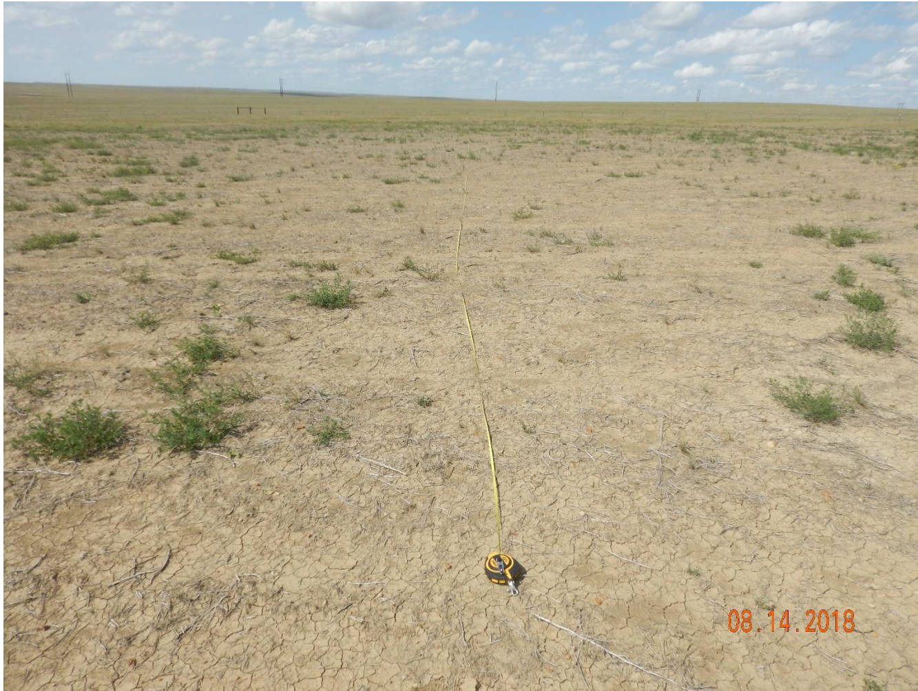
Photo 8: Photo taken from the central area of the location, facing north. Photo shows 1 of the 2 germination surveys conducted on the location.