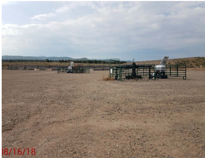
Location Photo #3,