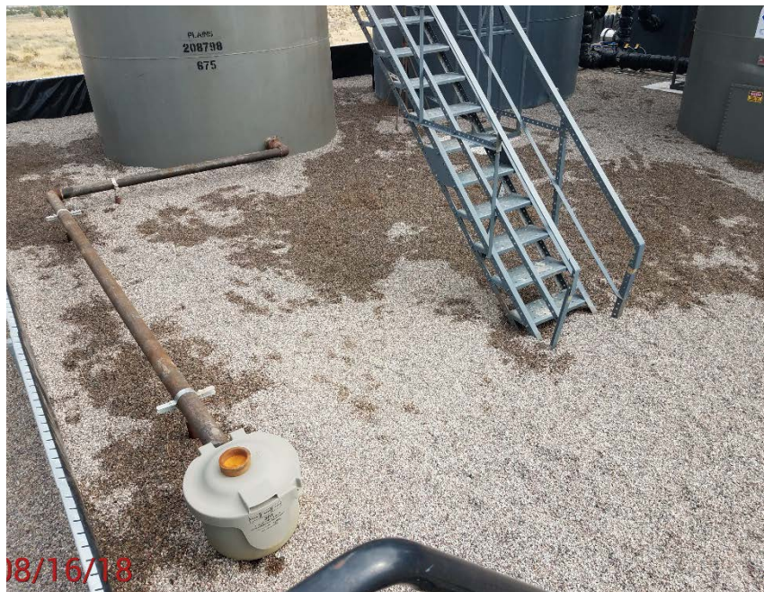
Location Photo #5, Stained rock in containment area.