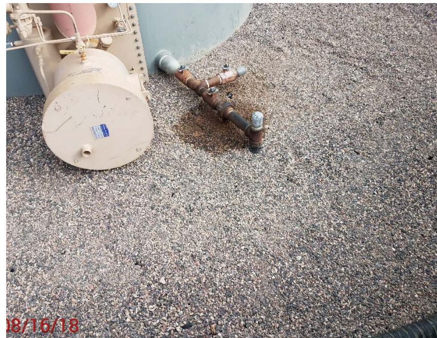
Location Photo #4, Stained rock in containment area.