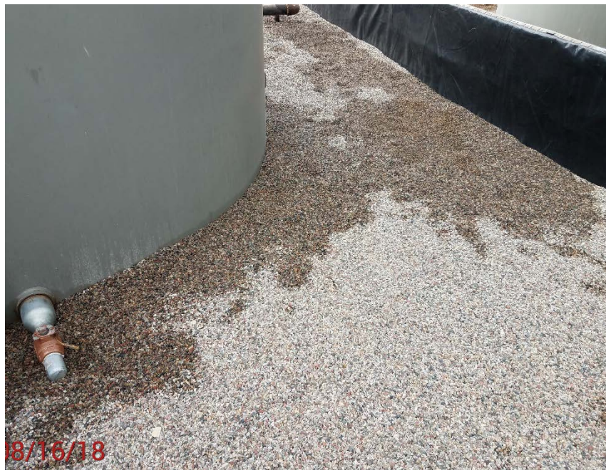
Location Photo #11, Stained rock in containment area.