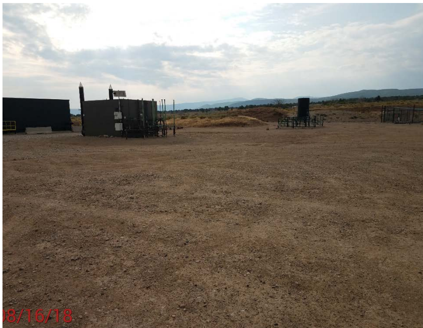
Location Photo #1,