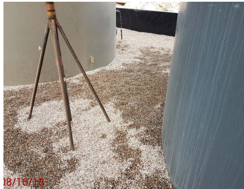
Location Photo #8, Stained rock in containment area.