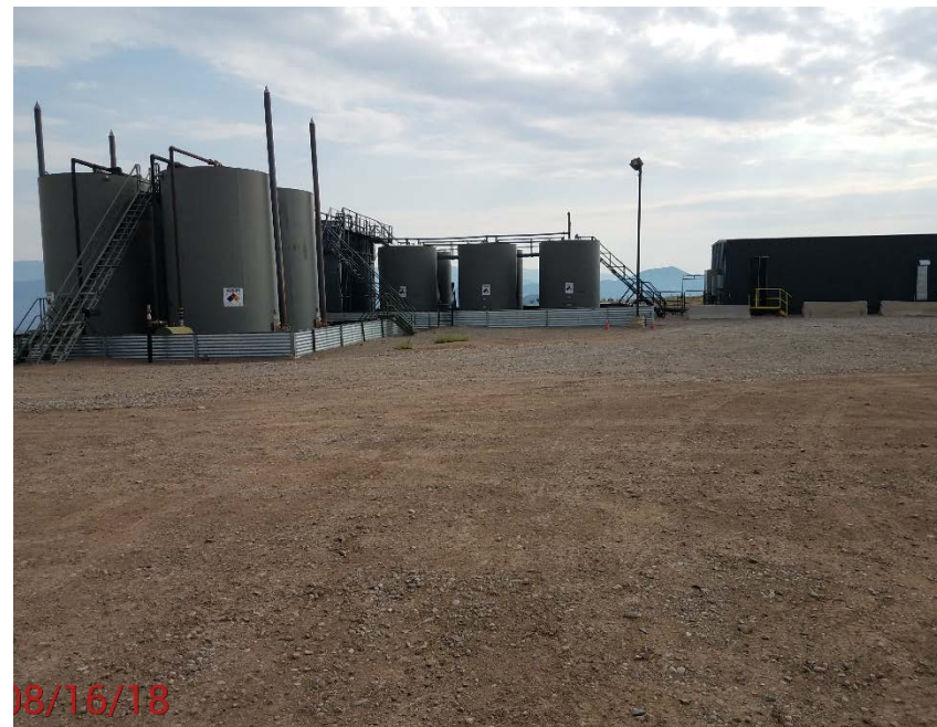
Location Photo #2,