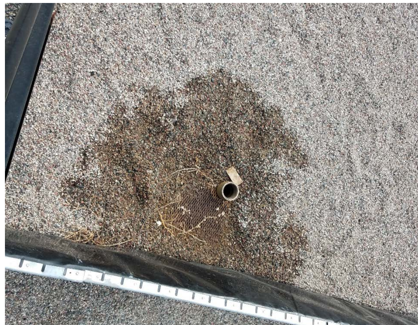
Location Photo #6, Stained rock in containment area.