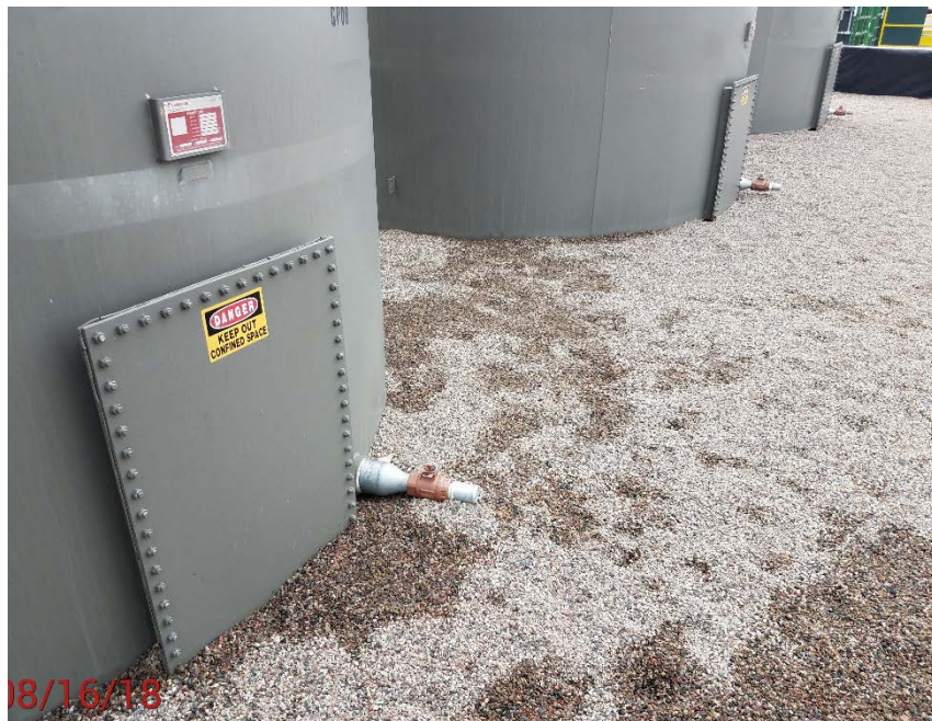
Location Photo #7, Stained rock in containment area.