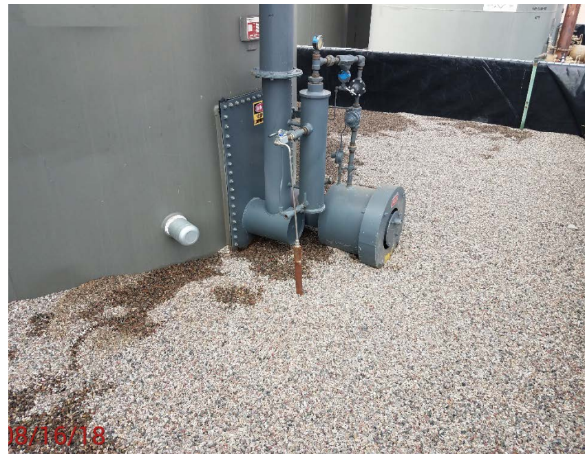
Location Photo #10, Stained rock in containment area.