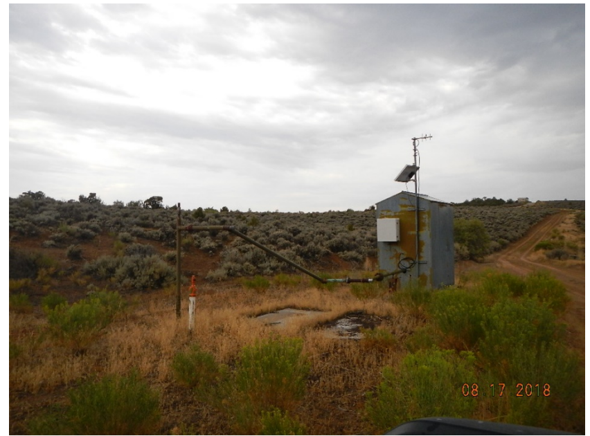
Photo 2. Risers have been marked..