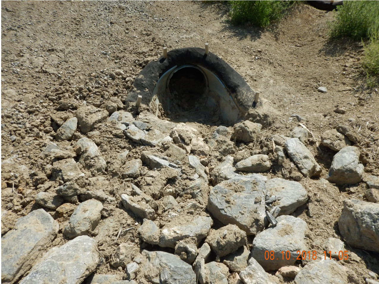
Photo 6. Photo taken from the entrance of the location, facing East. Culvert in need of maintenance, as material appears to have filled in. Riprap outlet material appears to need maintenance.