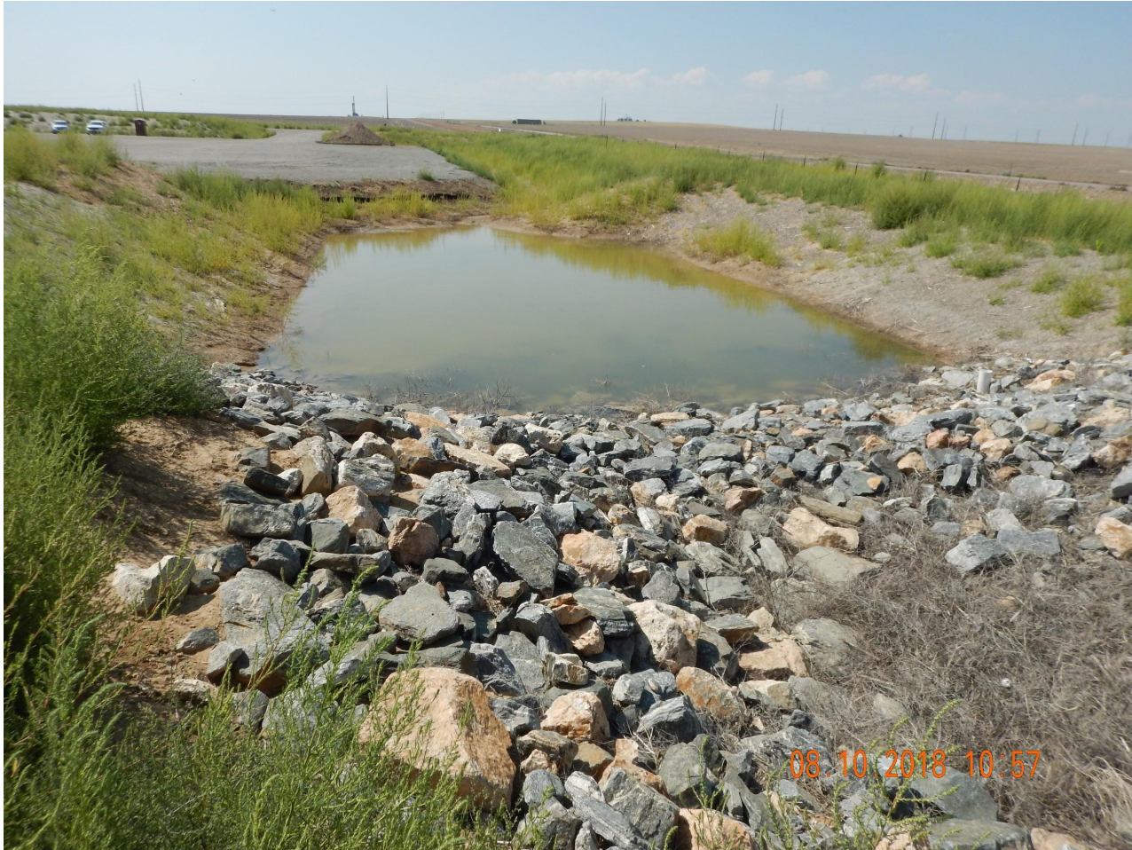
Photo 4. Photo taken from the northwestern location, facing South. Sediment basin appears to be properly functioning. No sediment discharge was observed off location.