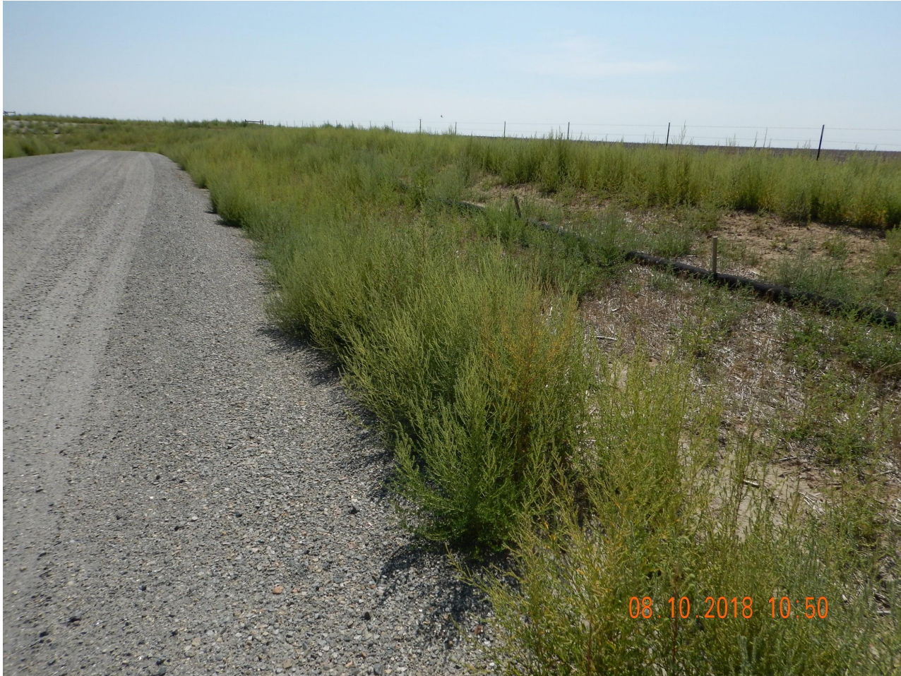
Photo 1. Photo taken from the entrance of the location, facing East. Operator has failed to manage and control Kochia and Russian thistle throughout the entire location, minus the compacted graveled areas. Germination of grass species was observed within the weed growth but an assessment was not made throughout due to the high density of weeds.