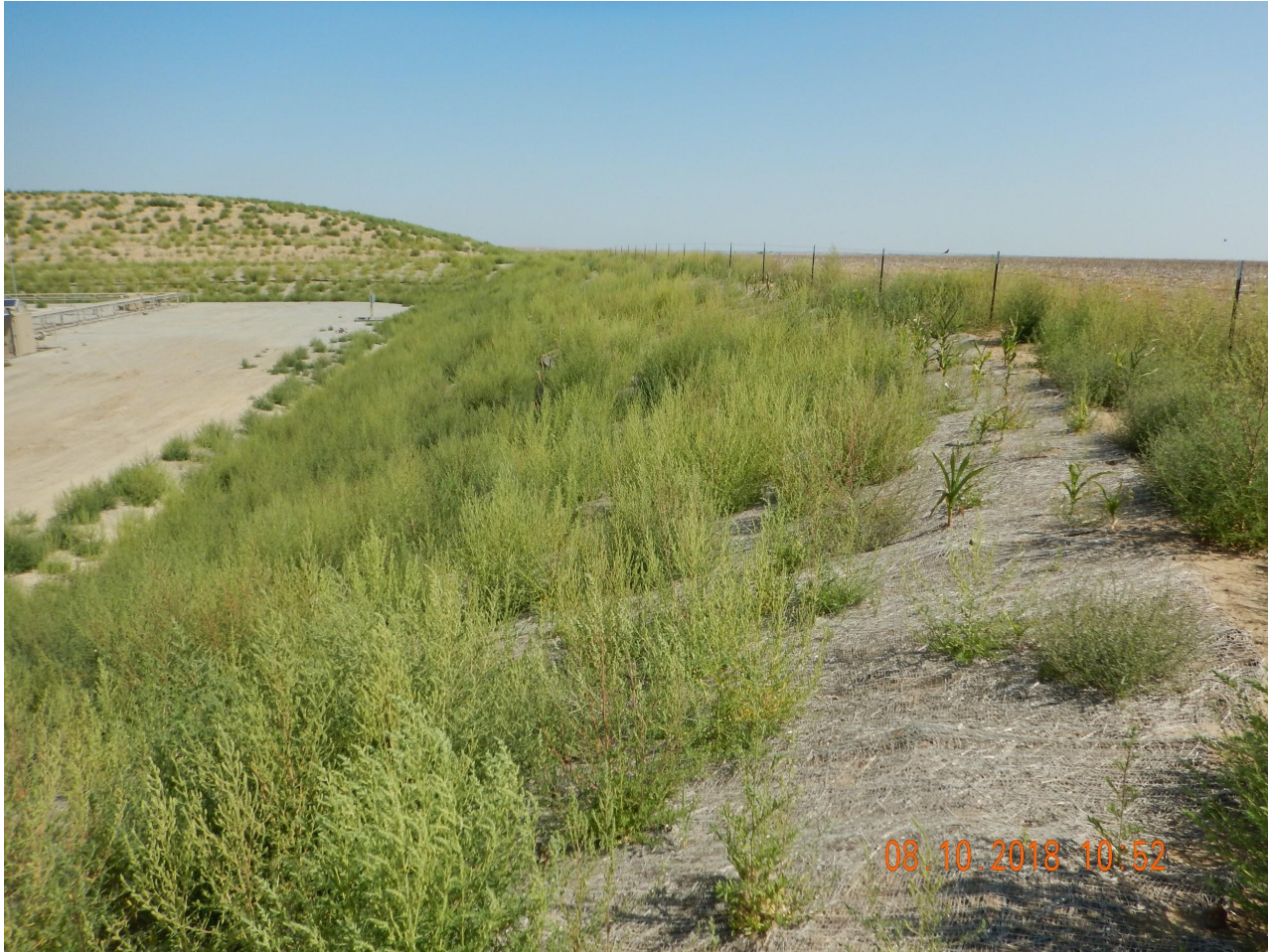
Photo 2. Photo taken from the southeastern perimeter of the location, facing North. See comments under Photo 1. Photo also illustrates erosion control blankets which have been installed along portions of cut slopes.