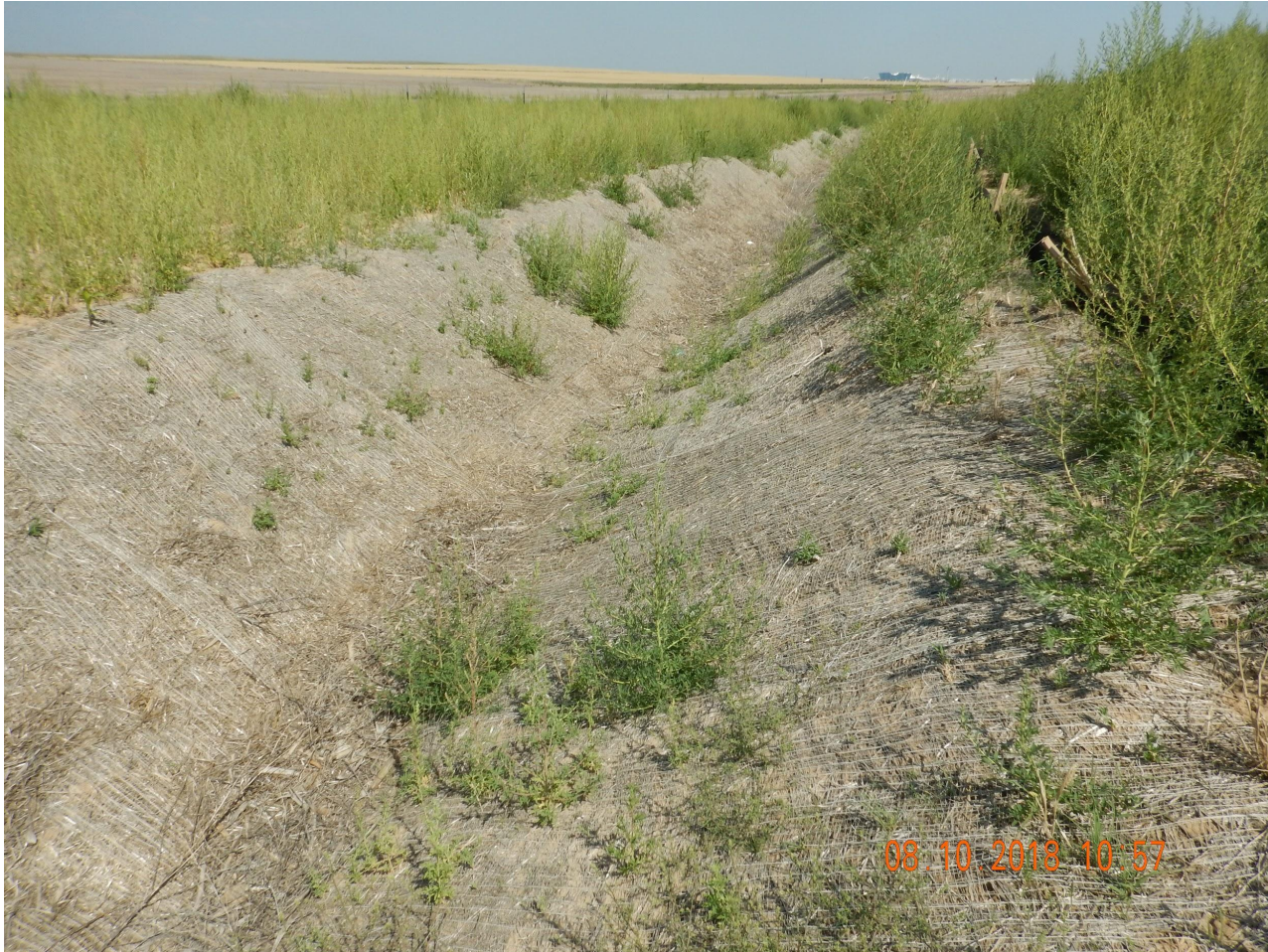
Photo 5. Photo taken from the northwestern location, facing North. Operator has installed a stabilized ditch outlet area from the sediment basin. Photo also illustrates Kochia and Russian thistle weeds.