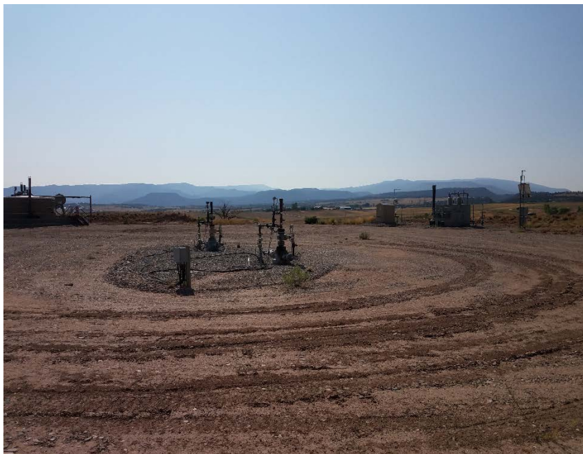
Location Photo #1