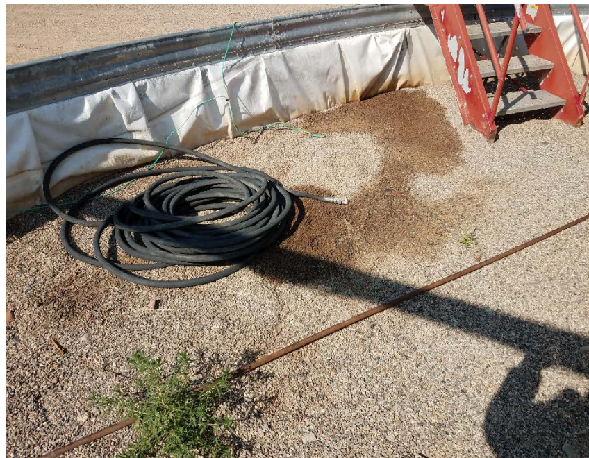
Location Photo #4, Stained rock in tank containment.