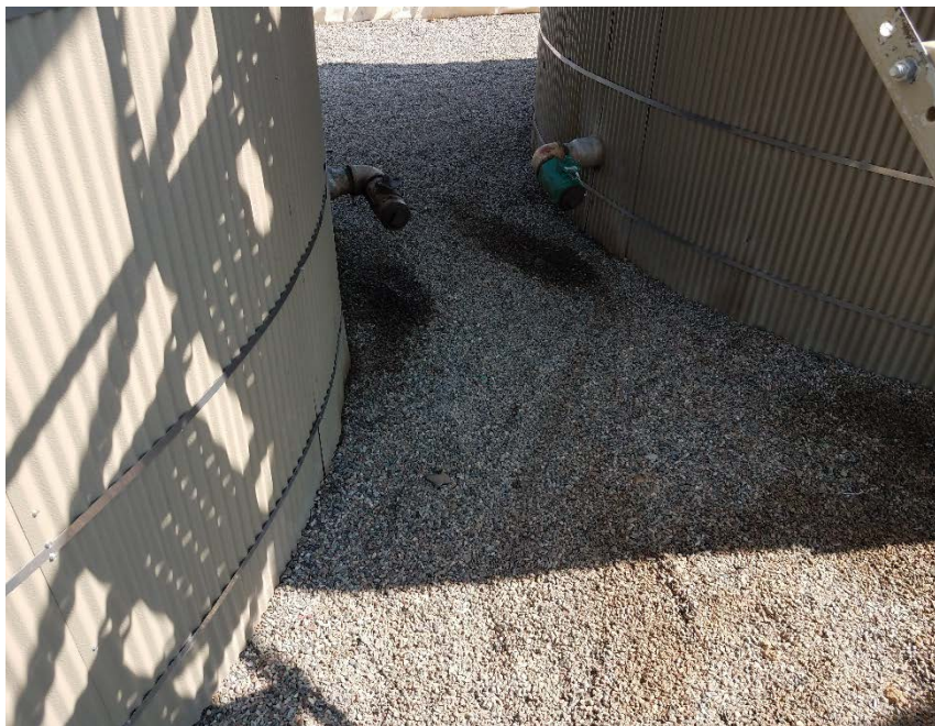
Location Photo #5, Stained rock in tank containment.