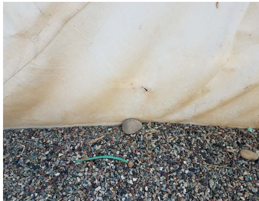
Location Photo #6, Hole in secondary containment.