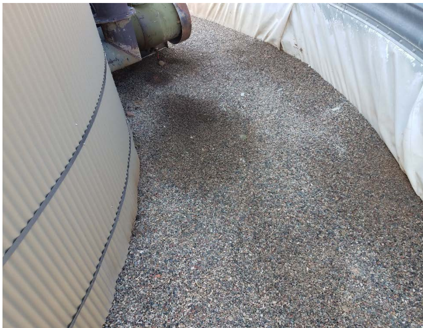
Location Photo #3, Stained rock in tank containment.