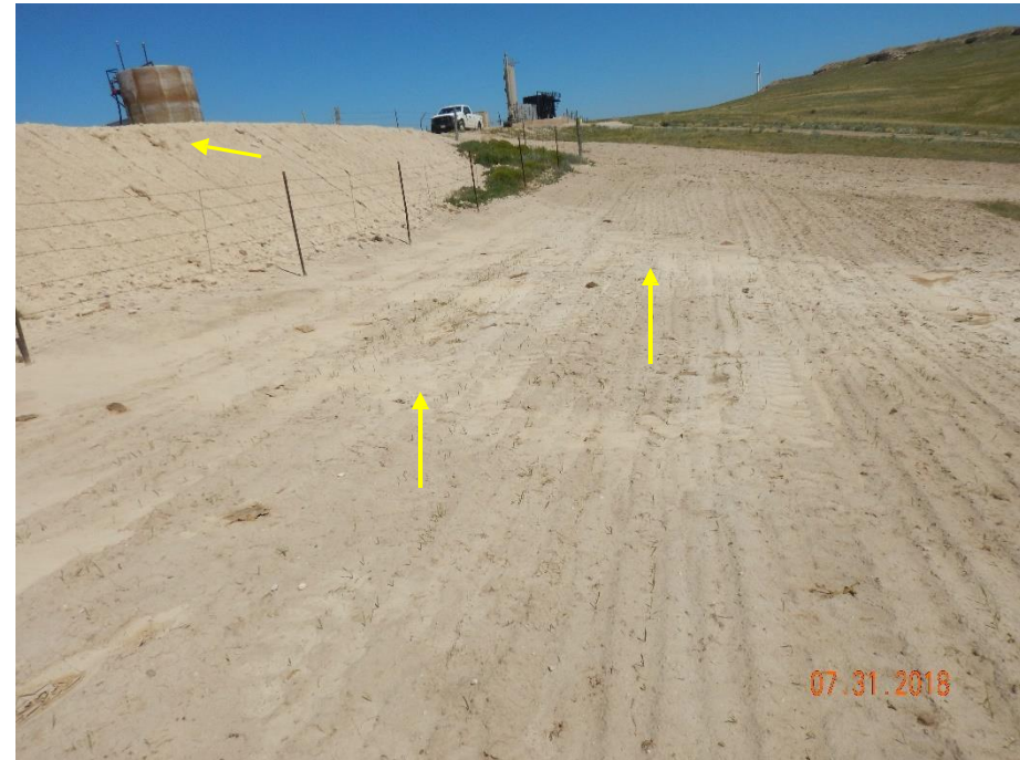
Photo 6: Photo taken from the east end of the pit, facing north. See comments under photo 3.