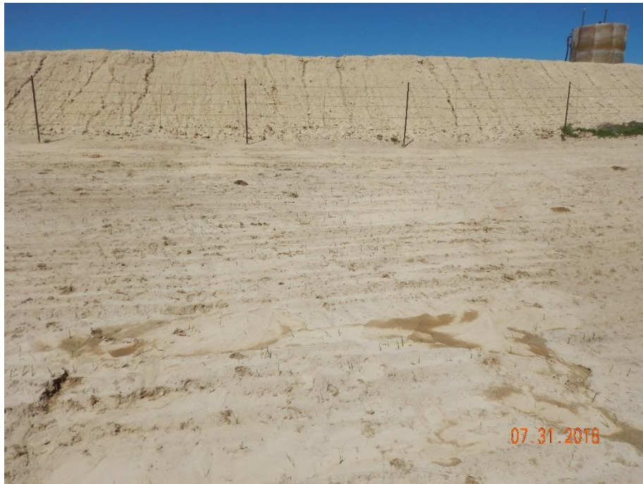
Photo 7: Photo taken from the east end of the pit, facing west. See comments under photo 3.