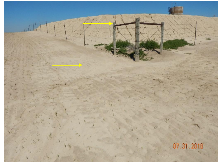
Photo 8: Photo taken from the southeast end of the pit, facing north west. Photo shows erosion degradation has continued from the pit with sediment being transported off location and onto the interim areas. Additionally, interim areas of the location have been regraded and appears to have been reseeded. However, no stabilization, or stormwater and erosion control BMPs have been installed per the corrective actions. Photos show erosion degradation has been allowed to continue on the slopes.