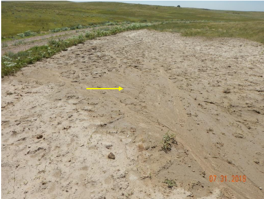
Photo 5: Continued from photo 4. Photo shows sediment deposition caused by stormwater erosion from the slopes.