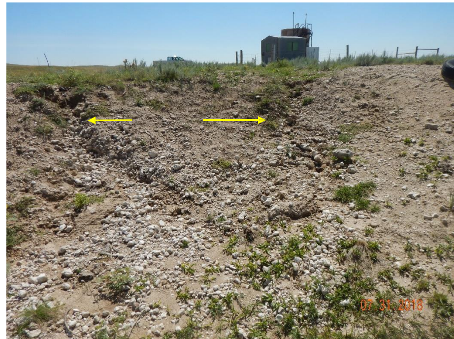
Photo 14: Photo taken from the west end of the location, facing east. See comments under photo 13.