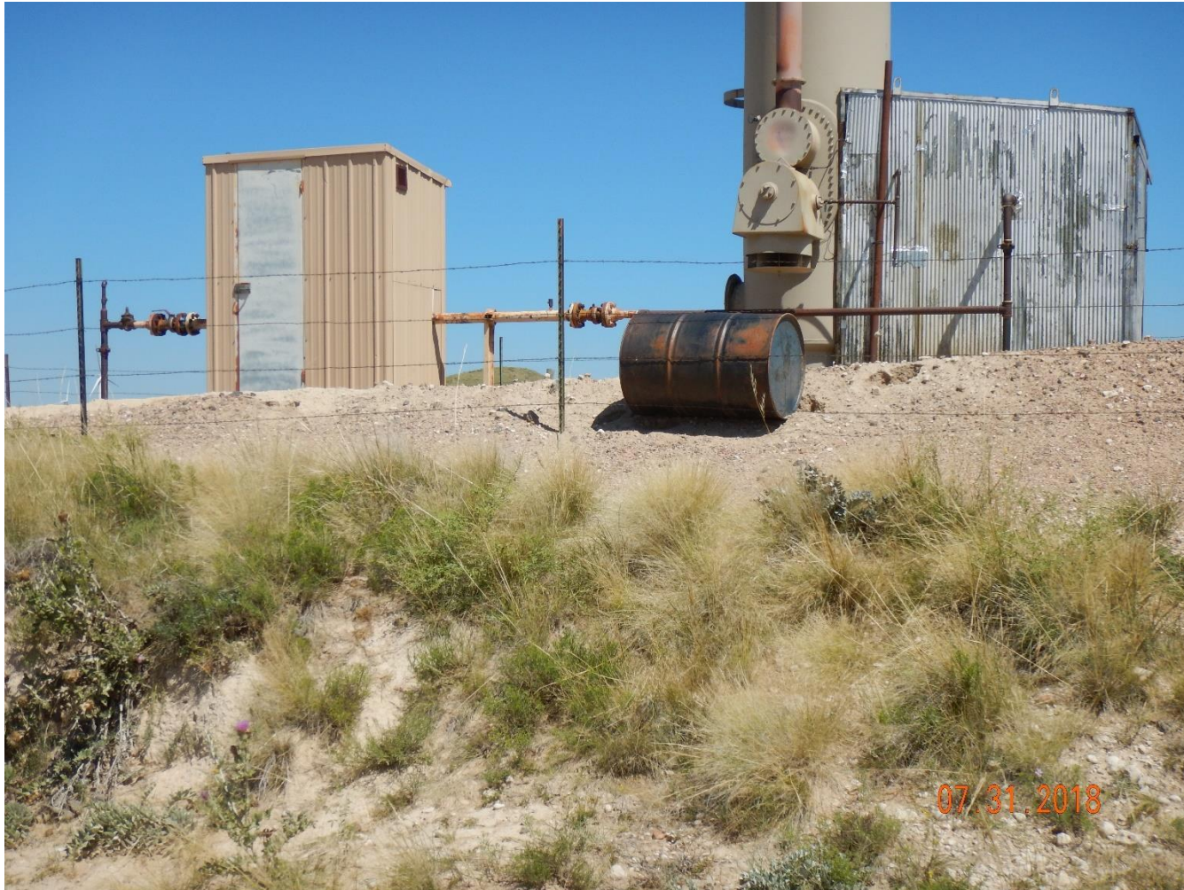
Photo 15: Photo taken from the south end of the facilities, facing north. Photo shows barrel laying along fence. This is improper materials management, barrel needs to be placed in secondary containment, or removed and properly stored.