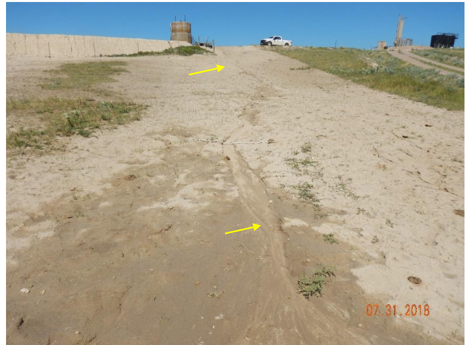
Photo 4: Photo taken from east of the pit, facing northwest. See comments under photo 3.