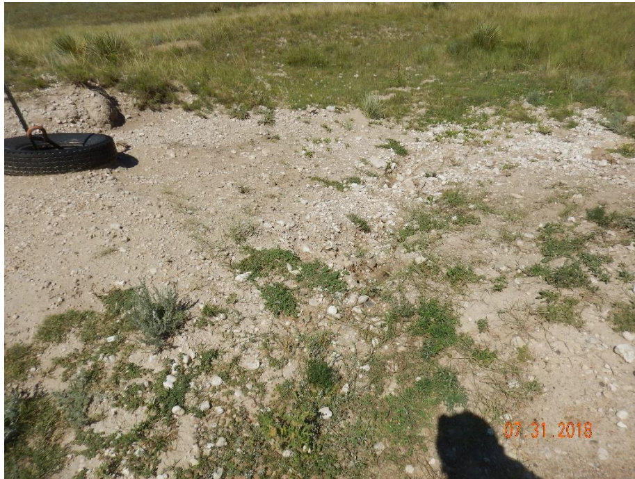
Photo 13: Photo taken from the west end of the location. Photo work appears to have been conducted to repair gulley erosion, however no stabilization controls have been implemented and erosion degradation has been allowed to continue.