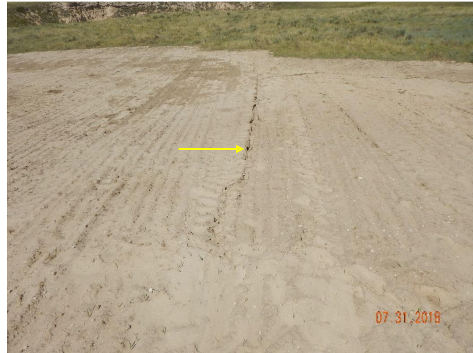
Photo 10: Photo taken from the southwest corner of the pit, facing west. Photo show interim areas of the location have been regraded and appears to have been reseeded. However, no stabilization, or stormwater and erosion control BMPs have been installed per the corrective actions. Photo show erosion degradation has been allowed to continue on the slope.