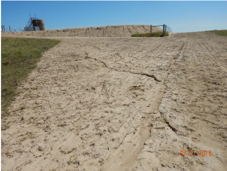
Photo 11: Photo taken from the southwest of the pit, facing northeast. See comments under photo 10.