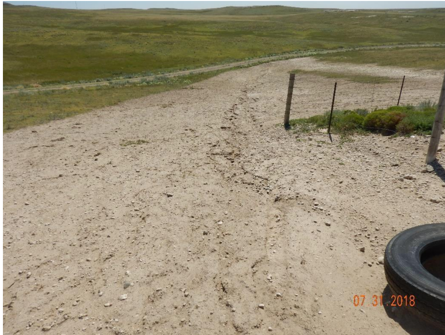
Photo 1: Photos 1-2 taken from the northeast end of the pit, facing east. Photos show interim areas of the location have been regraded and appears to have been reseeded. However, no stabilization, or stormwater and erosion control BMPs have been installed per the corrective actions. Photos show erosion degradation has been allowed to continue on the slope.