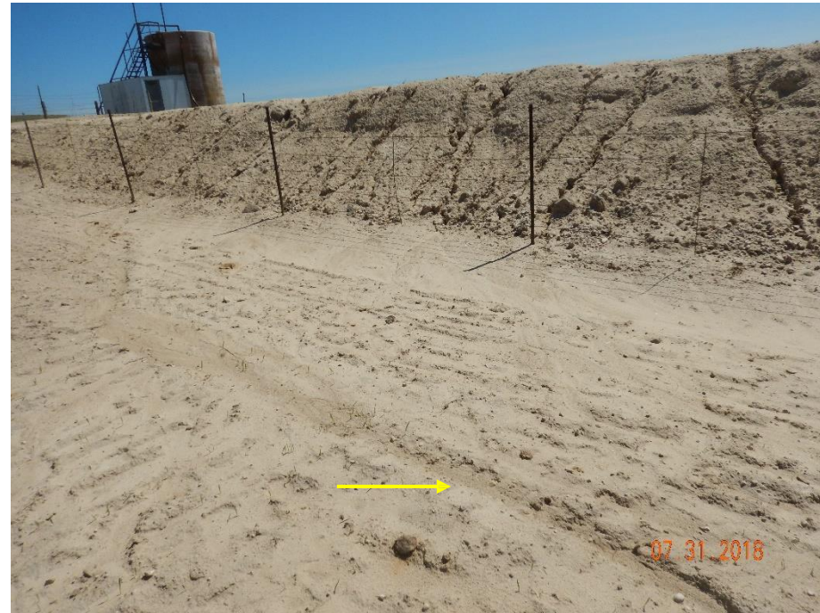
Photo 12: Photo taken from the west end of the pit, facing northeast. See comments under photo 10.