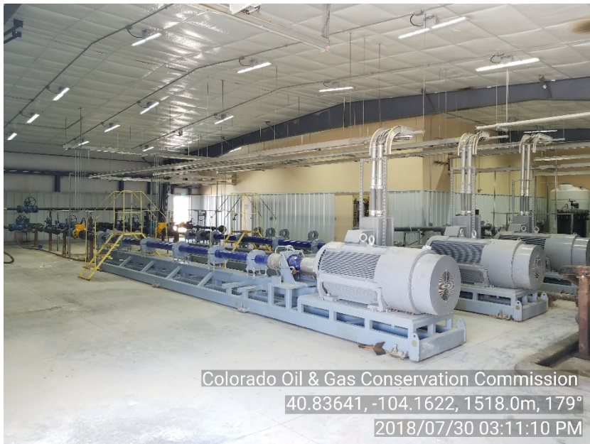
Colorado Oil & Gas Conservation Commission 40.83641, -104.1622, 1518.0m, 179° 2018/07/30 03:11:10 PM