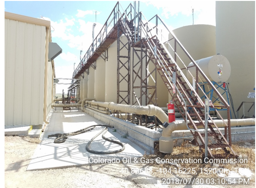
Photo #6 NGL C9B (API 05-123-40770) injection facility View 1