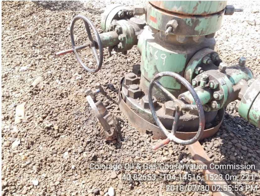
Photo #5 NGL C9B (API 05-123-40770) injection well Bradenhead