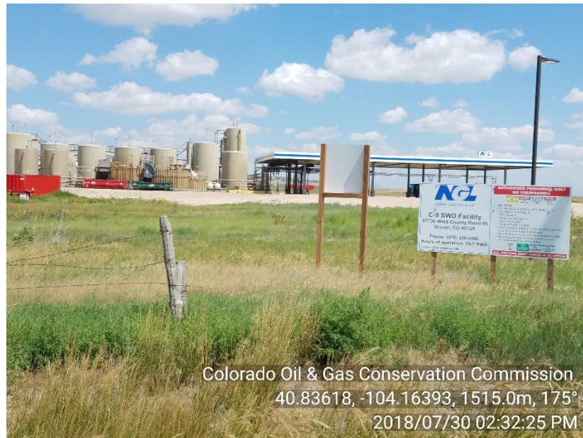
Colorado Oil & Gas Conservation Commission 40.83618, -104.16393, 1515.0m, 175° 2018/07/30 02:32:25 PM

NGL C9B (API 05-123-40770) injection facility View 2