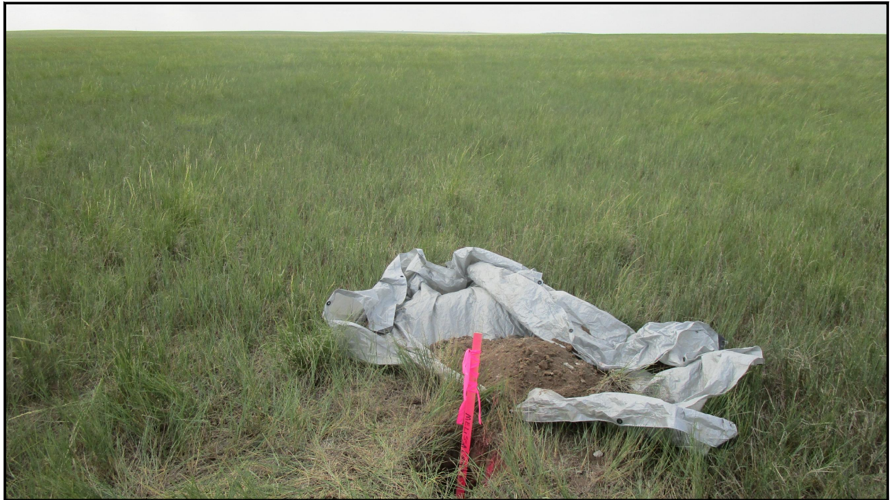
PHOTO: VIEW OF AS-DRILLED LOCATION