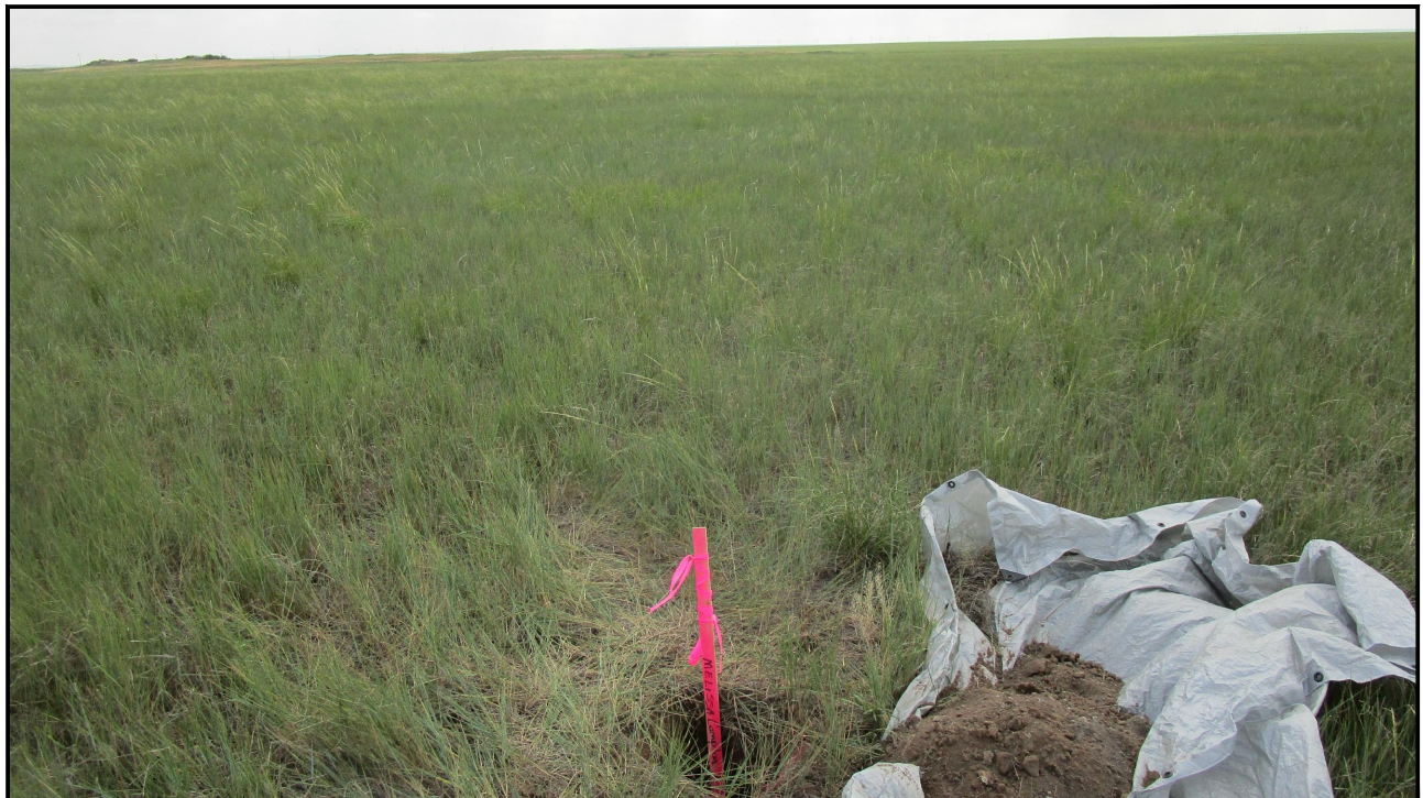
PHOTO: VIEW OF AS-DRILLED LOCATION