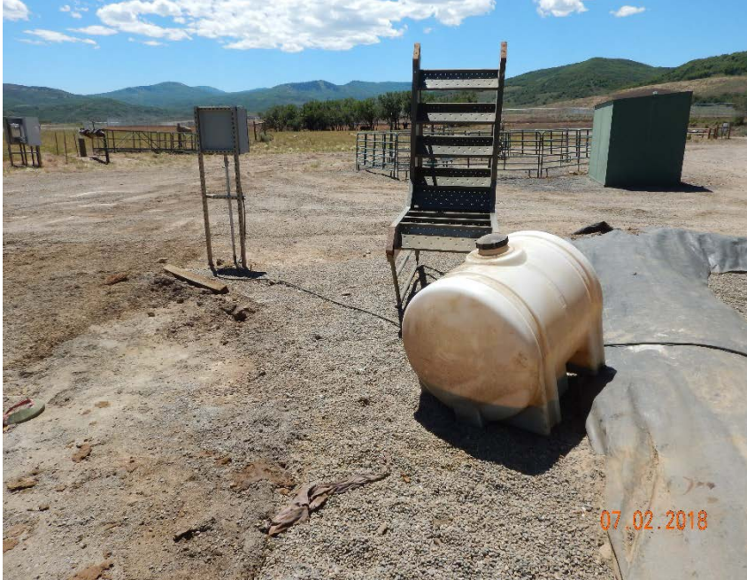
Photo #15 – Unused equipment, wood debris, and chemical storage tank lacking secondary containment device at SE corner of pump house.