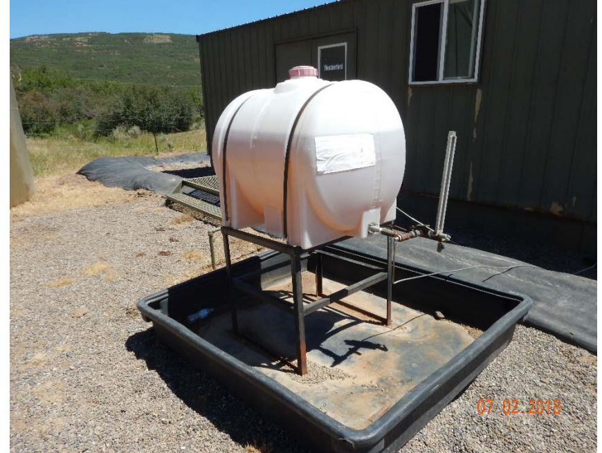
Photo #16 – Chemical storage tank with adequate secondary containment located on west side of pump house.