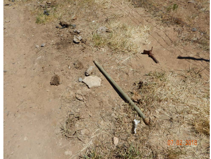
Photo #8 – Miscellaneous trash, unused equipment, and localized oil-stained soil at former produced water tank battery.