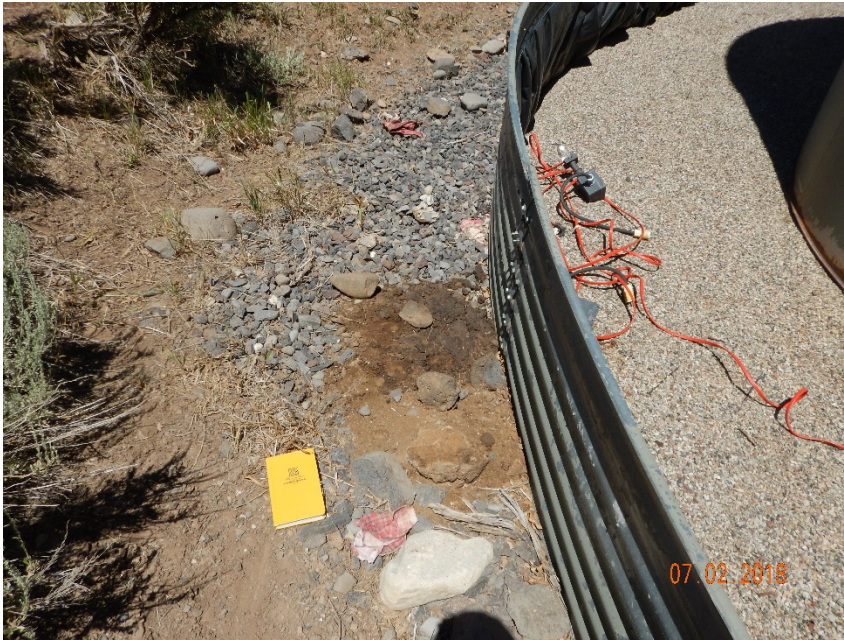
Photo #23 – Oil-stained soil outside of crude oil tank berm (south side).