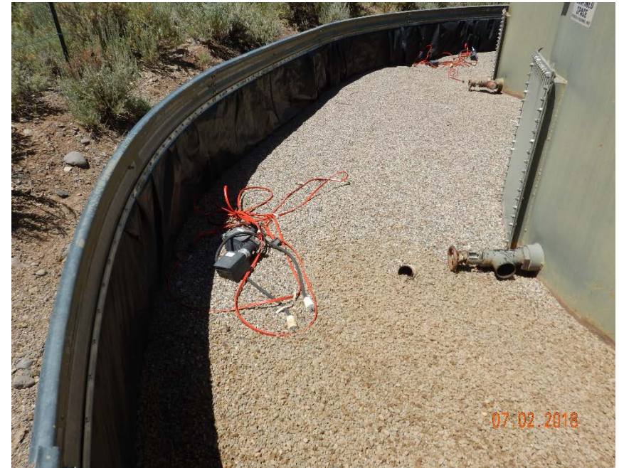
Photo #22 – Storage of unused equipment inside of condensate tank battery berm.