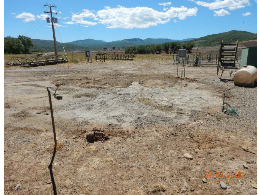
Photo #10 – Additional unused risers at former produced water tank battery.