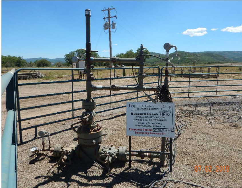
Photo #3 - Buzzard Creek 15-10 well sign. Note electrical conduit in background.