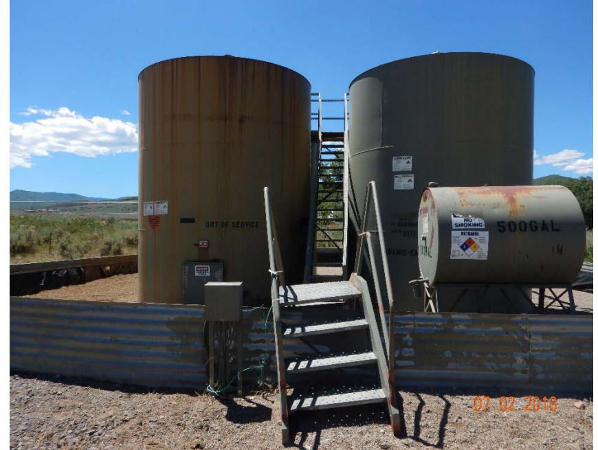
Photo #20 – View of condensate tank battery with 500 gallon methanol tank, looking south.