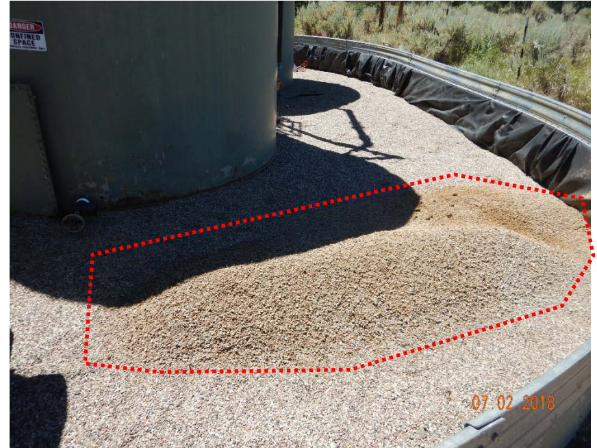
Photo #24 – Oil-stained gravel located inside of NW corner of condensate tank berm.