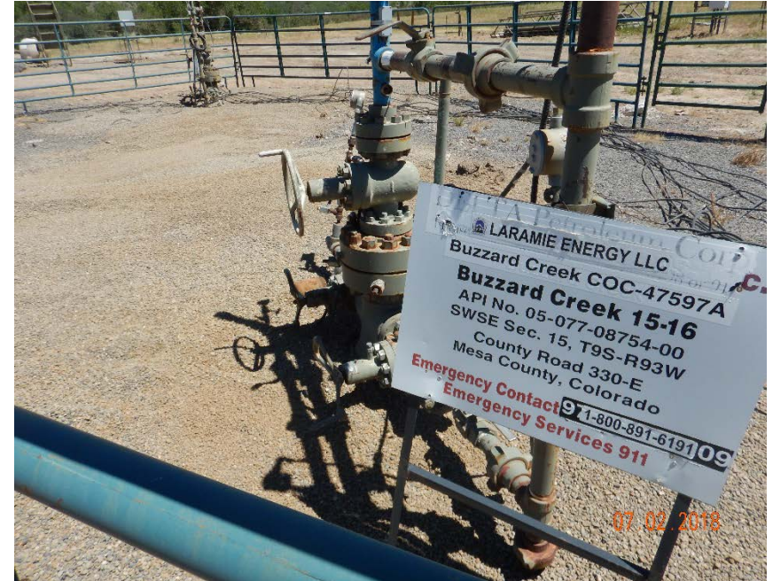
Photo #2 – Buzzard Creek 15-16 well sign. Note electrical conduit in background.