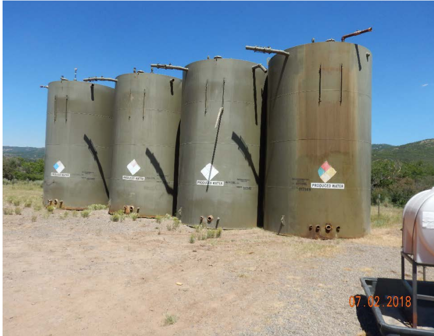
Photo #17 – Produced water tanks have been removed from battery area for subsurface investigation. Tanks are currently being stored along north end of location.