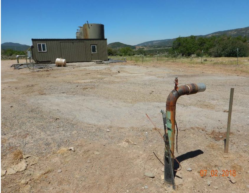
Photo #9 – Unused flowline riser at former produced water tank battery. Note pump house with chemical storage tank in background.