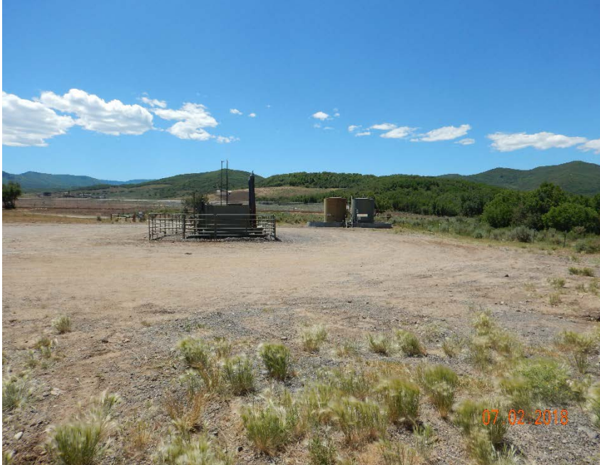
Photo #19 – View of horizontal separators and condensate tank battery, looking south.