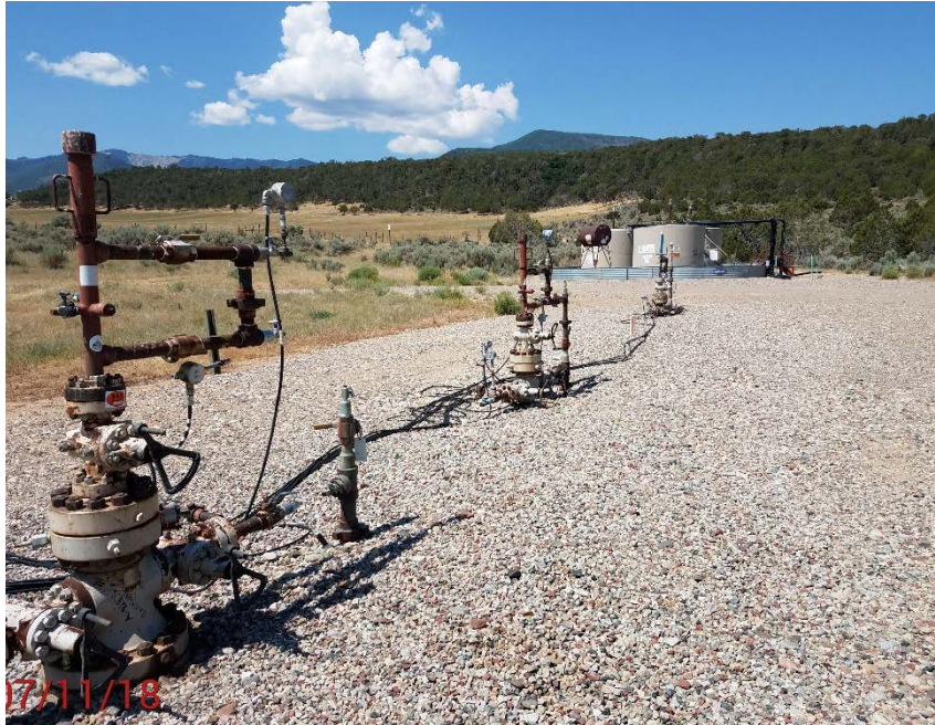
Location Photo #1