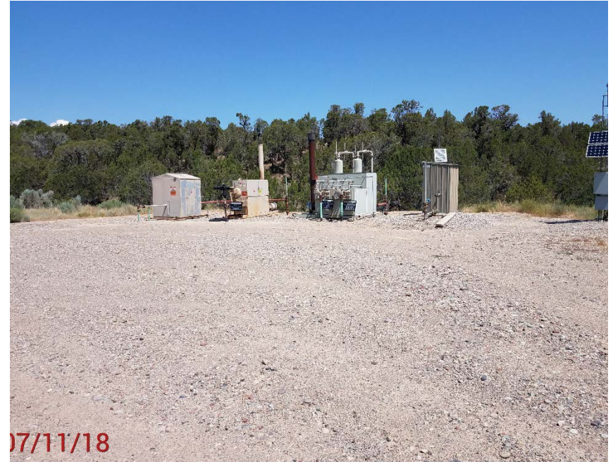
Location Photo #2