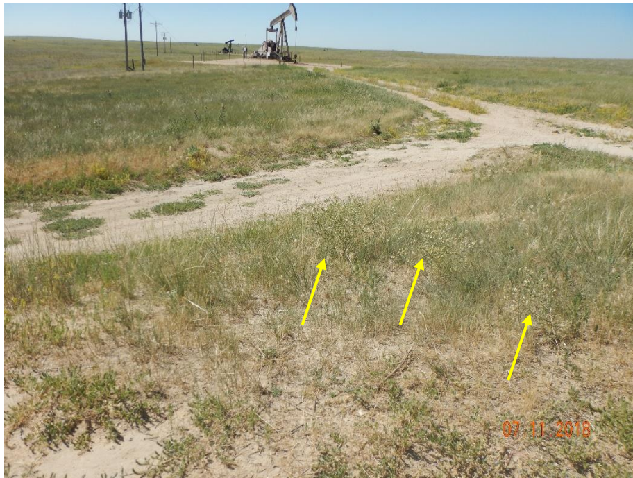
Photo 5: Photo taken from the access road, north of the location facing south. See Comments under photo 2.