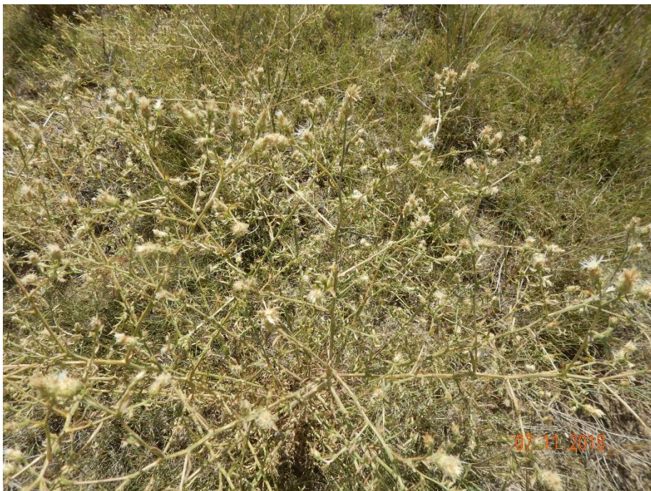
Photo 9: Close up photo of Diffuse Knapweed observed on location. Photo shows that though Diffuse Knapweed (lighter, grey-green plants, white colored flowers) appears to have been sprayed w/ herbicide, spraying does not appear to have been sufficient as plant appear to be viable and have continued to mature/flower