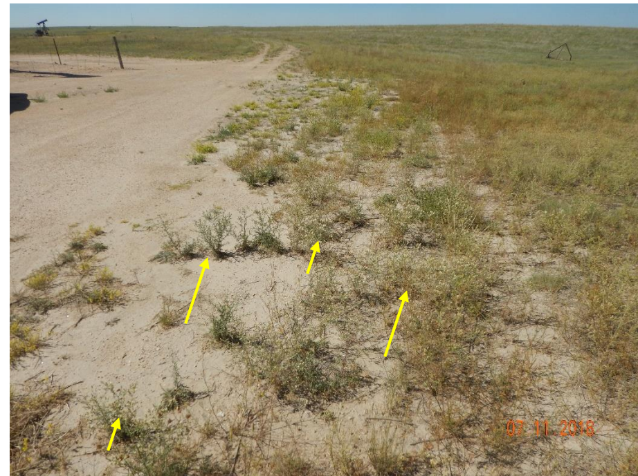
Photo 6: Photo taken from the west end of the location, facing south. See comments under photo 2.