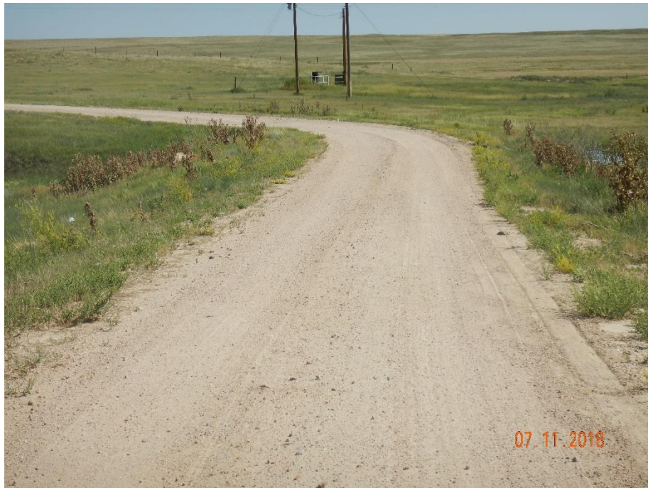
Photo 1: Photo taken from the main access road, facing north. Photo shows scotch thistle has desiccated.