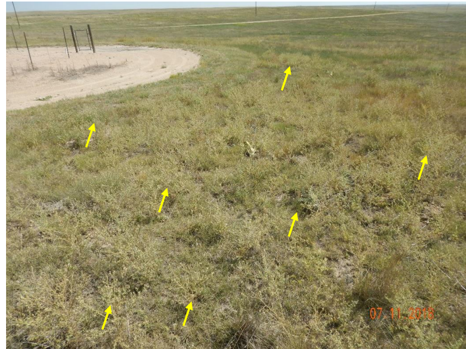
Photo 8: Photo taken from the south end of the location, facing northeast. See comments under photo 2.