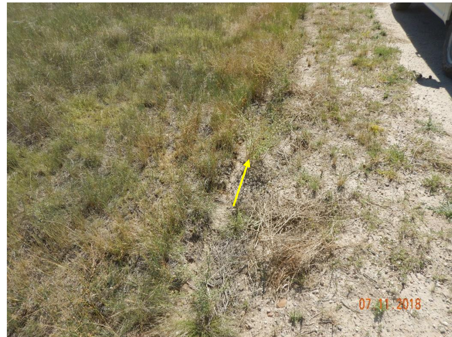
Photo 2: Photo taken from the main access road, east of the location. Previous inspection required management and removal of noxious weeds.

Photo shows Diffuse Knapweed (lighter, grey-green plants, white colored flowers) remains prevalent on location and access roads. Though there is evidence of herbicide, spraying does not appear to have been sufficient as many plants appear to be viable and have continued to mature/flower