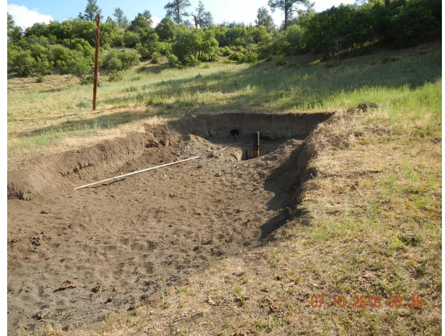
Fitzhugh #7 open excavation.