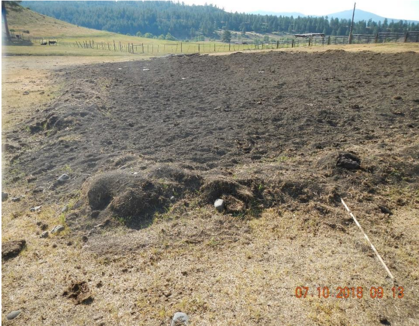
Northwest corner of land farm treatment cell.