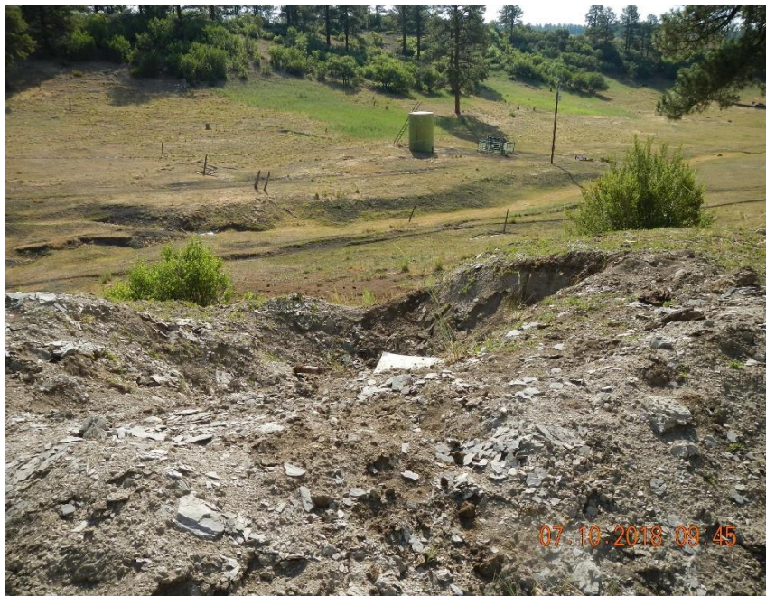
PA marker for Fitzhugh #15 and abandoned flow line. Fitzhugh #6 in the background.