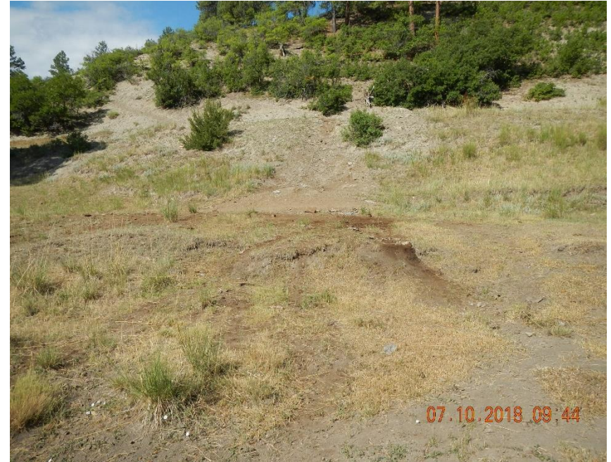
Oil staining downhill of the Fitzhugh #15.