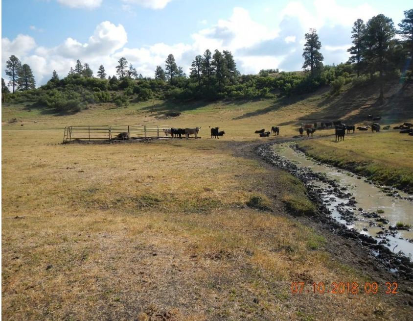
Fitzhugh #11 open excavation (behind stock panels).