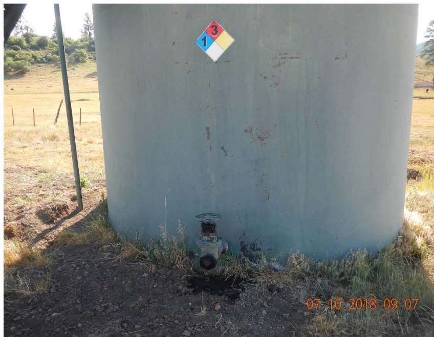
Stained soil beneath load out valve on AST.