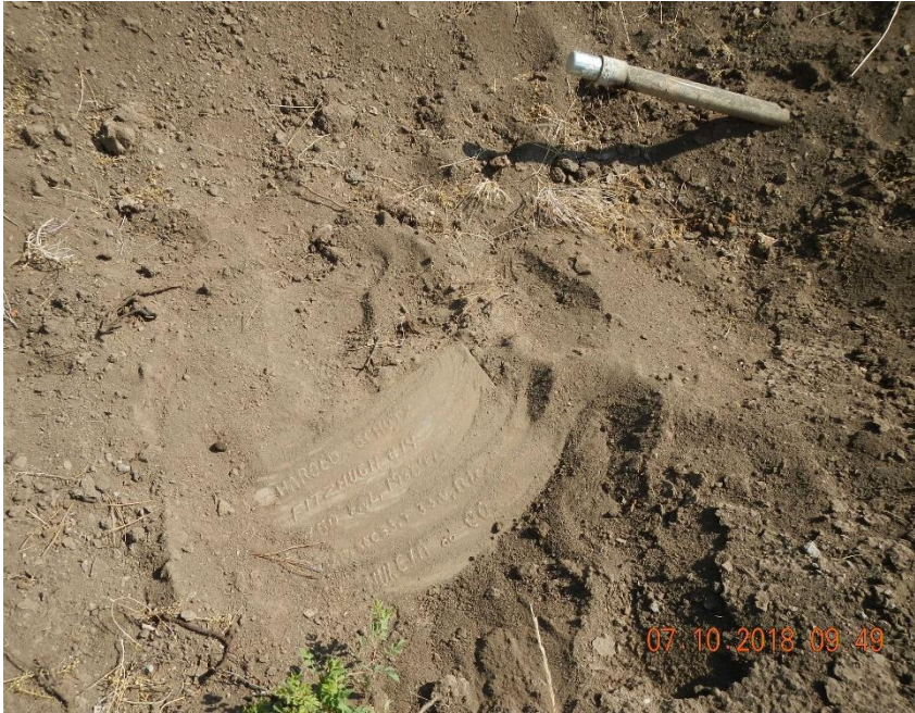
PA marker for Fitzhugh #14 and abandoned flow line.