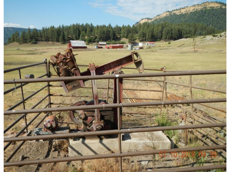
TA domestic gas supply well.