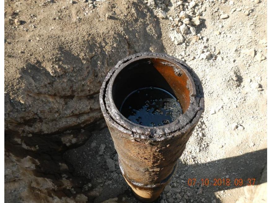
Fitzhugh #7 casing with fluids.