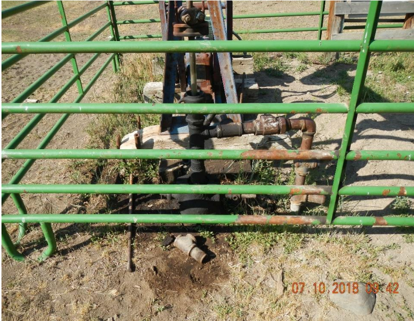
Oil stained soil and well head at the Fitzhugh #6.