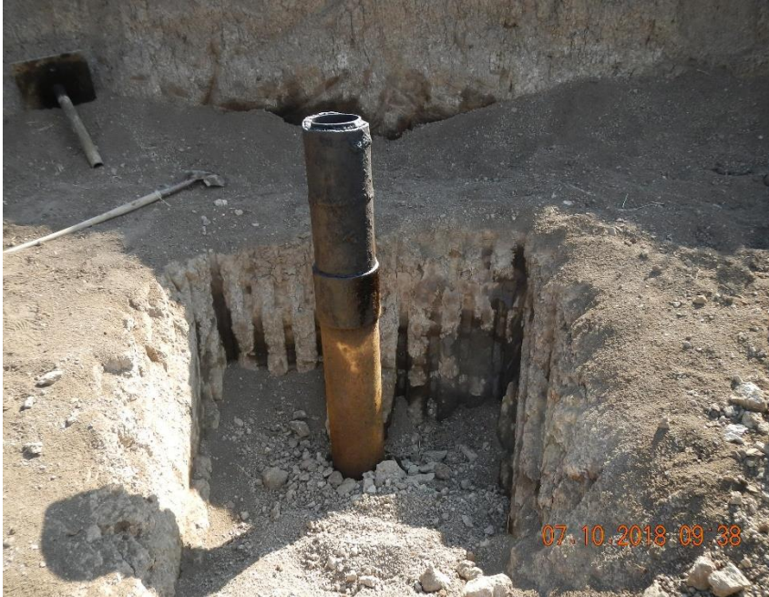
Fitzhugh #7 with oil stained soil.