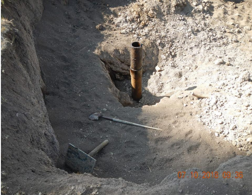
Fitzhugh #7 PA marker and well casing.