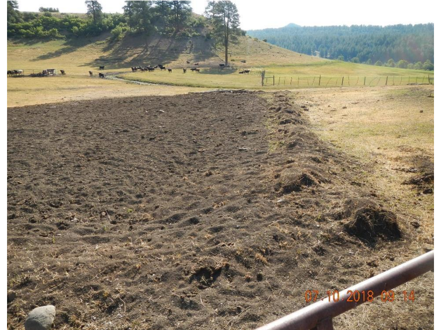
Southern edge of treatment cell.