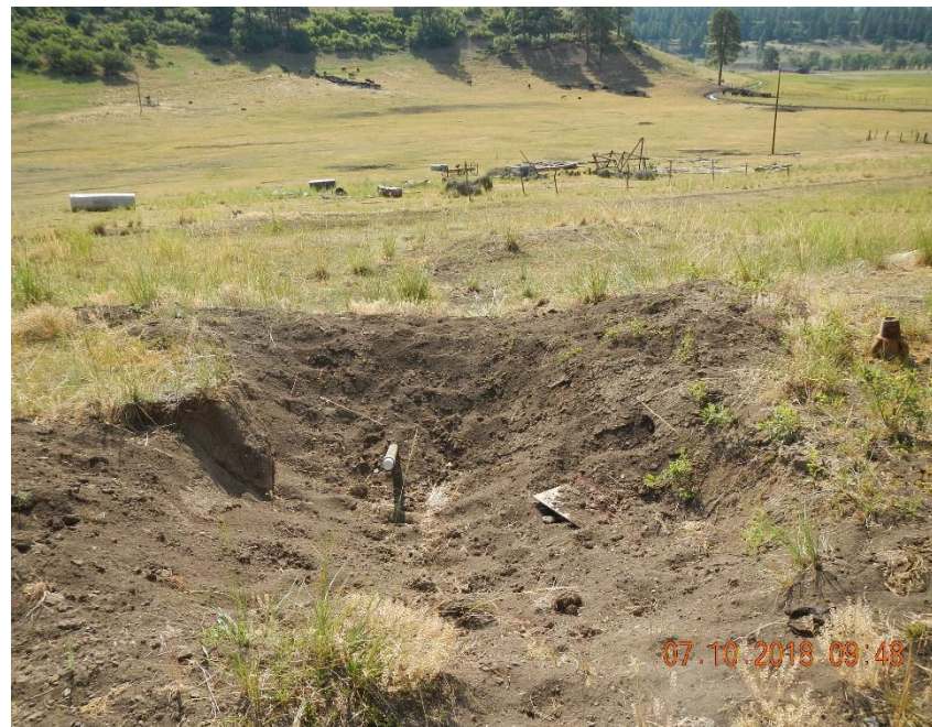
Fitzhugh #14 PA marker and abandoned flow line.