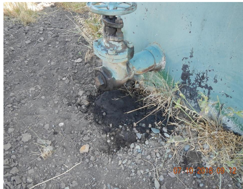
Close up view of oil stained soil.