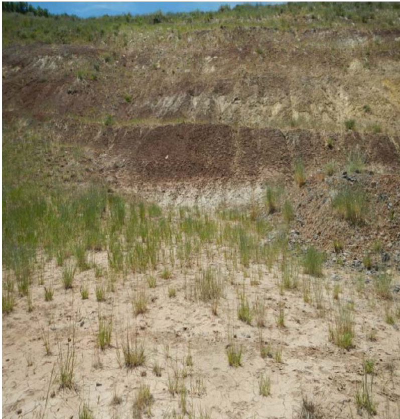
Photo#2: Erosion of Cut slopes and Sediment Run on to Location is still occurring.