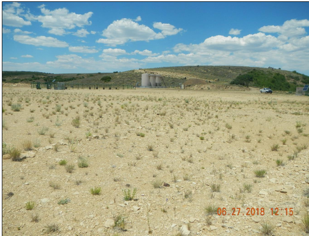
Weeds covering location.

596-19C-28 Api # 05-045-16066 Inspection # 689701535