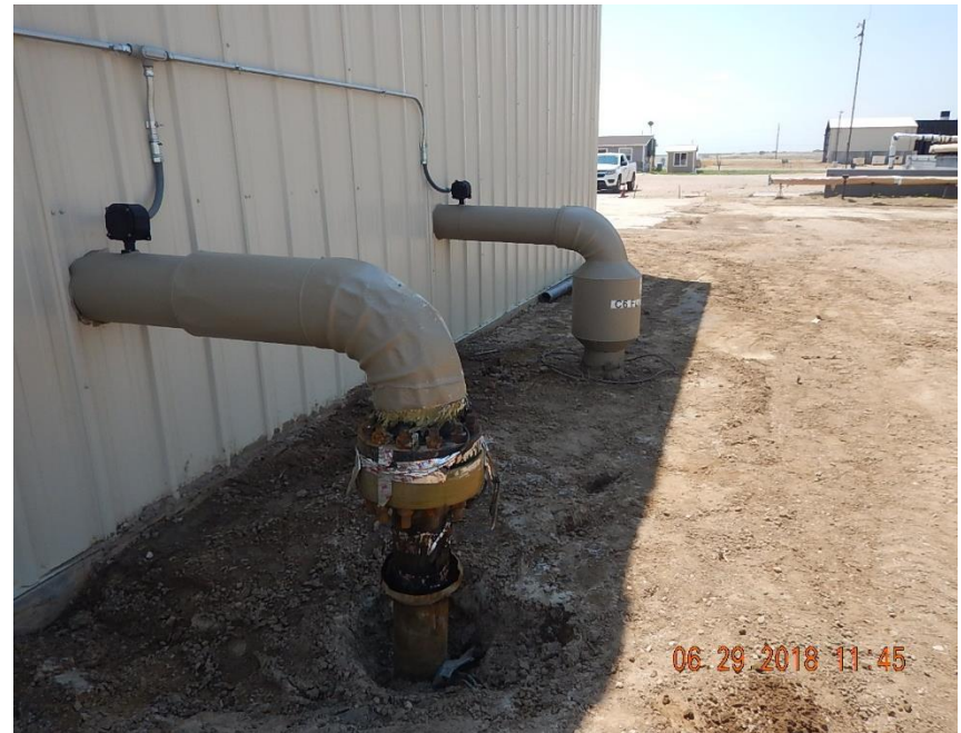
View of both the C6 and C6A produced water injection flowlines at the discharge of the injection pumps.