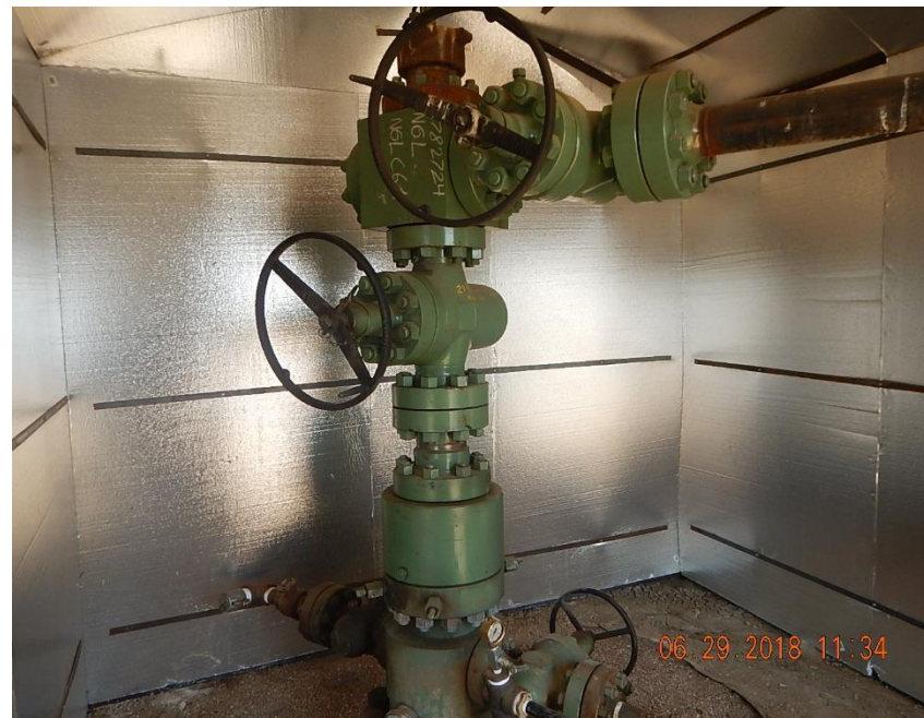
View of wellhead tree in building