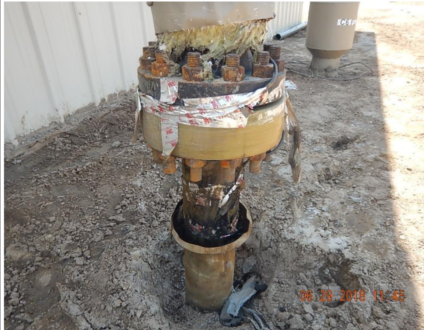
Failed C6A flange connection resulting in spill; at west end of pump building; insulation removed