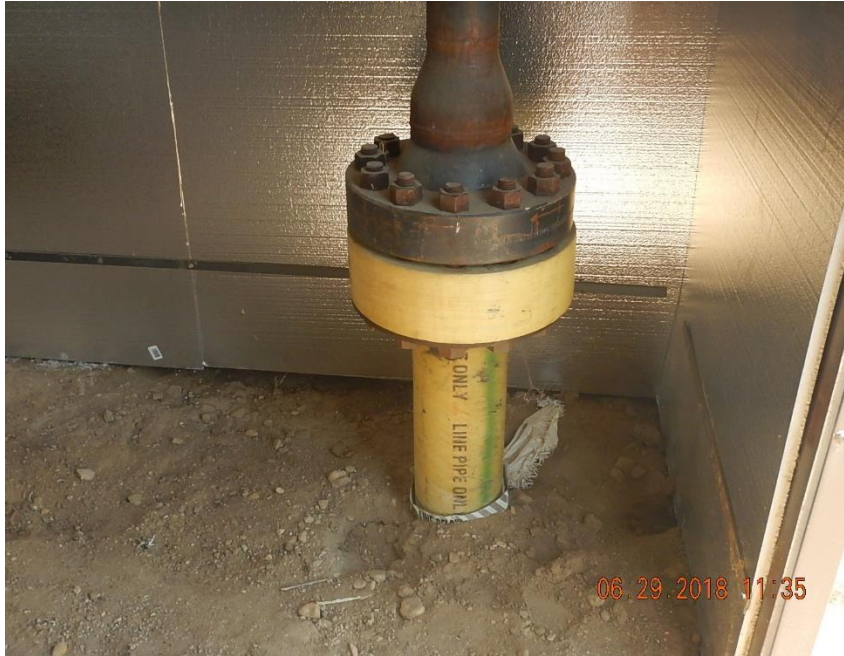
Photo of flanged connection at wellhead (this connection did not fail)