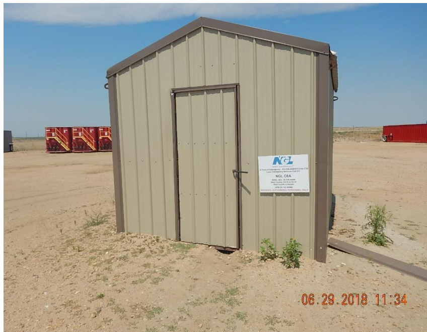
Signage and wellhead housing (looking west)