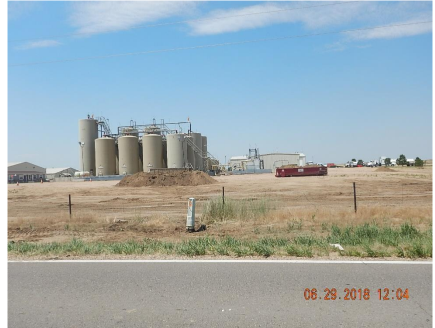
View of NGL C6A facility and battery looking west; note the impacted soils being remediated at west end of location.