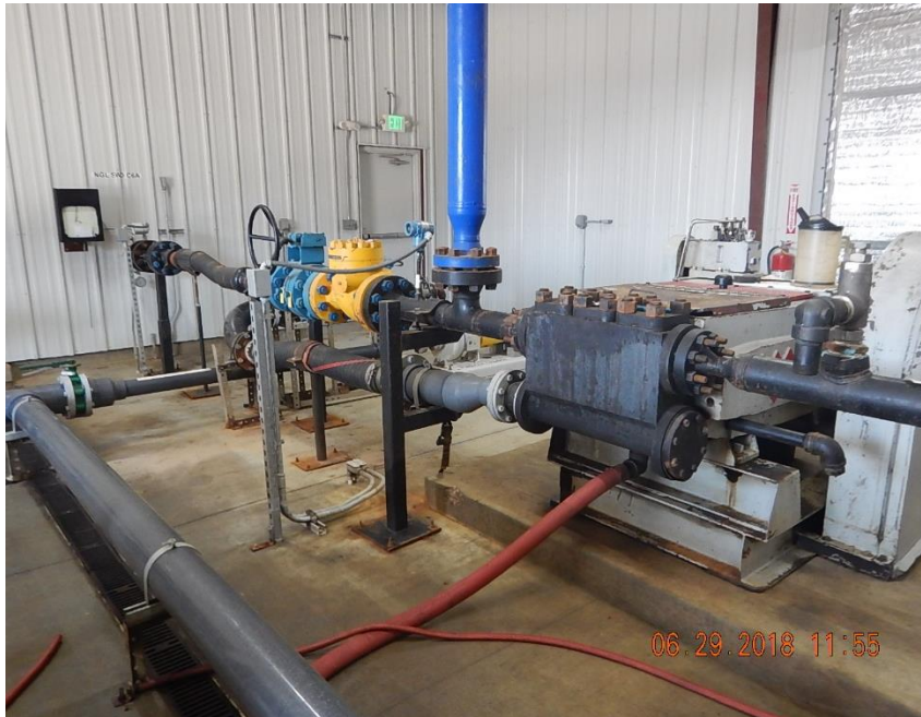
Photo of the C6A injection pump flowline tie in - inside pump building