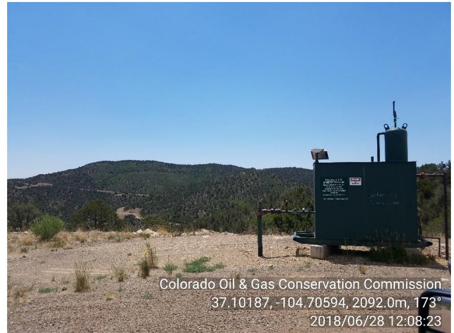
Photo 2. Location sign