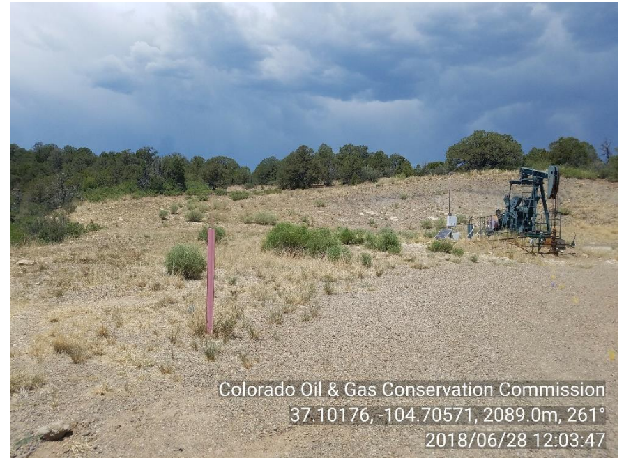
Photo 2. weeds