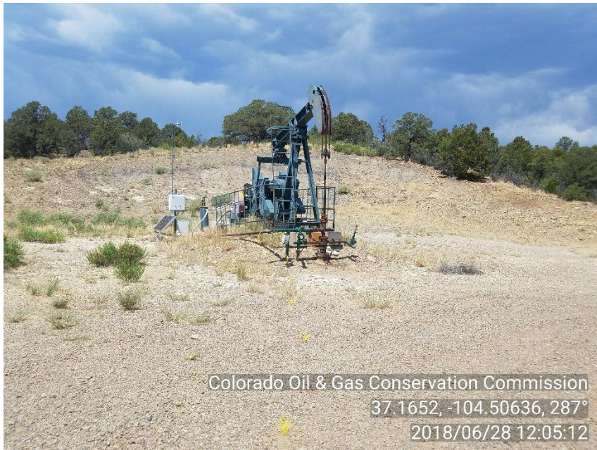
Photo 1. Wellhead