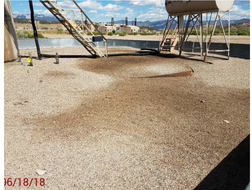
Location Photo #4, Stained rock in tank containment