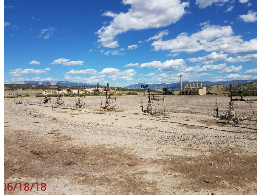
Location Photo #1