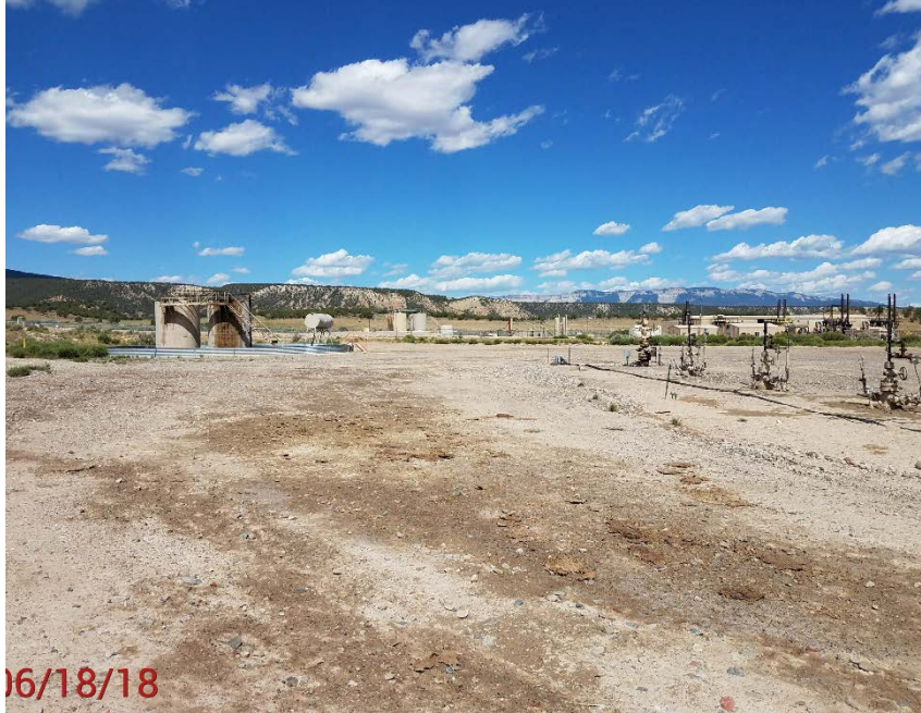
Location Photo #1