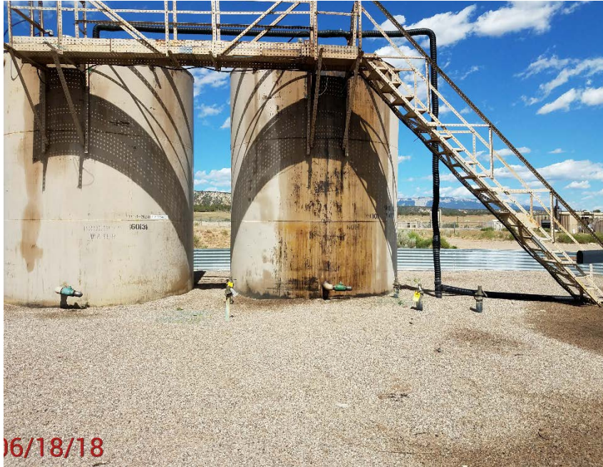
Location Photo #3, Oily residue on outside of tank