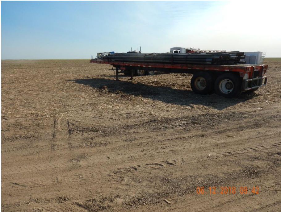
Photo 1: Photo taken from the west end of the location, facing northeast. Photos 1-3 provide an overview of the location from northeast, east, to south. Photos show that the pit on the south end of the location appears to be the only area of the location where topsoil has been salvaged. Photos show operator has not salvaged topsoil from the remaining Oil and Gas location during construction operations; various equipment, including the drilling rig, have been set up, and have operated directly upon the surface of the topsoil.