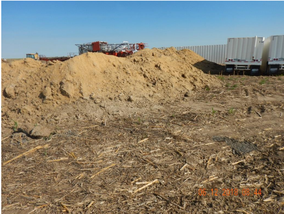
Photo 7: Photo taken from the southeast end of the location, facing north. See comments under photo 4.