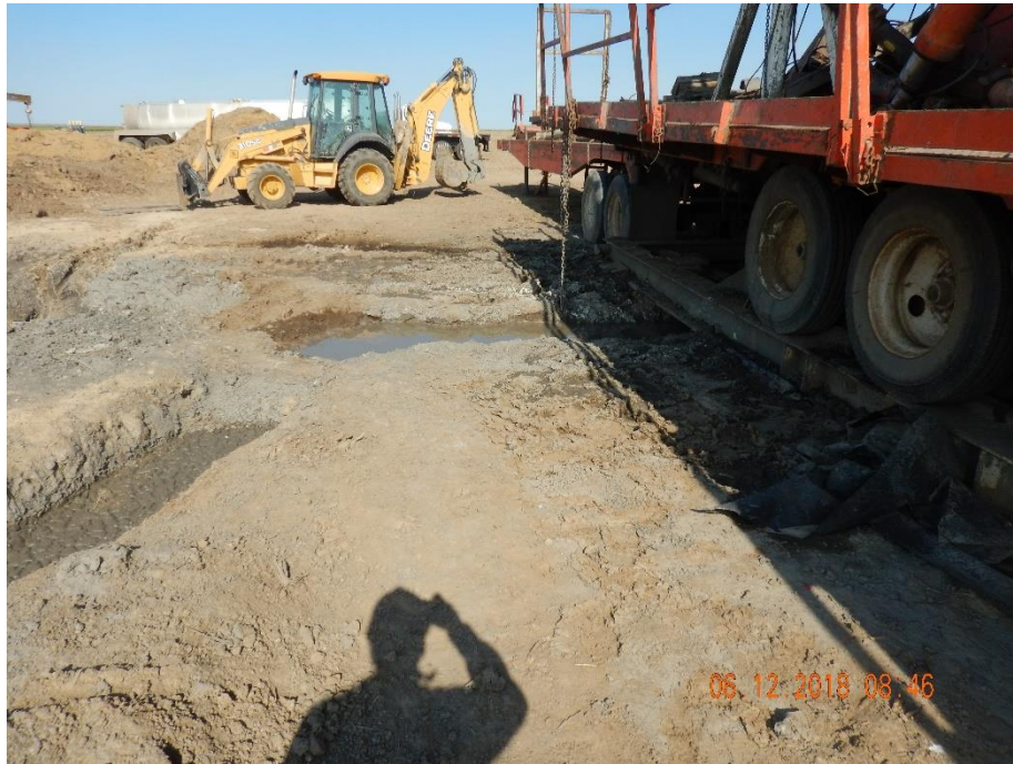
Photo 13: Photo taken at from the southern side of the drill rig. Photo shows areas where what appears to be drilling mud and various other chemical contaminants have spilled on the topsoil of the location.