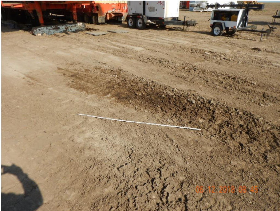
Photo 11: Photo taken from the eastern side of where the drill rig sits. Photo shows areas where stained and/or contaminated soil from various spills or drips were observed on the topsoil of the location. 6 foot measuring stick for reference. This is not protective of topsoil in accordance to 1001.a