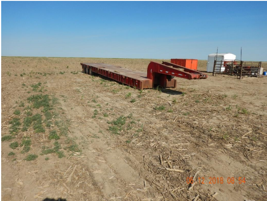
Photo 23: Photo taken from the southeast end of the State 11-16 well (121-10990). Photo shows operator has stored various equipment for the location being constructed at this site. Disturbances created at this location will need to be reclaimed.