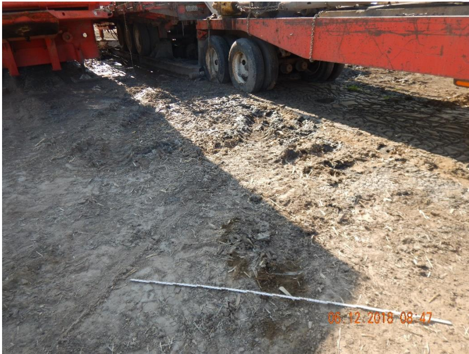
Photo 15: Photo taken from the west end of the drill rig. Photo shows areas where what appears to be drilling mud and various other chemical contaminants have spilled on the topsoil of the location.