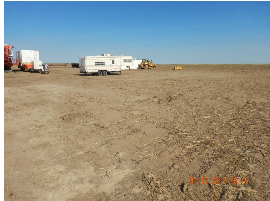
Photo 10: P Photo taken from the east end of the location, facing north. See comments under photo 1.