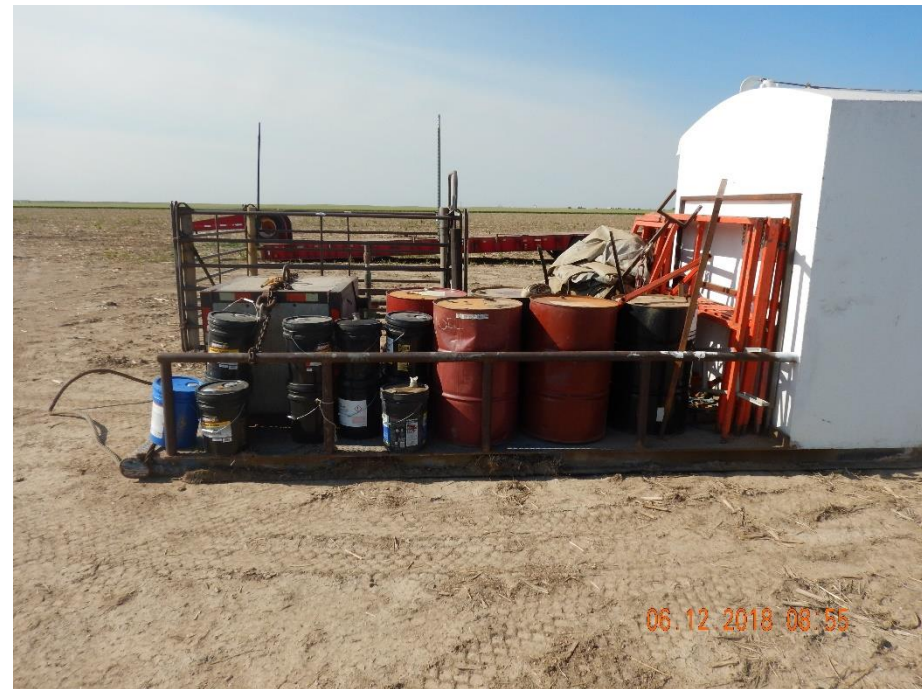
Photo 24: Photo taken from the northern end of the State 11-16 well (121-10990). Photo shows operator has stored various equipment for the location being constructed at this site. Disturbances created at this location will need to be reclaimed.