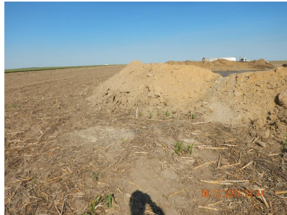
Photo 6: Photo taken from the southeast end of the location, facing west. See comments under photo 4.