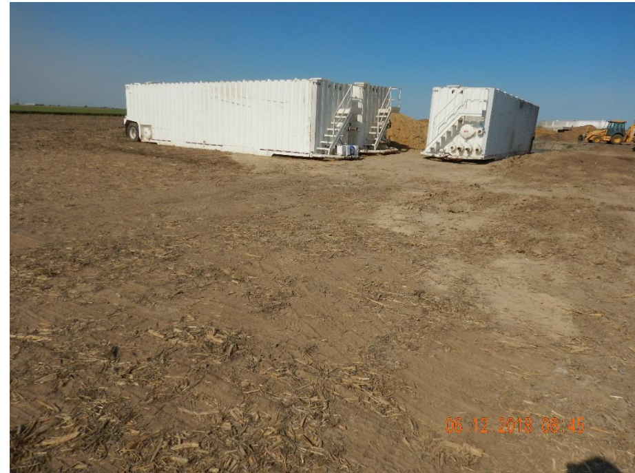
Photo 8: Photo taken from the east end of the location, facing southwest. Photos 8-10 provide an overview of the location from southwest, west, to north. Photos show that the pit on the south end of the location appears to be the only area of the location where topsoil has been salvaged. Photos show operator has not salvaged topsoil from the remaining Oil and Gas location during construction operations; various equipment, including the drilling rig, have been set up, and have operated directly upon the surface of the topsoil.