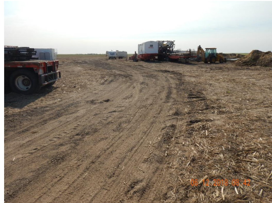
Photo 2: Photo taken from the west end of the location, facing east. See comments under photo 1.