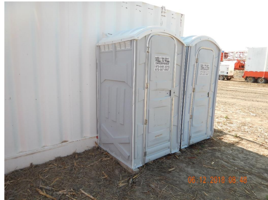
Photo 16: Photo taken from the northern end of the location. Photo of two (2) portable toilets on location. Photo shows portable toilets have not been staked down, or secured in accordance to best management practices.