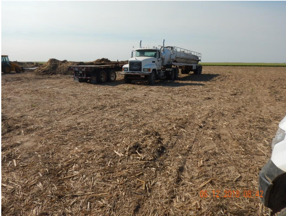
Photo 3: Photo taken from the west end of the location, facing south. See comments under photo 1.