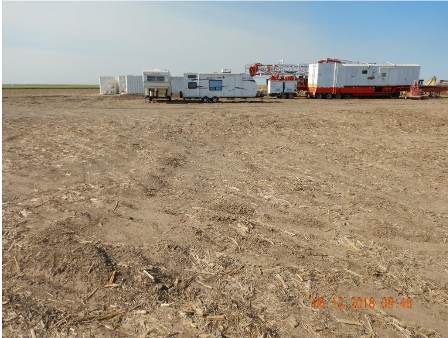
Photo 17: Photo taken from the north end of the location, facing south. See comments under photo 8.