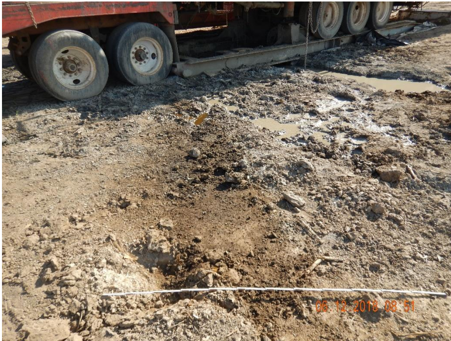
Photo 19: Photo taken at from the southwest end of the drill rig. Photo shows areas where what appears to be drilling mud and various other chemical contaminants have spilled on the topsoil of the location. 6 foot measuring stick for reference.