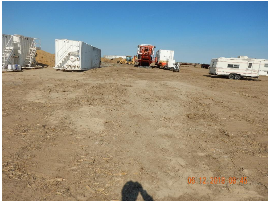
Photo 9: Photo taken from the east end of the location, facing west. See comments under photo 1.