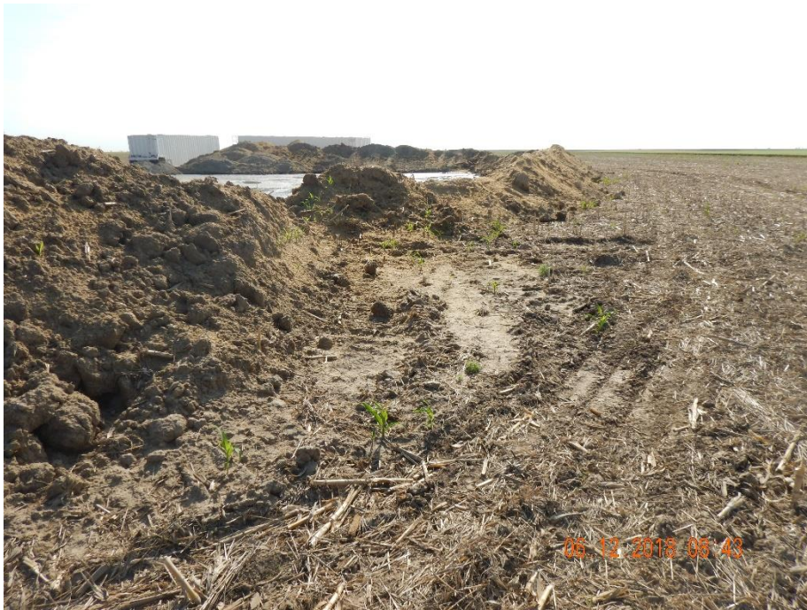
Photo 5: Photo taken from the southwest end of the location, facing east. See comments under photo 4.