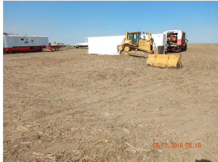
Photo 18: Photo taken from the north end of the location, facing southwest. See comments under photo 8.