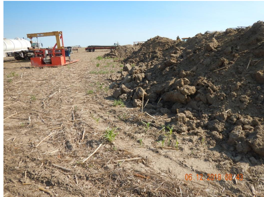
Photo 4: Photo taken from the southwest end of the location, facing north. Photo shows no perimeter stormwater controls have been installed. A tackifier appears to have been applied to the berms at the pit.