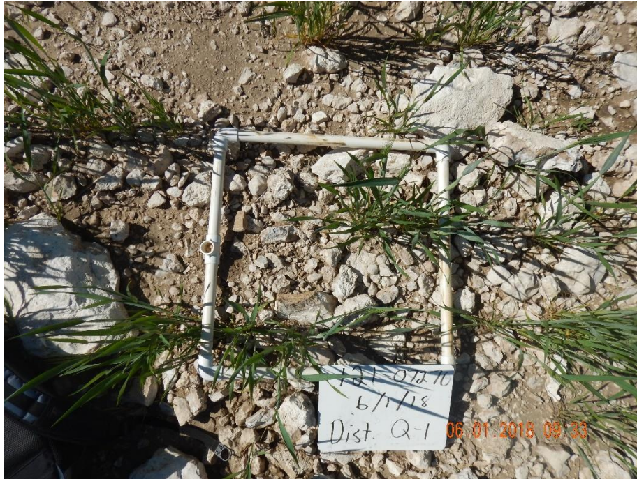
Photo 5: Photo taken from the location. Photo shows disturbance quadrat #1 and crop establishment over the disturbance area (location). Refer to data sheet.