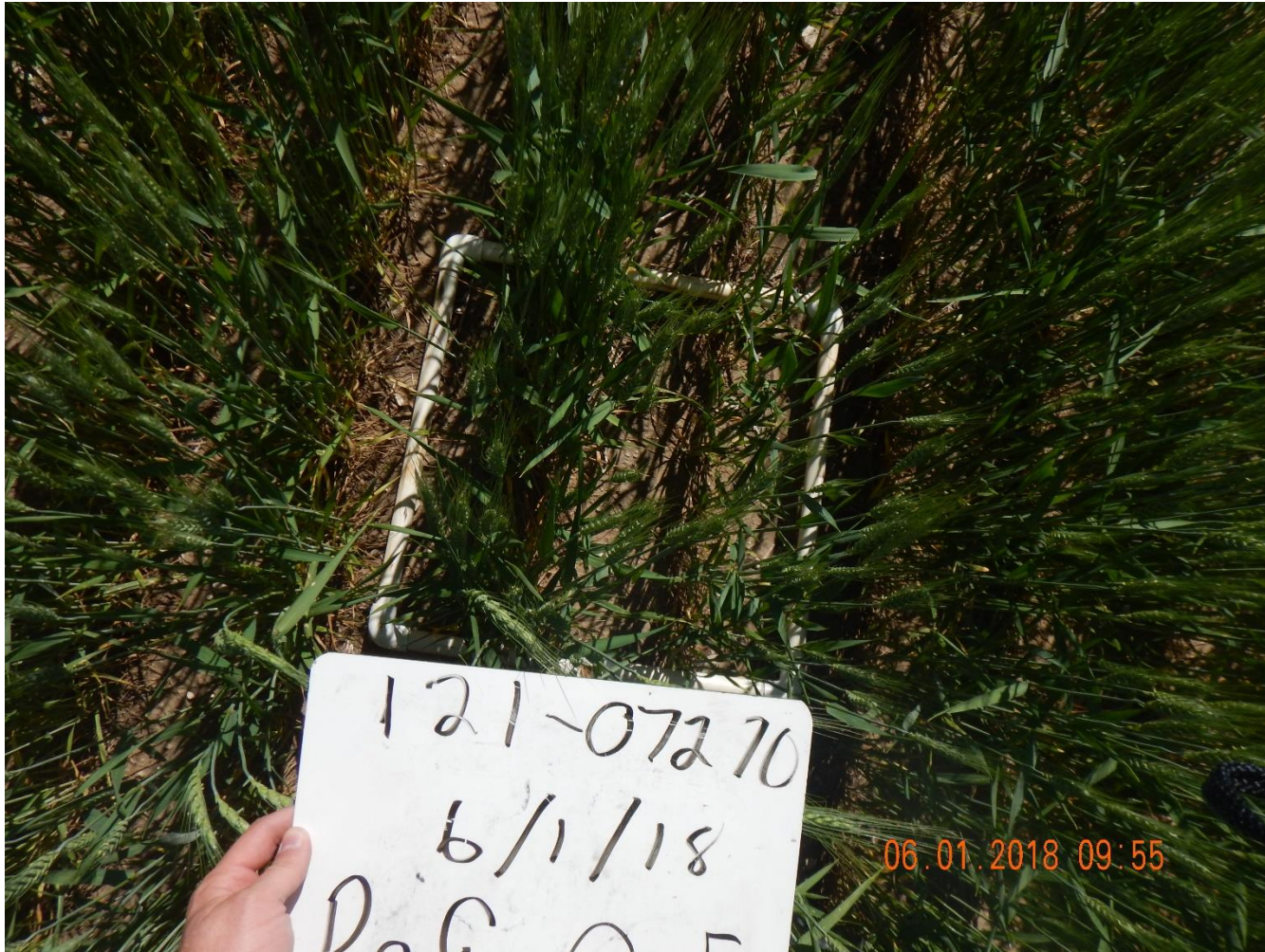
Photo 13: Photo taken from the reference area. Photo shows reference area, quadrat #5, and crop establishment over the reference area. Refer to data sheet.