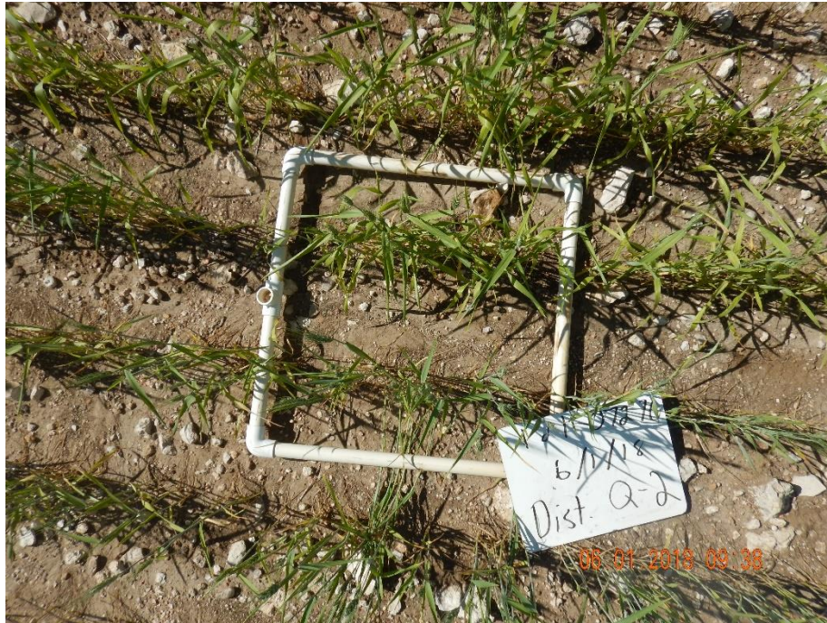
Photo 7: Photo taken from the location. Photo shows disturbance quadrat #2 and crop establishment over the disturbance area (location). Refer to data sheet