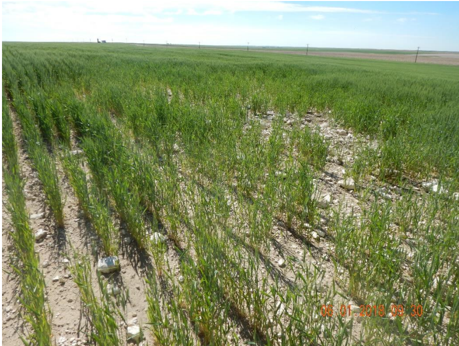
Photo 1: Photo taken from the central area of the location, facing east. Photo shows crop over the reclamation area appears stunted compare to crop on the reference (see photos 10-13); vegetation establishment on the location does not appear to be uniform/reflective of the reference area.