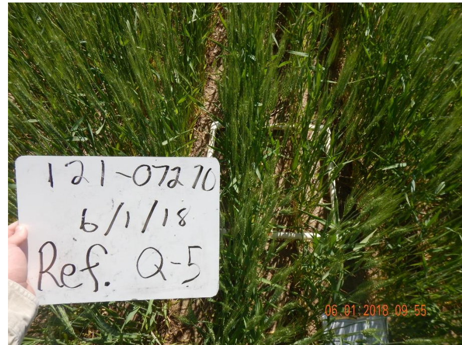
Photo 12: Photo taken from the reference area. Photo shows reference area, quadrat #5, and crop establishment over the reference area. Refer to data sheet.