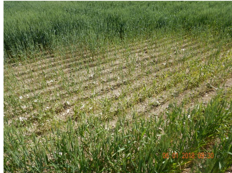
Photo 2: Photo taken from the location. See comments under photo 1.