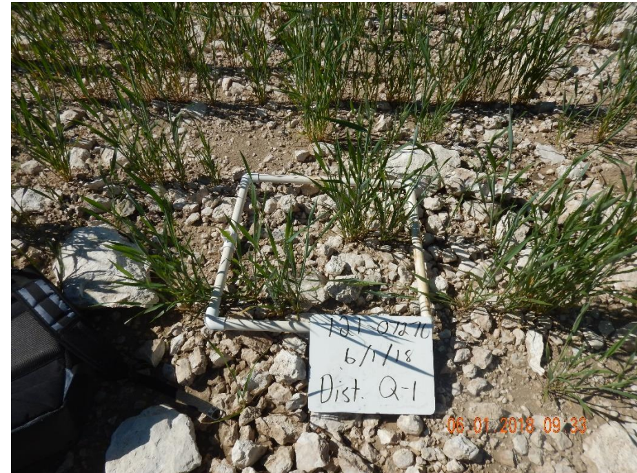
Photo 4: Photo taken from the location. Photo shows disturbance quadrat #1 and crop establishment over the disturbance area (location). Refer to data sheet.