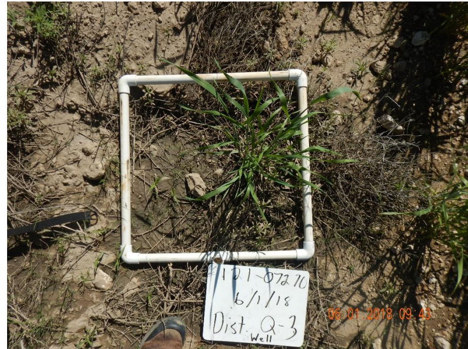
Photo 8: Photo taken from the well location. Photo shows disturbance quadrat #3 and crop establishment over the disturbance area (well). Refer to data sheet