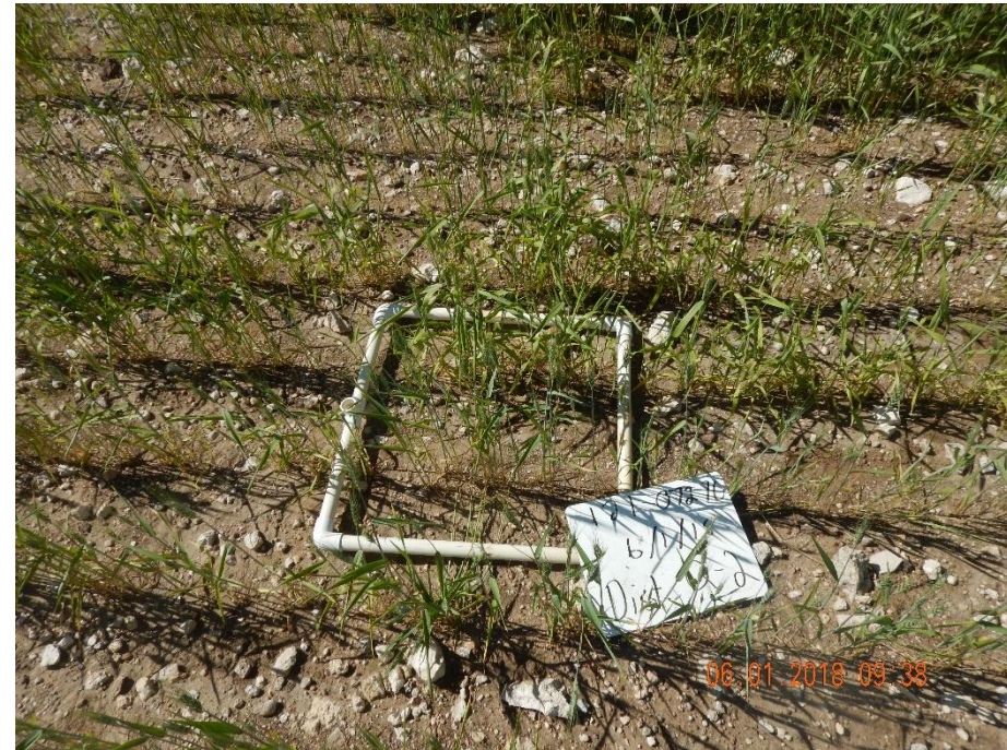
Photo 6: Photo taken from the location. Photo shows disturbance quadrat #2 and crop establishment over the disturbance area (location). Refer to data sheet.