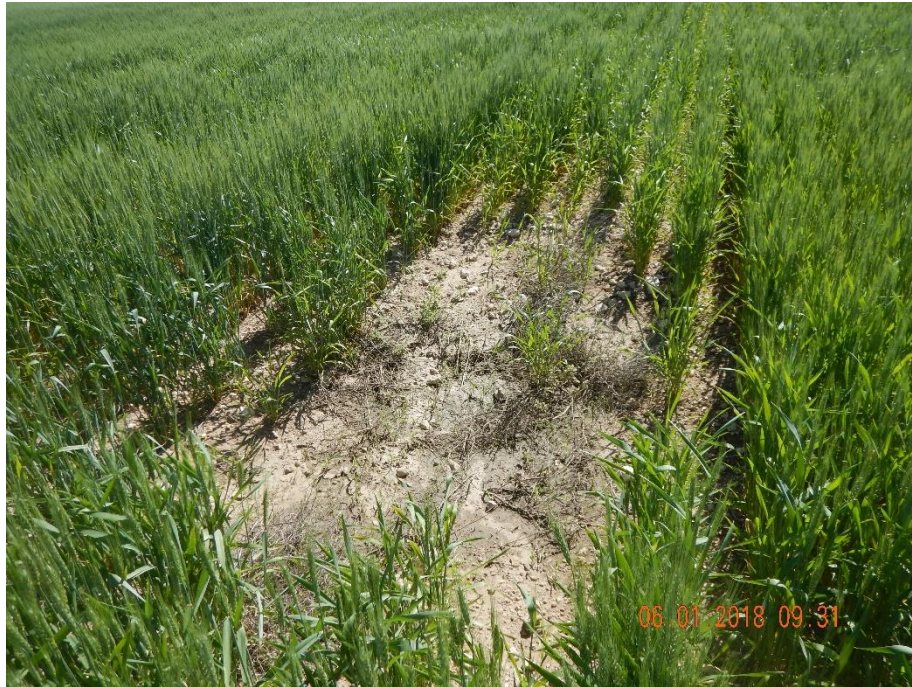
Photo 3: Photo taken from the well location. Photo shows vegetation at the well has failed to establish uniformly. Subsidence also evident at the well.