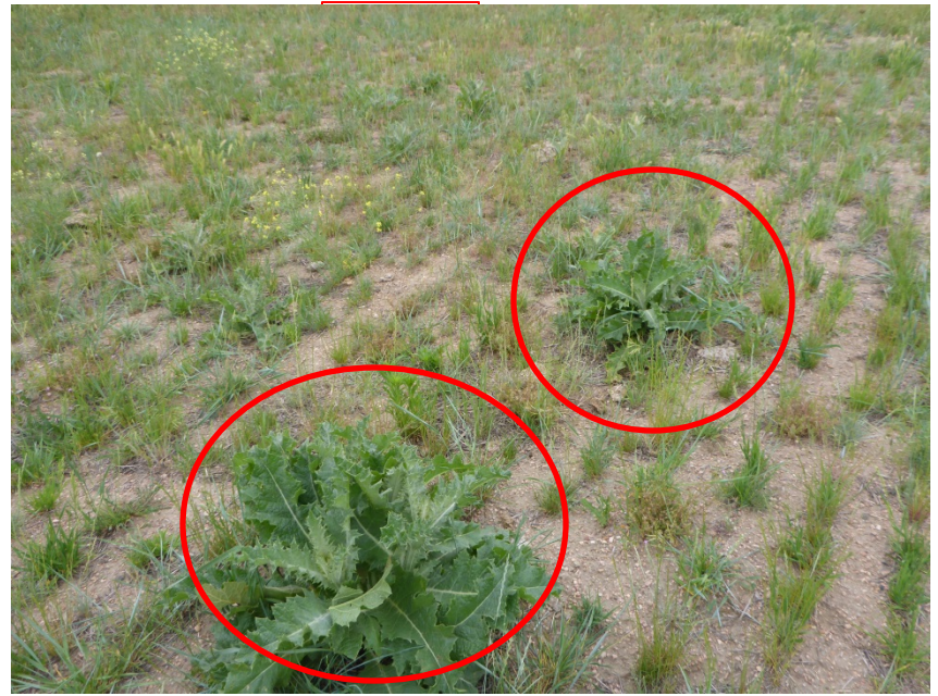
Photo 6. Photo taken within disturbance area. A List B Colorado Noxious weed species, Scotch thistle ( Onopordum acanthium ), is found at low densities.