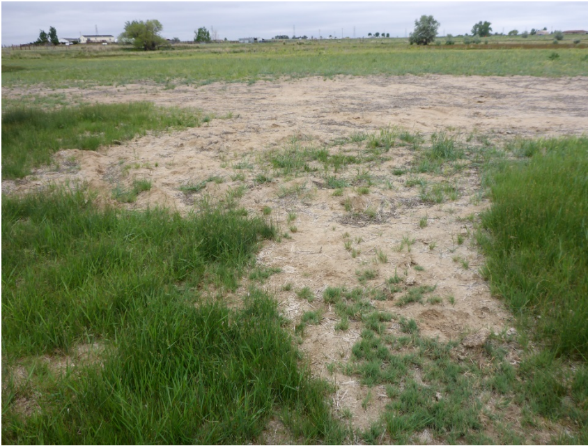
Photo 3. Photo taken from the location, facing North showing a barren patch of the disturbance area where reclamation has failed. See comments under Photo 1.