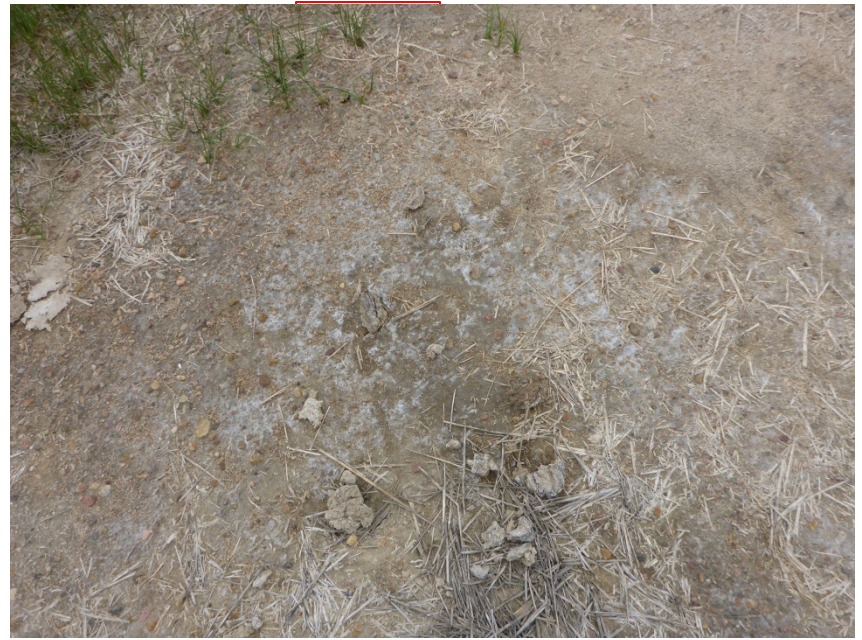
Photo 4. Photo taken along North edge of disturbance area showing the barren ground and potential salt issues.