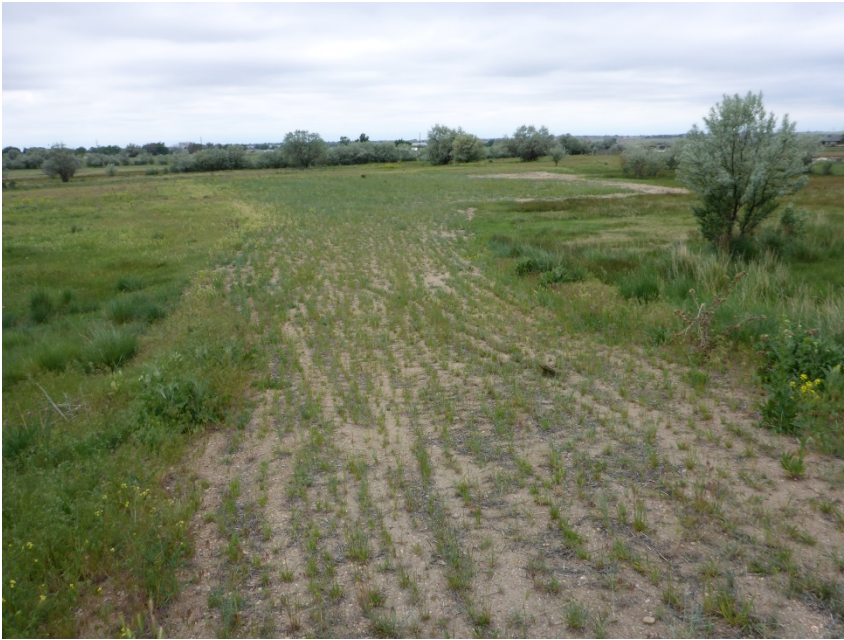
Photo 1. Photo taken from the location entrance, facing West. Appears the Operator has performed final reclamation activities, with the evidence of drilling rows, straw crimped mulch, and perennial grass starting to come in.