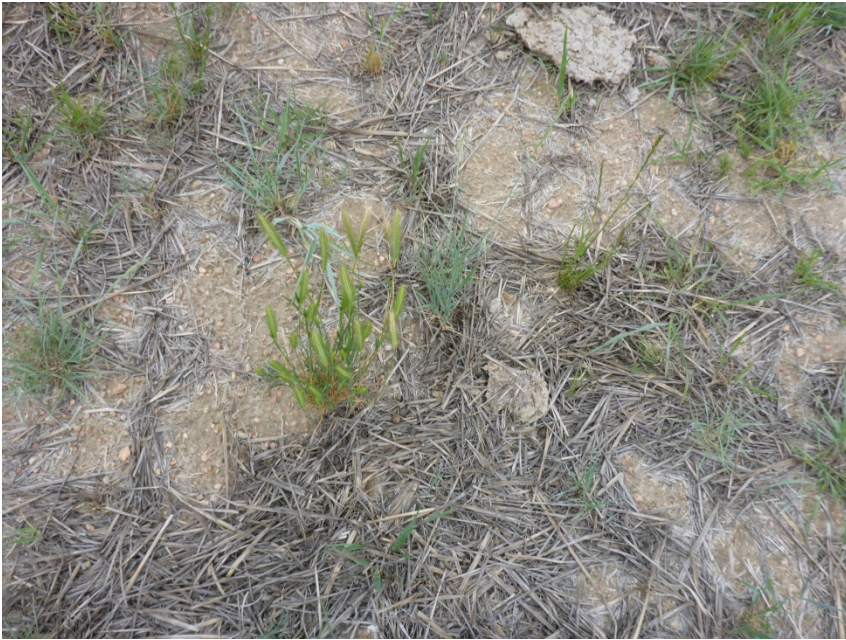
Photo 5. Photo taken from the location. See comments under Photo 1.