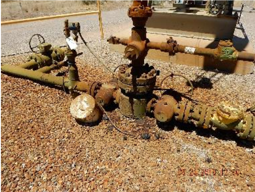
Photo 9: Closer view of impacted soil and gravel around 1B wellhead.