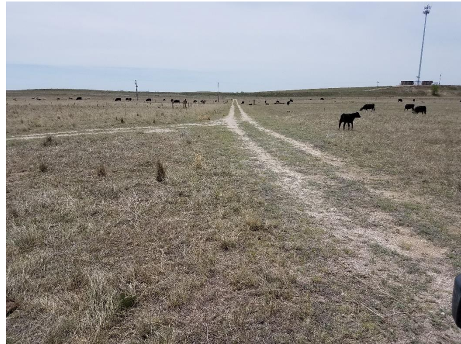
Photo 2: Photo taken from the north end of the location, facing south. Photo shows access road remaining.