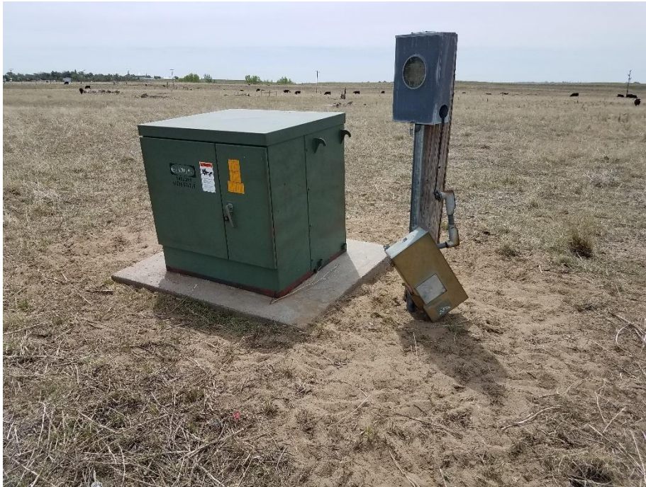
Photo 1: Photo taken from the north end of the well location, facing south. Photo shows utility equipment related to the well remains on location.