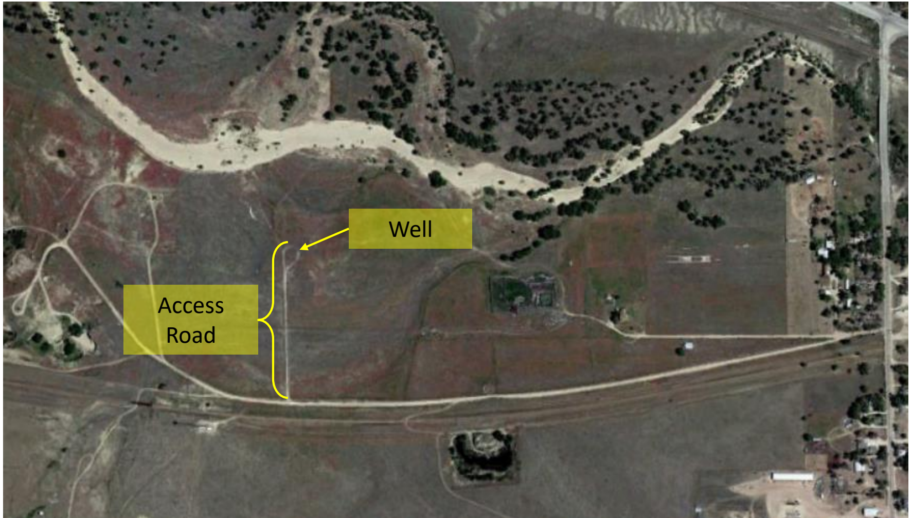
Photo 3: Current available aerial imagery (2017). Photo shows location of well and access road.